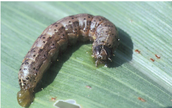
Fall armyworm larva

Fall armyworms may feed on sweet corn at any stage of development. Damage during the early- to mid-whorl stage must be heavy before yield or quality of the crop will be affected. However, feeding during the late-whorl to tasseling stage can severely affect yield. Populations as low as 0.2 - 0.5 larvae per plant can significantly reduce yield of marketable sweet