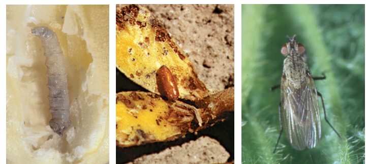
Seedcorn maggot (l-r) larva, pupa, and adult