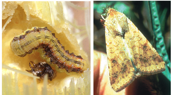
Corn earworm larva and adult