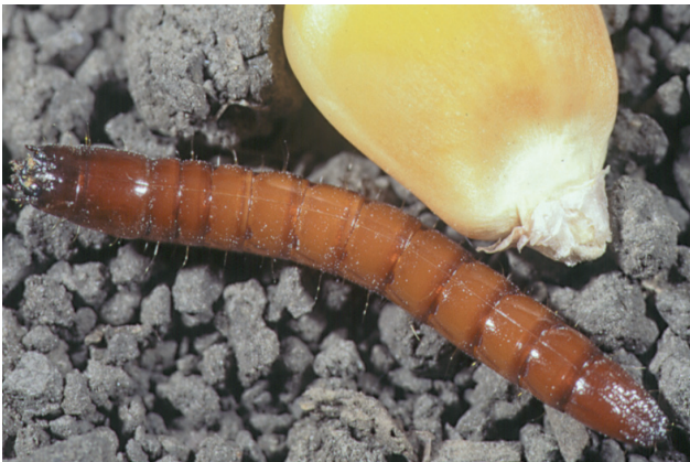
Wireworm larva

Wireworms are slender, hard bodied, wirelike larvae that are yellow to brown and range from 1/2 to 1-1/2 inches long. Wireworms feed on the germ or hollow out corn seeds, or tunnel into roots and shoots of seedlings. Damaged seedlings will usually wilt, with the symptoms first showing up on the youngest leaves. Damage to either seeds or seedlings may result in the death of the plant.