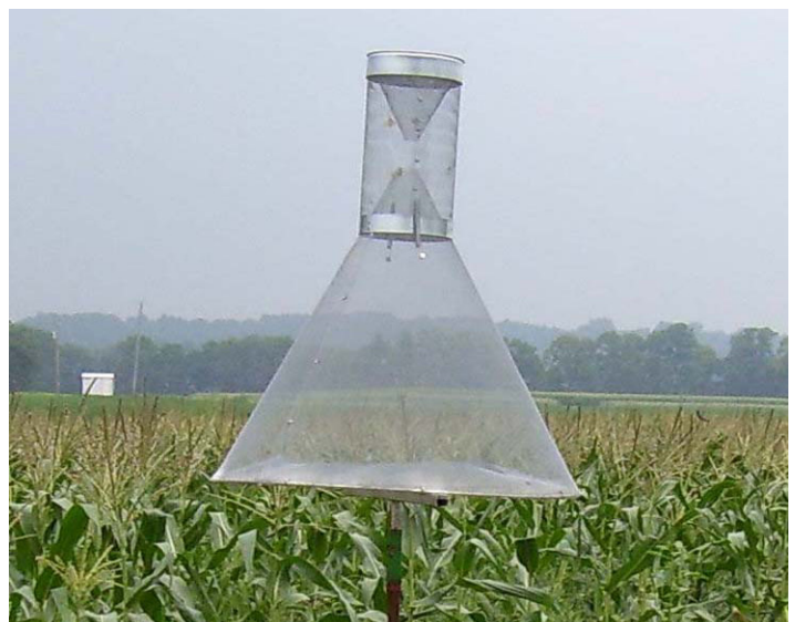
Pheromone trap to monitor corn earworm moths