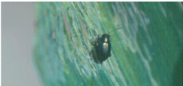
Corn flea beetle

the sum is between 90 and 100, then epidemics of moderate severity are expected. If the sum is greater than 100, then the disease can be expected to be severe and destructive. In those fields where a susceptible variety is being grown and moderate or severe disease pressure is expected, monitor the field on a regular basis. When beetles are first noticed, apply a foliar insecticide. No economic thresholds are available, but populations greater than 10 beetles per plant will usually cause economic losses, even when a Stewart's wilt resistant variety is grown.