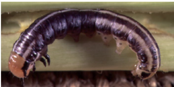
Stalk borer

If stalk borers have not yet bored into the plant, they may be controlled with foliar insecticides. Treat an area of a field if 15-20% of plants in that area show leaf feeding. If the larvae have bored into the plants, then no control is possible.