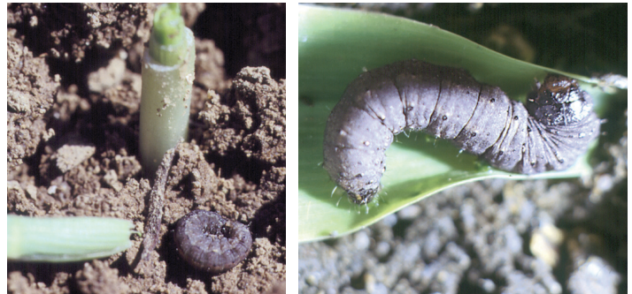
Black cutworm (l) curled with cut plant and (r) open

To scout for cutworms, check 20 consecutive plants in 5 areas of the field. Count the number of cut plants, and try to find the cutworm by digging in the soil around any damaged plant. Generally, a rescue treatment is justified if 5 or more of 100 plants are cut. Remember that the smaller the cutworms, the more feeding they will do in the future. If the cutworms are large, they may be nearing completion of the larval stage and may only do a little more feeding. Do not use a preventive soil insecticide for cutworm control, because the chances of having a problem are relatively low.