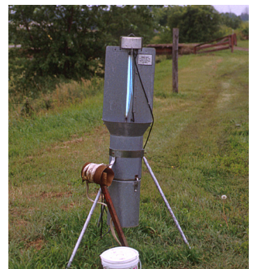
European corn borer adult and black light trap