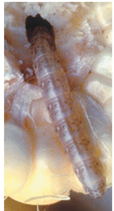
European corn borer egg mass and larva