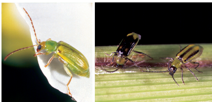
Northern corn rootworm beetle (l) and western male and female beetles (r)

In addition to the larval damage described previously, adult rootworms can damage sweet corn by feeding on silks, which can interfere with pollination. When silks are green, inspect silks on 50 plants per field. If beetles are present and are clipping silks back to the tip of the husk, then treatment may be justified. You may be treating your corn at silking for another insect such as corn earworm or European corn borer. If you are using an insecticide other than the Bacillus thuringiensis based materials (Dipel, Javelin, etc.) or Spintor or Entrust. You can expect it to kill rootworm beetles as well, and no additional treatment is necessary.