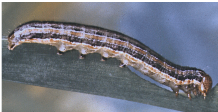
Armyworm larva

problems occur when the larvae have developed on small grains or grassy weeds and then move to corn when the host plants dry down.