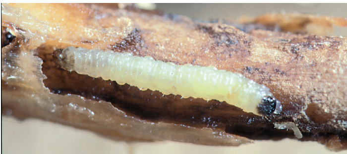
Corn rootworm larva

Once seedcorn maggot damage is detected, the only choices are to either live with the reduced stand or replant the field because there are no rescue treatments available.