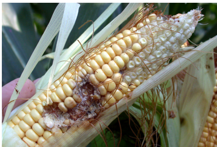
Western bean cutworm eggs, larvae, adult and damage

READ AND FOLLOW ALL LABEL INSTRUCTIONS. THIS INCLUDES DIRECTIONS FOR USE, PRECAUTIONARY STATEMENTS (HAZARDS TO HUMANS, DOMESTIC ANIMALS, AND ENDANGERED SPECIES), ENVIRONMENTAL HAZARDS, RATES OF APPLICATION, NUMBER OF APPLICATIONS, REENTRY INTERVALS, HARVEST RESTRICTIONS, STORAGE AND DISPOSAL, AND ANY SPECIFIC WARNINGS AND/OR PRECAUTIONS FOR SAFE HANDLING OF THE PESTICIDES.