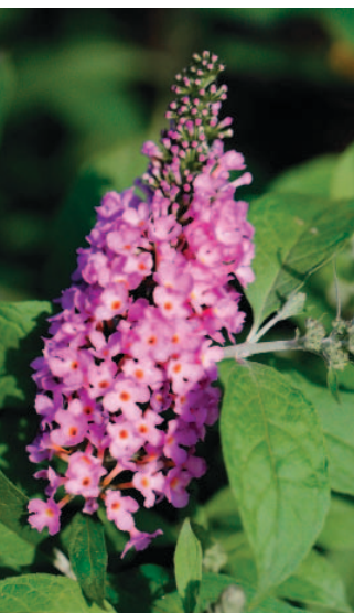
Flutterby Petite™ Tutti Fruitti Pink