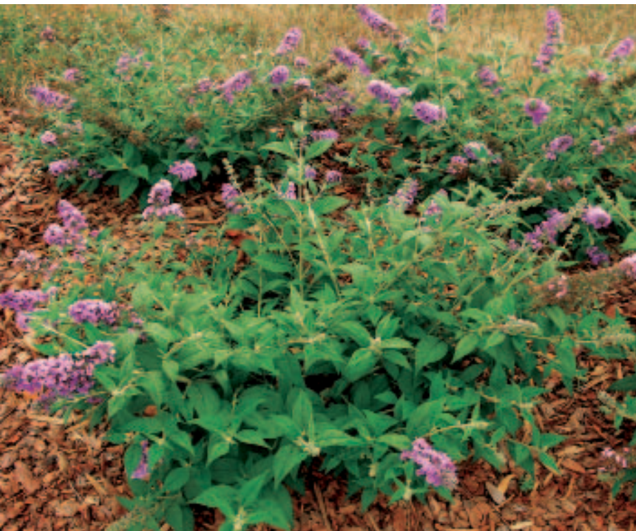
'Blue Chip Jr.'