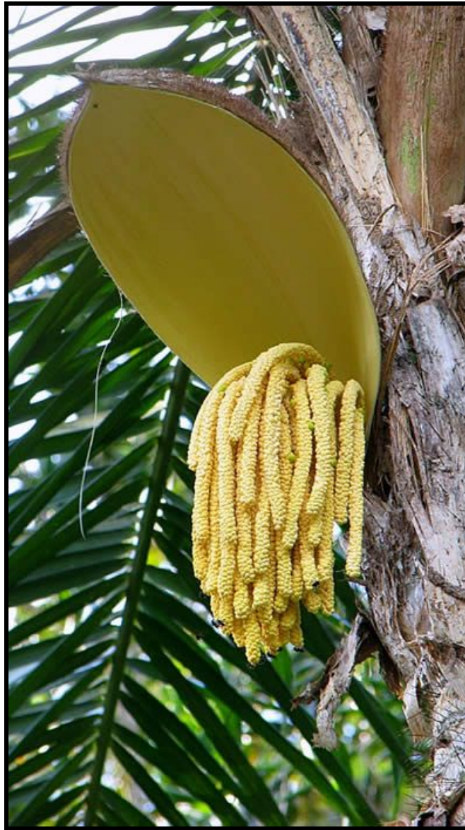
Figure 7. Peach Palm Inflorescences (Popovkin 2008)

to genotypic and nutritious states of the plant. As the Inflorescences develop on the stem, not all the natural product branches can be collected at the time (J.M. Perez 1997).