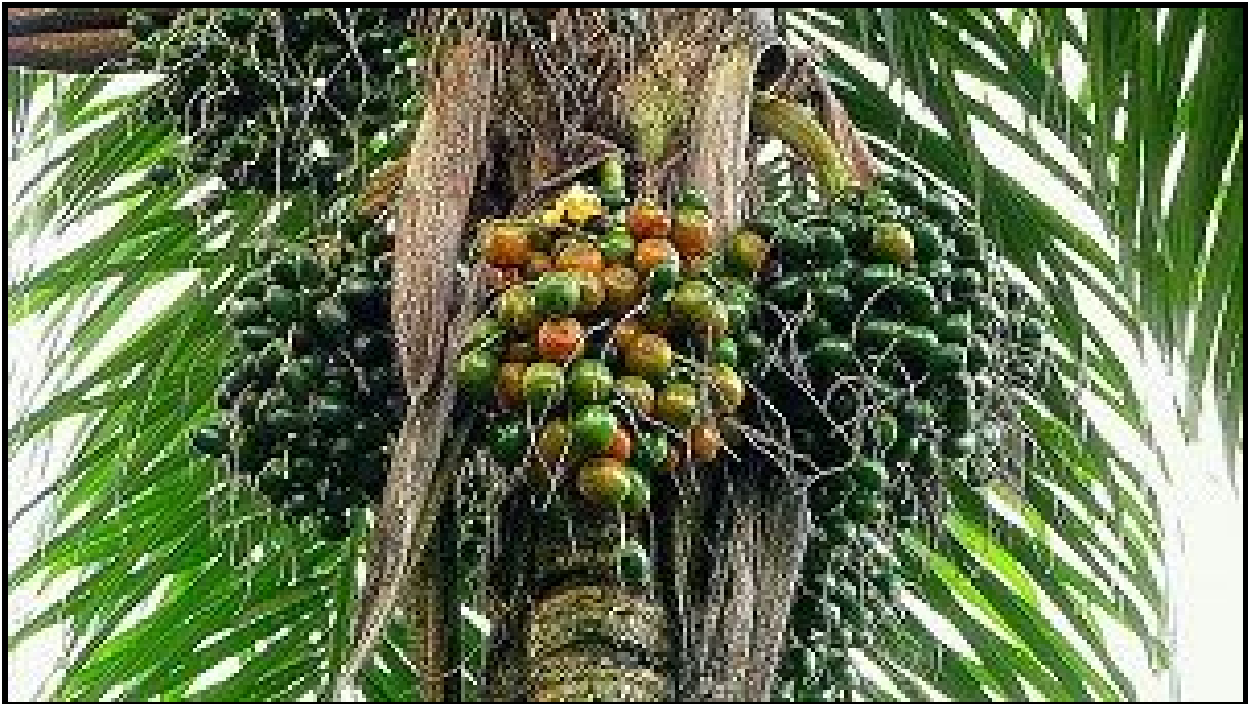
Figure 6. Green coloration shows ripening fruit ready in about 1-2 months(Popovkin 2008)

In the Amazon basin flowering season is from October-December and the harvesting season is from January-April. Fruits mature in 3-4 months but not all are ready at the same(J.M . Perez 1997).