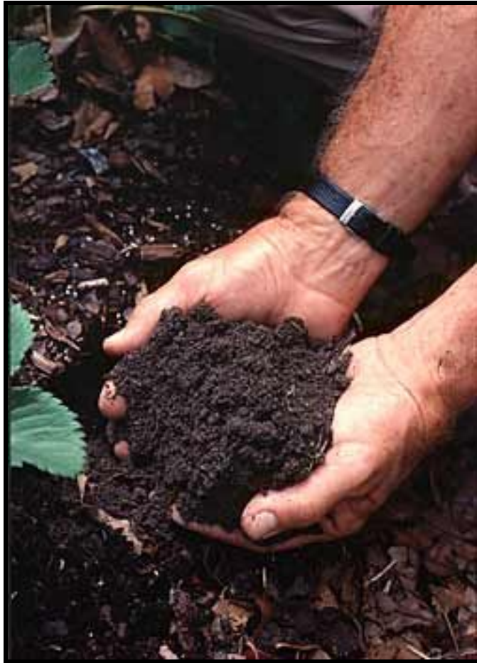
Figure 9. Well drained, crumbly, dark soil ideal for peach palm