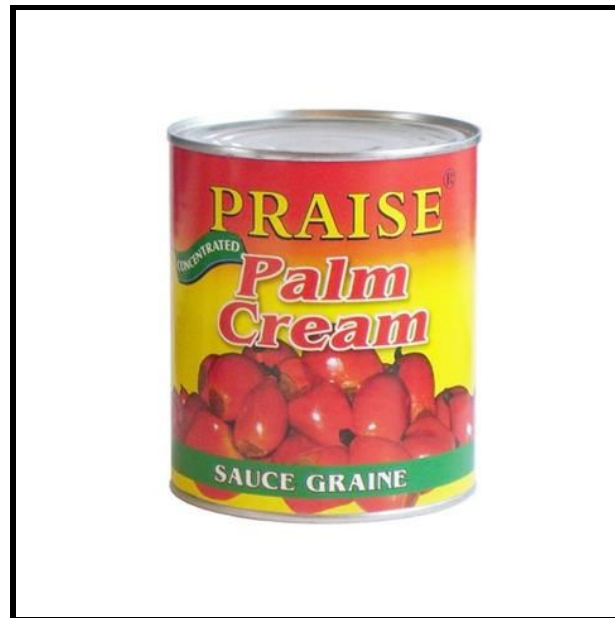
Figure 14. Peach palm has an incredible flavor, creams and pastes are made for a wide variety of different recipes to give an extra touch of flavor.