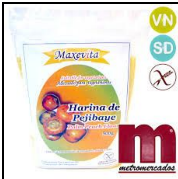
Figure 11. Pejibaye flour is a great option to bake a different flavour pasta or cake.

Heart-of-palm is developing into an important commercial crop, especially for the gourmet market. Fresh, dried and canned hearts-of-palm are being marketed for preparation of salads, soups, roasted chips and fillings. It is a good source of dietary fibre, and a moderate source of magnesium and iron. Commercially produced flour, prepared from fruit mesocarp, was recently introduced into the Costa Rican market for use in infant formula, baked goods, soups and other products. Canned fruits are being marketed in Costa Rica: these include whole or half fruits, either peeled or unpeeled, with or without the seed. (Jorge Mora- Urpi, John C. Weber, & Charles R. Clement, 1997)