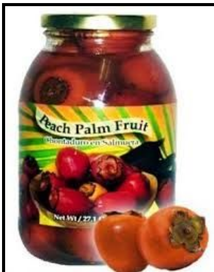
Figure 13. Pickled fruit lets consumer chose their use in the kitchen, from eating alone to using in salads or as decoration.