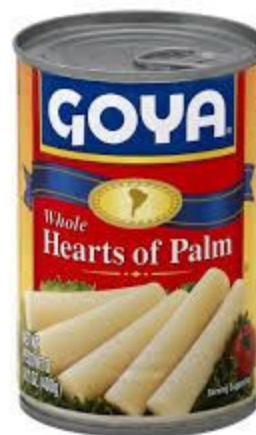
Figure 15. Fried peach palm slices are a great snack somewhat similar to plantain chips. Figure 16. Hearts of palms are the inner trunk