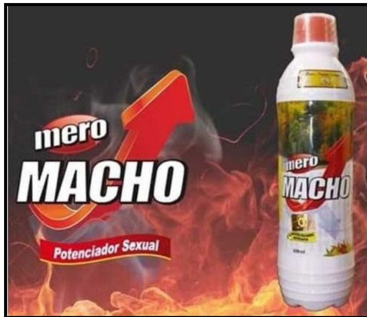
Figure 12. It's said that peach palm has aphrodisiac characteristics, its one of the main ingredients in sexual aphrodisiac drinks.