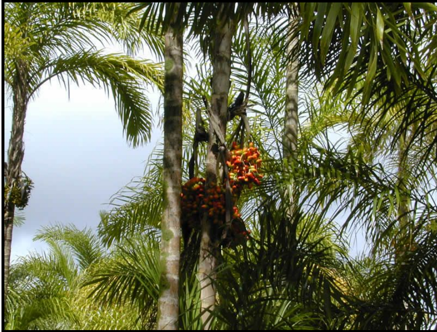
Figure 4. Normally the peach palms grow 2-3 meters apart due to need of direct sunlight for greatest production.