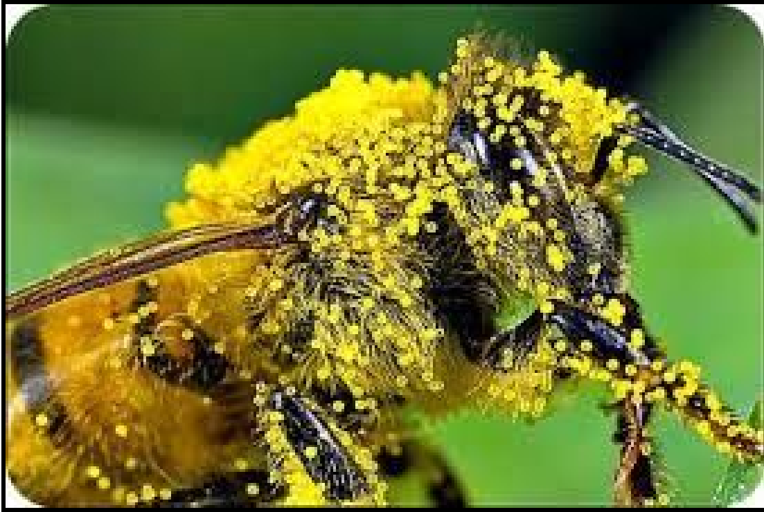
Figure 8. Bee with pollen attached ready to propagate it