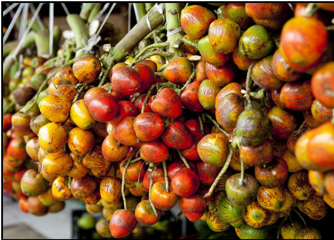
Figure 10. Peach Palm fruit clusters

The eatable natural product hangs in bunches of 50 to 300 foods grown from the ground weight 25 lbs (11.4 kg). There might be up to 5 groups of natural product on a plant at any given moment. The time from blooming to natural product collect is around 8 to 9 months. The organic product is a drupe and is yellow to orange to red or caramel, turning purplish when completely ready. The natural product might be oval or cycle, 1 to 2 creeps in breadth, with a 3-pointed calyx at the stem end. The peel is thin. The mash might be yellow to light-orange, sweet, dry and coarse, organic product more often than not contain just 1 dark seed shut in a thin endocarp. Some natural product are seedless. (Crane, Jonathan H. 2006) There is by all accounts a misconception on the impacts of creepy crawly impregnated plastic packs in controlling the irritation weevils. A few creators prescribe a control of the weevils by covering the natural product packs with blue translucent plastic sacks without bug sprays.