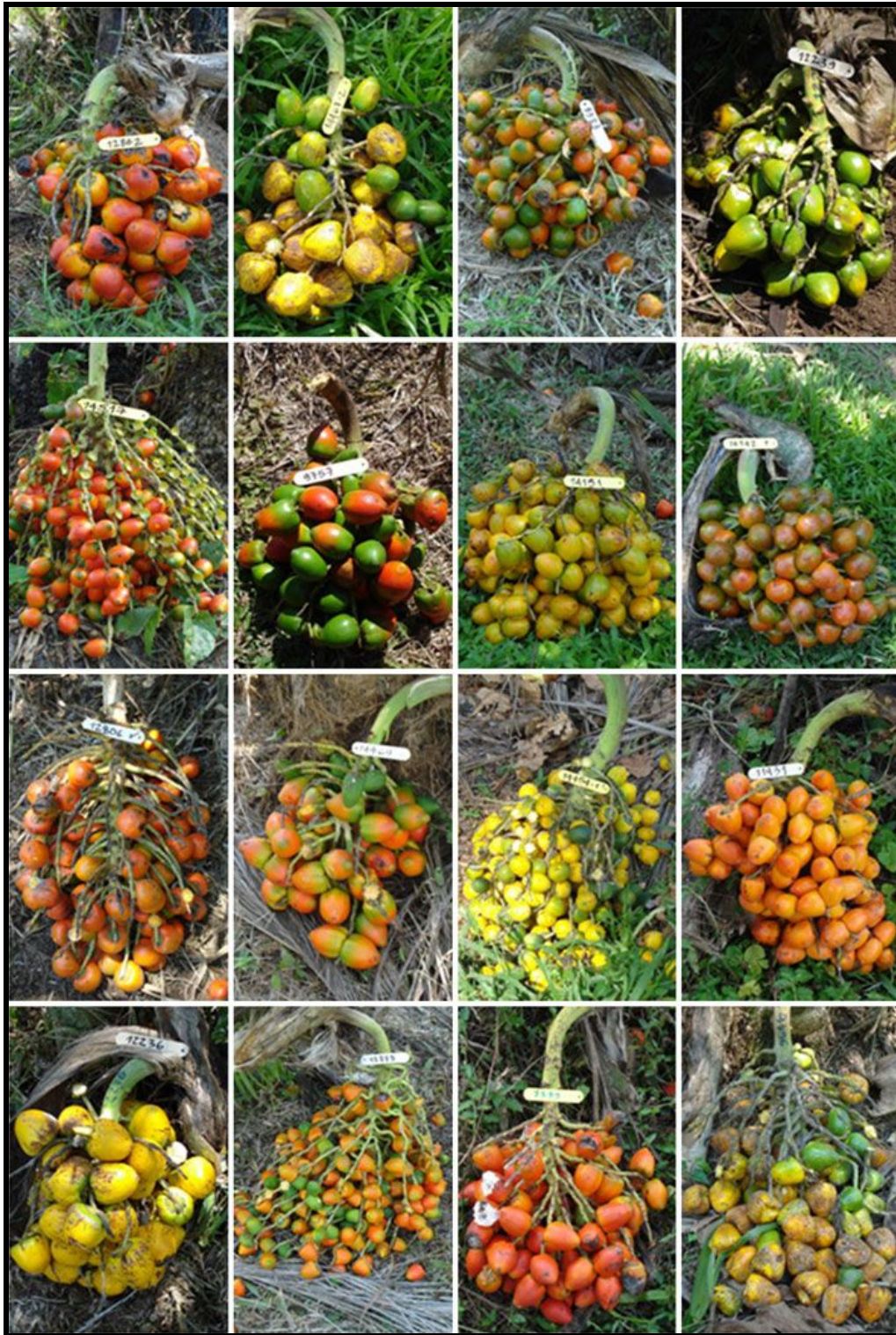
Figure 2. Mature fruit bunches of cultivated peach palm accessions with different country origin; Costa Rica, Trinidad, Panamá, Colombia, Venezuela, and Bolivia. Conserved in the peach palm genebank collection of the Centro Agronómico Tropical de Investigación y Enseñanza (CATIE)