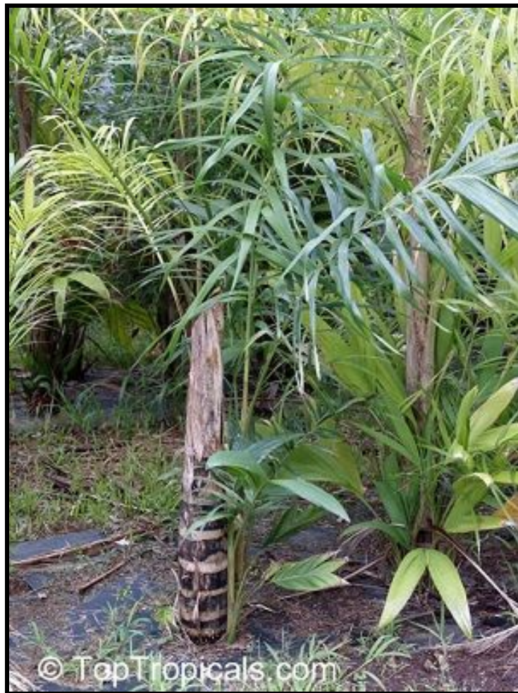
Figure 5. Young Bactris gasipaes

Peach palm generally begins flowering between 3-5 years, and may produce annual fruit crops for 50-70 years(Overbeek 1990).The palm can produce 1 year a very high production rate and then the next 1-2 years a decrease in production(J.M . Perez ,1997) This depends directly to the climate altering the plants system.