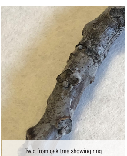
that marks yearly growth.

If you'd like to learn how to identify trees when they don't have leaves, The Winter Tree Finder is a nice resource.