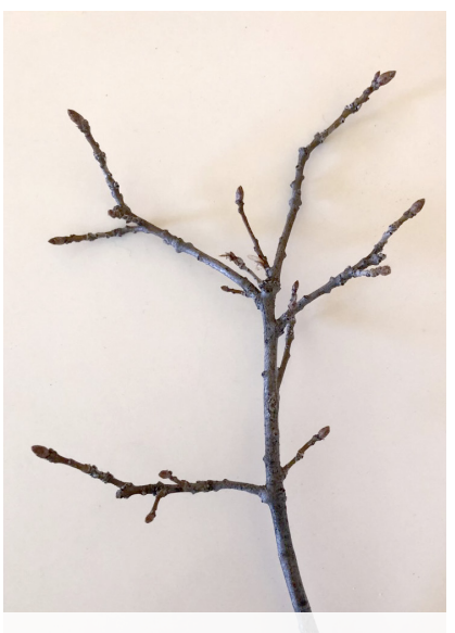
Twigs from oak tree showing alternate branching pattern.