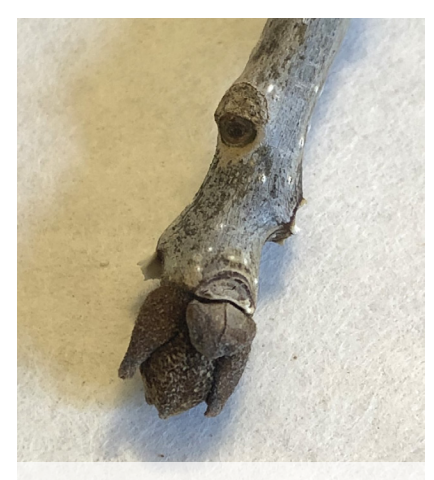
Twig from ash tree showing new buds and scars where leaves were attached last year.