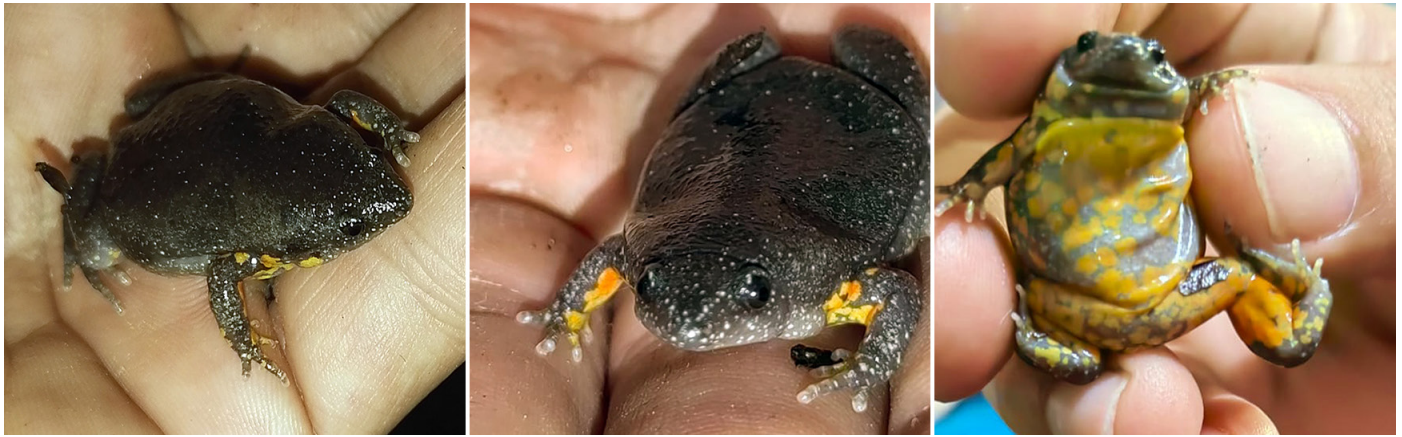
Fig. 2. The first recorded Plump Frog ( Elachistocleis pearsei) from Costa Rica (UTADC 9751A–D).

On 8 July 2022, we revisited the area in search of additional individuals. Despite an intensive search, we could not find any, as the weather was quite dry (two days without any rain). However, we were able to assess the habitat, which consists largely of Oil Palm ( Elaeis guineensis ) monoculture and associated human habitations in the small villages of Laurel and Mango where oil palm workers live. The habitat is completely altered (Fig. 1C) but species in the genus Elachistocleis are known to tolerate contaminated or altered water. We did observe several species of amphibians including: Scinax elaeochroa , S. boulengeri , Boana rosenbergi , Dendropsophus ebraccatus , D. microcephalus (Hylidae), Engystomops pustulosus , Leptodactylus fragilis , L. insularum , L. poecilochilus , L. savagei (Leptodactylidae), and Agalychnis callidryas (Phyllomedusidae).