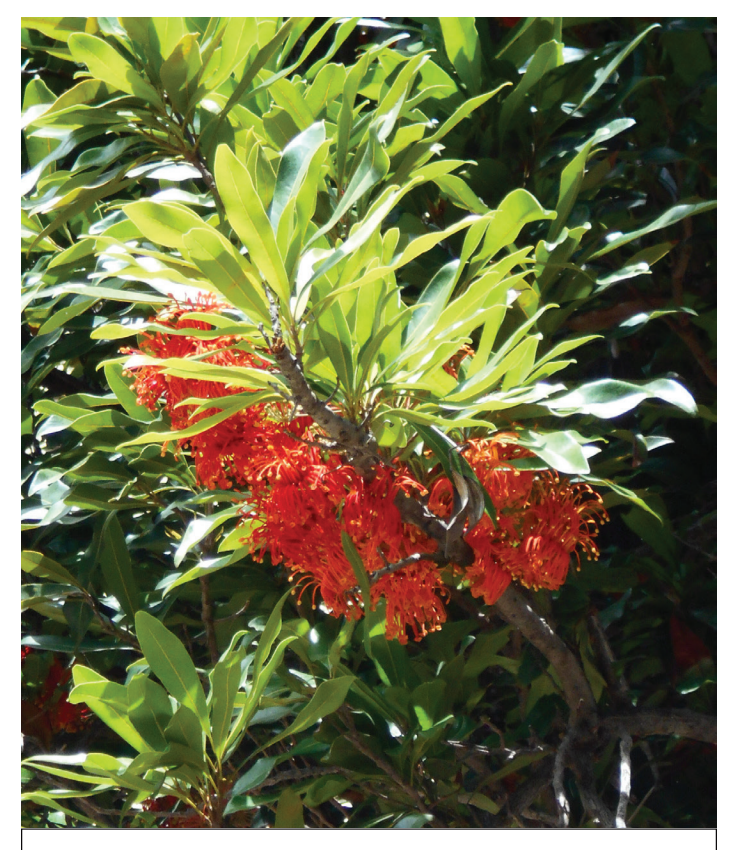
Figure 3. Mature foliage of the firewheel tree.