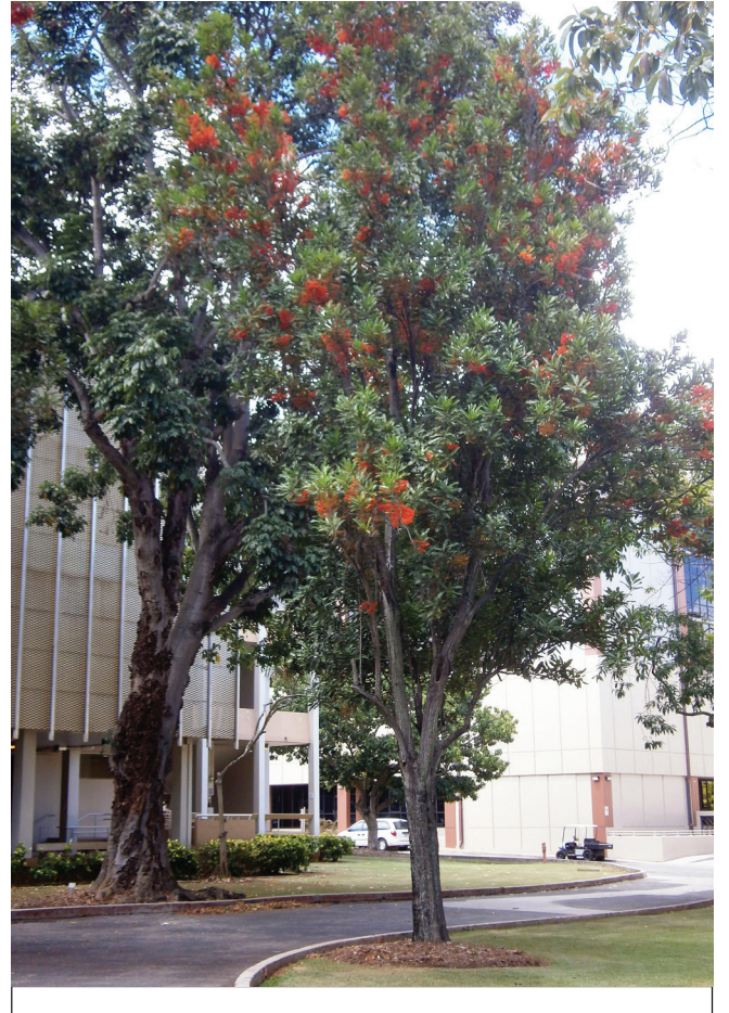
Figure 1. Stenocarpus sinuatus on the University of Hawai'i at Mānoa campus.