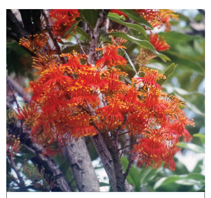
Figure 4. Flower clusters of the firewheel tree.

Published by the College of Tropical Agriculture and Human Resources (CTAHR) and issued in furtherance of Cooperative Extension work, Acts of May 8 and June 30, 1914, in cooperation with the U.S. Department of Agriculture, under the Director/Dean, Cooperative Extension Service/CTAHR, University of Hawai'i at Mānoa, Honolulu, Hawai'i 96822. Copyright 2020, University of Hawai'i. For reproduction and use permission, contact the CTAHR Office of Communication Services, <u>ocs@ctahr.hawaii.edu</u>, (808) 956-7036. The university is an equal opportunity/affirmative action institution providing programs and services to the people of Hawai'i without regard to race, sex, gender identity and expression, age, religion, color, national origin, ancestry, disability, marital status, arrest and court record, sexual orientation, or status as a covered veteran. Find CTAHR publications at <u>www.ctahr.hawaii.edu/freepubs</u>.