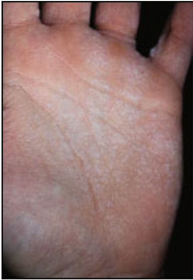
Fig. 6. Aquagenic keratoderma.

first described this hereditary condition manifesting with persistent yellowish-white translucent papules and plaques that appear during puberty and are associated with fine-textured scalp hair and an atopic diathesis. Unlike hereditary papulotranslucent acrokeratoderma, acquired aquagenic PPK is transient, is not associated with fine scalp hair and atopic diathesis, and tends to respond to topical therapeutic interventions. [88] More than ten cases of aquagenic PPK have been reported in the literature, primarily involving younger females aged 9–33 years; however, most recently (in 2006), this condition has also been reported to occur in young males. [89,90] The keratoderma is characterized as transient, recurrent, bilateral and symmetric, mildly symptomatic, with translucent-to-whitish papules with central puncta (figure 6). The eruption disappears spontaneously within minutes to hours after drying of the palms. [86-95] The condition has also been associated with cystic fibrosis, and has been described in patients with the delta F508 mutation. [96,97] As such, cystic fibrosis should be considered in patients with aquagenic keratoderma, and patients with cystic fibrosis should be asked about symptoms of this condition. Avoiding water exposure in acral surfaces, aluminum chloride hexahydrate, and barrier agents containing petrolatum have been useful treatments. [86-101]