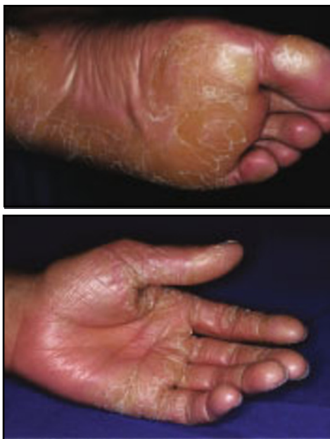
Fig. 4. Pityriasis rubra pilaris.

As noted above, treatment of any identified underlying neoplasm is the treatment of choice for paraneoplastic keratodermas. In addition, etretinate treatment has been reported to be effective in the treatment of PPK in patients with widespread metastases, and acitretin could therefore be considered in recalcitrant cases or