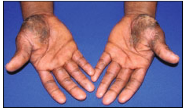
Fig. 5. Acquired keratoderma caused by chronic cutaneous lupus erythematosus.

in cases in which the underlying neoplasm cannot be eradicated. [78,79,107]