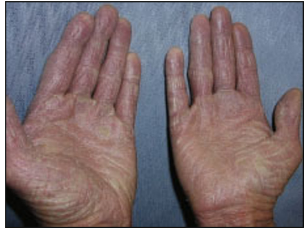
Fig. 3. Sézary syndrome.

Isolated nonspecific keratoderma has been reported as a paraneoplastic marker for internal malignancy, and can also present as a clinically unique paraneoplastic type of keratoderma called tripe palms. [3,48-76] Acquired PPK has been noted to be associated with esophageal, lung, bronchial, breast, urinary bladder, gastric, colon, and skin cancer. [48-56] In addition, there has been of a report of a patient with diffuse planar xanthomatosis, myeloma, and acquired PPK, which indicates a possible relationship between paraproteinemia and keratoderma. [57] Sézary syndrome (figure 3) is commonly associated with palmoplantar hyperkeratosis, although non-