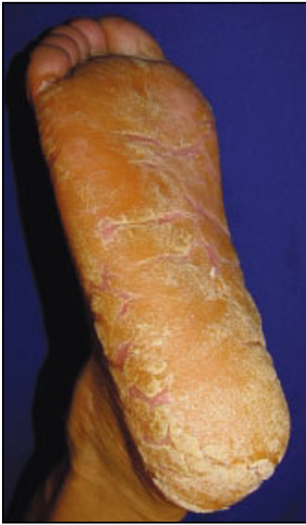
Fig. 8. Idiopathic acquired palmoplantar keratoderma in a patient with no family history of keratoderma and no evidence of malignancy to date.