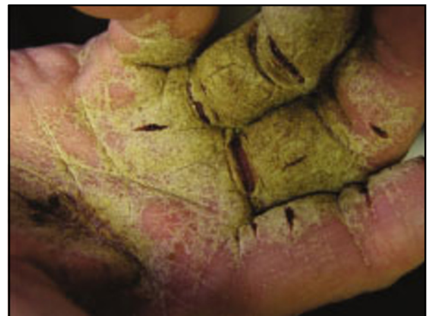
Fig. 7. Encrusted scabies.

Idiopathic acquired PPK should be reserved as a diagnosis of exclusion, when all other etiologies have been investigated and ruled out. They may present in any of the characteristic distributions, including diffuse, focal, and punctate. Idiopathic filiform parakeratotic PPK was described in a patient with no familial dermatologic conditions who developed thickening of his palms and soles over a 10-year period. [105] On examination, the patient had discrete filiform keratotic seed-like plugs on the volar surfaces of his palms and soles. Parakeratotic plugs were present on biopsy; however, the clinical and histologic features did not correlate with other forms of hereditary punctate keratoderma. The patient later developed bronchial carcinoma 10 years after the initial keratoderma development, so it remains unknown whether the keratoderma was idiopathic or a premalignant marker. It should be noted that palmoplantar filiform parakeratotic hyperkeratosis associated with digestive adenocarcinoma has also been reported. [106] Therefore, the diagnosis of idiopathic acquired PPK should be reserved for cases in which another cause cannot be determined (figure 8).