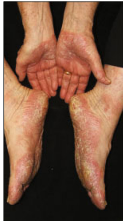
Fig. 2. Keratoderma climactericum.

Use of other medications such as verapamil, a calcium channel antagonist, and quinacrine, an antimalarial, has been reported to result in hyperkeratosis. However, determination that use of these drugs is causing PPK should depend upon consideration of the involved surface area of the palmar and/or plantar surfaces in the affected patient. Verapamil has been implicated in the etiology of palmoplantar hyperkeratosis together with other cutaneous adverse reactions including pruritus and rash. [39] Quinacrine has also been reported to result in inflammatory skin reactions, including