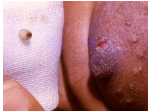
Fig. 3 Tungiasis—ectopic tungiasis occurring in the breast and the removed parasite.

The female flea burrows into the skin of its host, starting a complex 5-stage sequence of structural and morphological changes. The cycle is accompanied by different degrees of inflammatory reaction, known as the Fortaleza classification . 22,23 The first stage corresponds to the penetration of the gravid flea, achieved at an angle of 45° to 90° and taking 30 minutes to 7 hours to be completed (average of 3 hours). During this period, the second and third abdominal segment