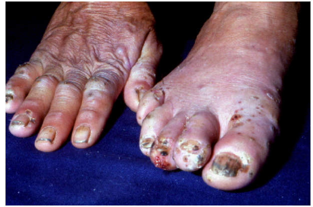
Fig. 2 Tungiasis—massive infestation of hand and feet in a cattle handler. (Courtesy: Dermatology Service, Santa Casa de Misericórdia, Porto Alegre, Brazil).

tungiasis in endemic communities shows a peak incidence between August and September, which corresponds to the peak of the dry season in the tropical southern hemisphere. 9,18