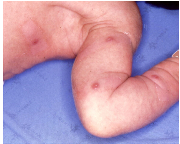
Fig. 6 Furunculoid myiasis—multiple infection by D hominis larvae in a 28-day-old neonate.

Larvae that feed on organic decaying matter and “accidentally” infect preexisting ulcers, tumors, and necrotic or infected lesions are said to cause cavitary or secondary myiasis (Fig. 7). Maggots are usually noticed by virtue of