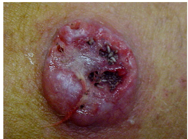
Fig. 7 Cavitary myiasis—epidermoid carcinoma with areas of hyperplasia and ulceration invaded by numerous maggots.

The simplest form of treatment is to occlude the larval respiratory orifice using an occlusive agent. Commonly used substances include liquid paraffin, petrolatum, wax, resins, glue, adhesive tape, nail polish, chewing gum, and