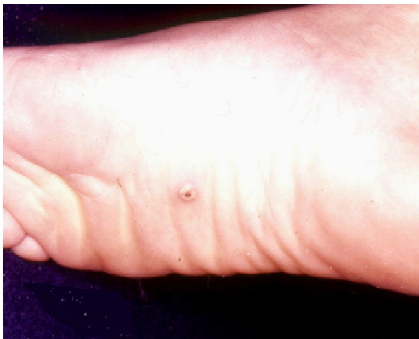
Fig. 1 Tungiasis—isolated lesion on the lateral feet that corresponds to the parasite's maximum growing stage and that is presented as a white nodule with a central opening.

Tungiasis occurs in underdeveloped communities in the rural hinterland, in secluded fishing villages along the coast, and in the slums of urban centers. The seasonal variation of