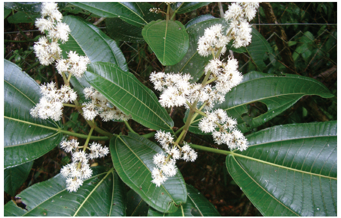
Flower panicles of Miconia calvescens

Miconia racemosa , Miconia nervosa and Miconia cionotricha are scrambling shrubs that may reach a height of about 3 m.