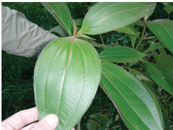
Miconia nervosa leaf