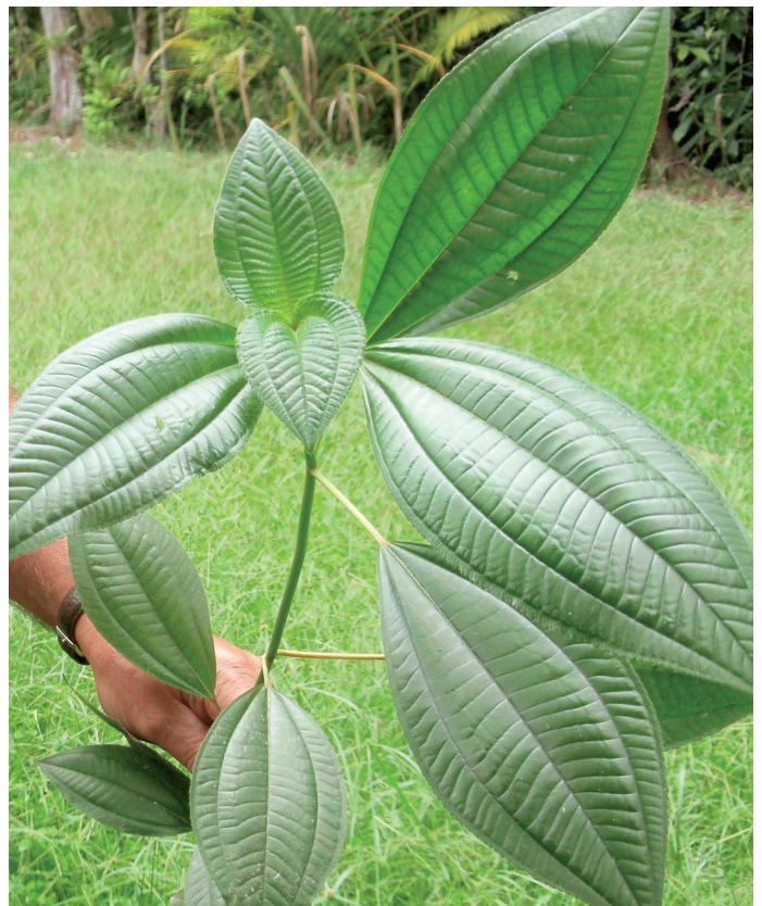
Leaves of Miconia racemosa , showing the distinct three-lateral vein pattern

Miconia racemosa has leaves which can grow up to 20 cm long. Each leaf has five distinct veins that all begin and end at the same points at the base and tip. The smaller, transverse veins make a deep 'quilted' pattern on the leaf surface. Leaves form in opposite pairs.