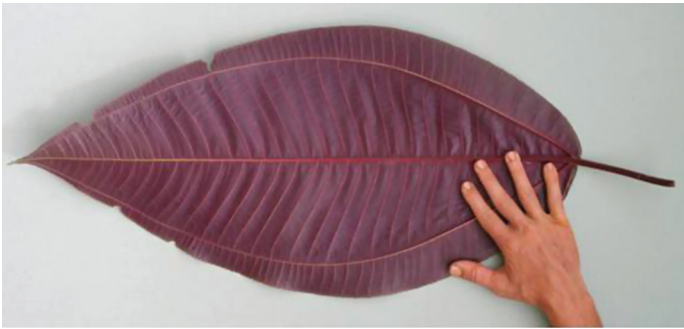
The underside of a Miconia calvescens leaf Note the large size and the iridescent purple colour

Miconia calvescens is a small tree (up to 15 m), with large leaves up to 70 cm long. The underside of the leaves is a distinct, deep iridescent purple. Three large veins on each leaf, running from the base to the tip, can also help identify this plant.