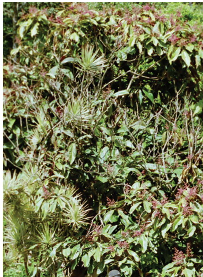
Miconia calvescens in fruit

Further information is available from your local government office, or by contacting Biosecurity Queensland on 13 25 23 or visit biosecurity.qld.gov.au .