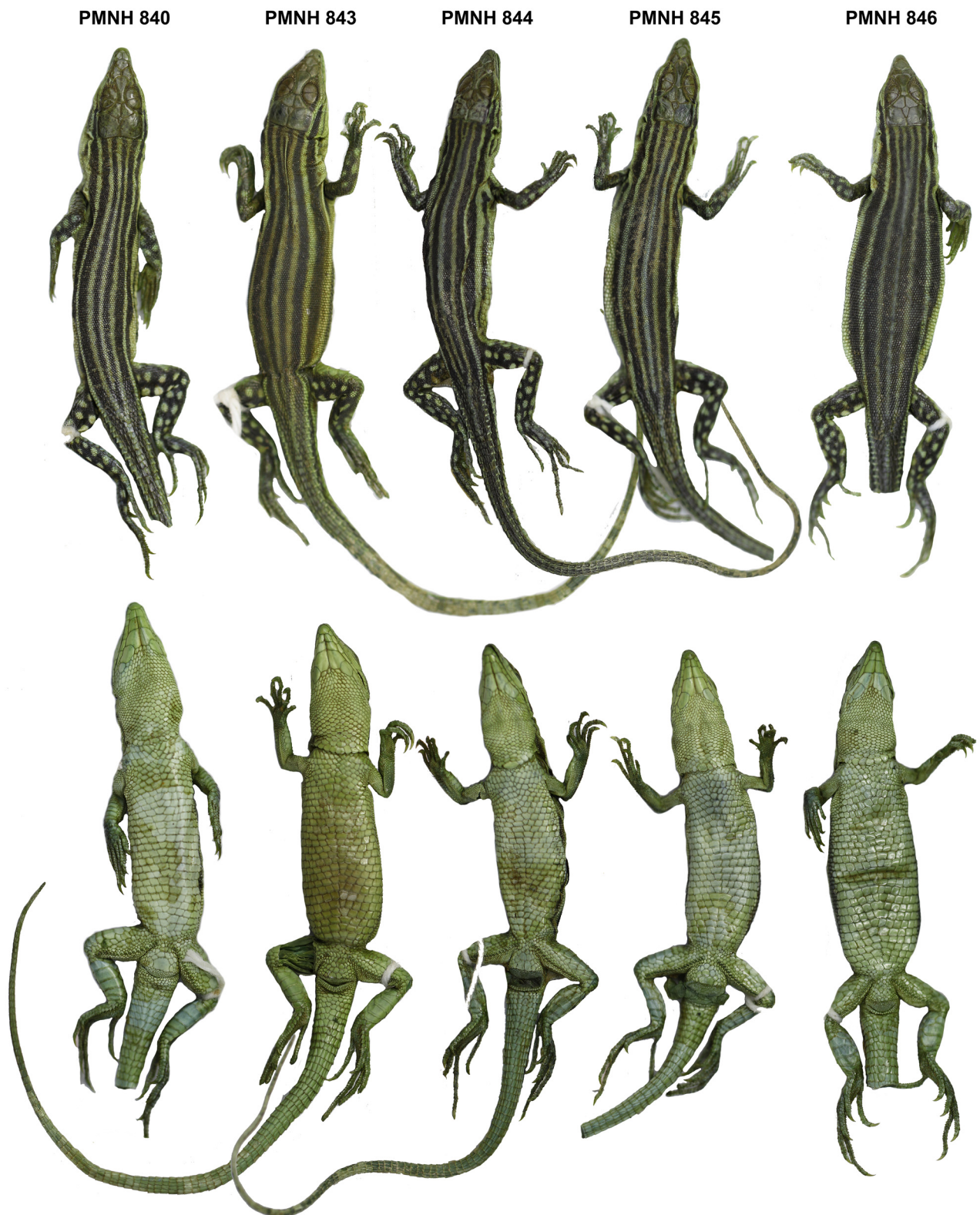
FIGURE 3. Paratypes of Eremias kakari sp. nov. PMNH 840, 843–846 dorsal (above) and ventral (below) view.

Coloration in life. Color creamy beige in life with eight dark brown longitudinal stripes on body dorsum (including the two narrow stripes on flanks) and an additional short median stripe (nuchal) originating from the junction of parietals; seven stripes appear on the neck, the nuchal stripe runs for a short distance on the neck and disappears on shoulders; the two lateral-most stripes (not of flanks) on each side of the body broader, the two