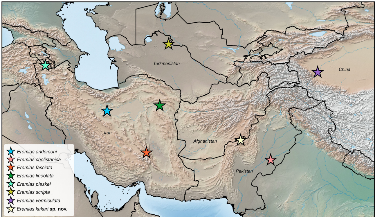
FIGURE 1. The type localities of the members of the subgenus Rhabderemias including the new species, Eremias kakari sp. nov.