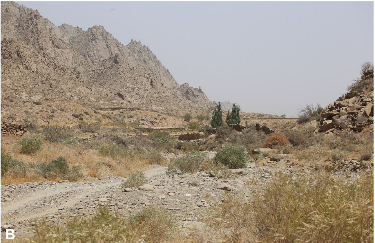
FIGURE 7. The type locality and habitat of Eremias kakari sp. nov. near the Tanishpa village, Toba Kakar Range: A—cultivated orchards along the type locality; B—type locality of E. kakari sp. nov.