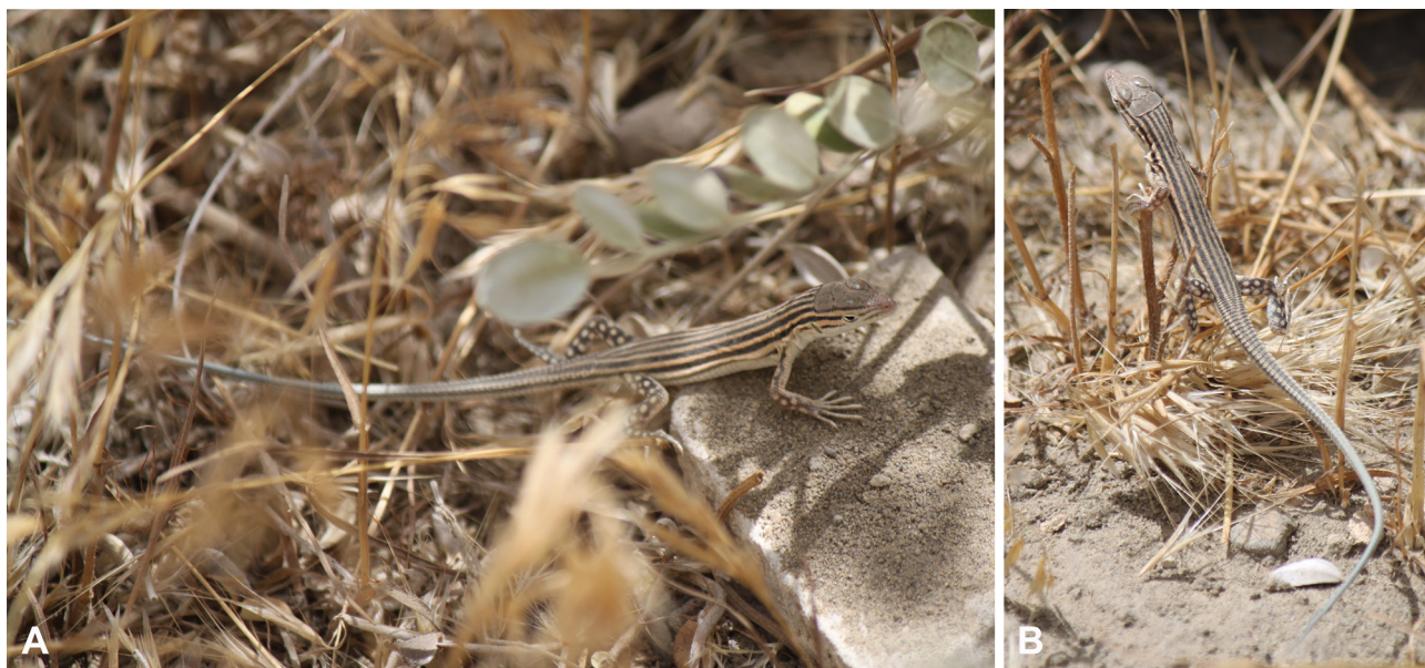
FIGURE 6. Live individuals of Eremias kakari sp. nov. in type locality: A—paratype PMNH 4048, adult, male; B—paratype PMNH 4092, subadult.

Sexual and age dimorphism. Apparently, males attain larger sizes than females in E. kakari sp. nov. : male SVL to 52.2 mm, female SVL 47.5 mm. Moreover, males have generally longer hindlimbs and shorter trunk as compared to females. For a larger female having SVL of 47.5 mm (PMNH 846), the hindlimb is 27.8 mm against a smaller-sized male (PMNH 840, SVL 46.8 mm) which has a hindlimb length of 29.4 mm. Similarly, the trunk length of a smaller female (PMNH 846, SVL 47.5 mm) is 24.1 mm against a larger male (PMNH 842, SVL 52.1 mm) which has a trunk length of 23.1 mm. The dorsal body color and pattern are, however, similar in juveniles and adults of both genders (Fig. 6A, B).