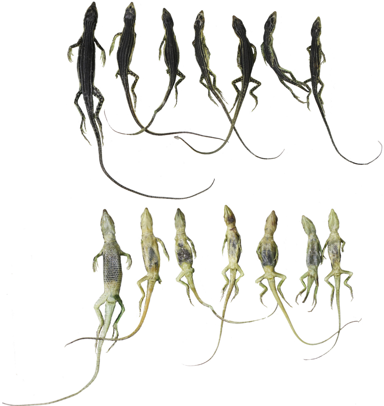
FIGURE 4. Paratypes of Eremias kakari sp. nov. PMNH 4048, 4092–4097 dorsal (above) and ventral (below) view.

PMNH 4048 PMNH 4092 PMNH 4093 PMNH 4094 PMNH 4095 PMNH 4096 PMNH 4097