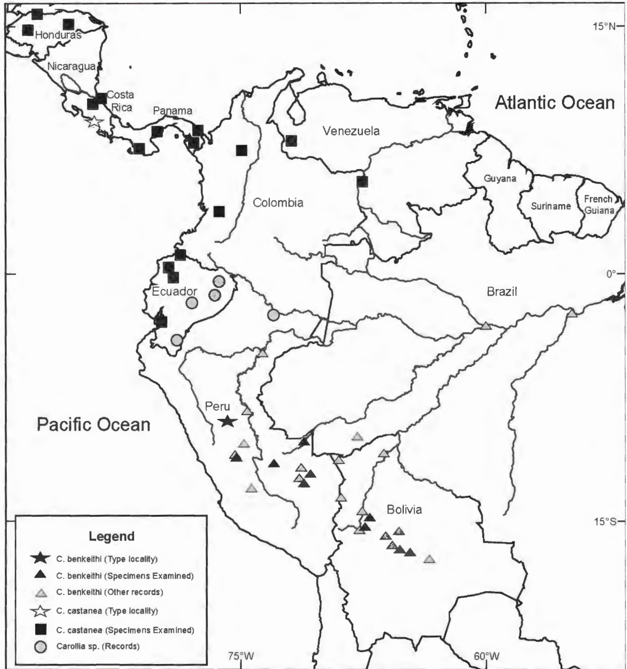
Figure 1. Distribution of the three species of the Carollia castanea species complex. Localities for C. benkeithi , new species, as determined by specimens examined and literature references. The stars represent type localities for C. benkeithi and C. castanea . Some localities are lumped for purposes of graphic representation.