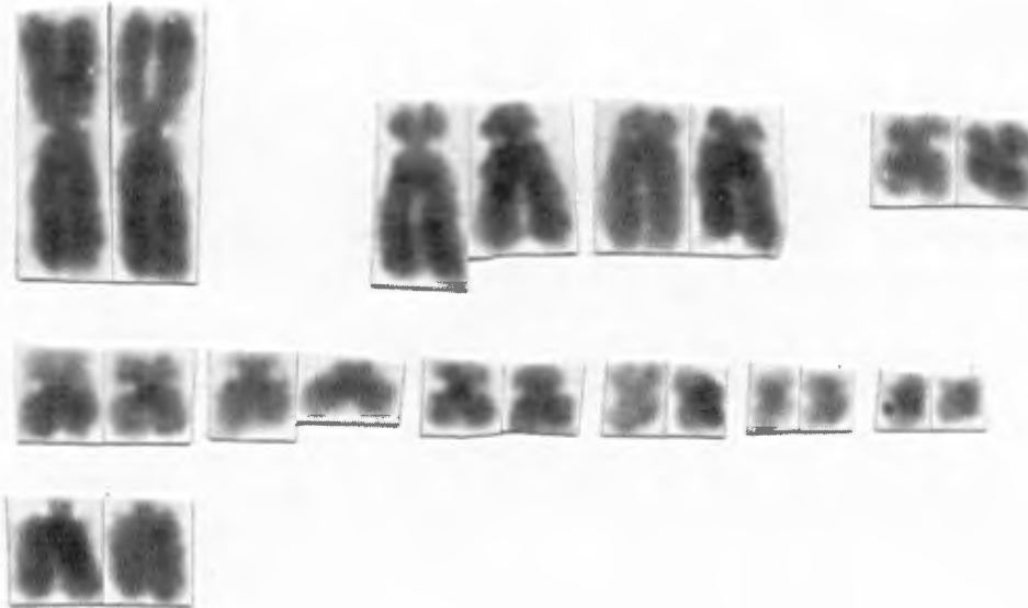
Figure 3. Karyotype of a female specimen of Carollia benkeithi , MVZ 136462.

Comparisons. —We provide comparisons of Carollia benkeithi with samples of C. castanea , within which it usually has been included (Pine 1972; Koopman 1993). In the absence of a more accurate understanding of the degree of variation within and among populations of C. castanea , we assume that populations from Costa Rica, where the type locality is located, are representatives of that species. However, a full review of the variation in this group of species is beyond the objectives of this study. When more voucher specimens are accompanied by sequence and chromosomal data, such analysis will provide the most powerful resolution.