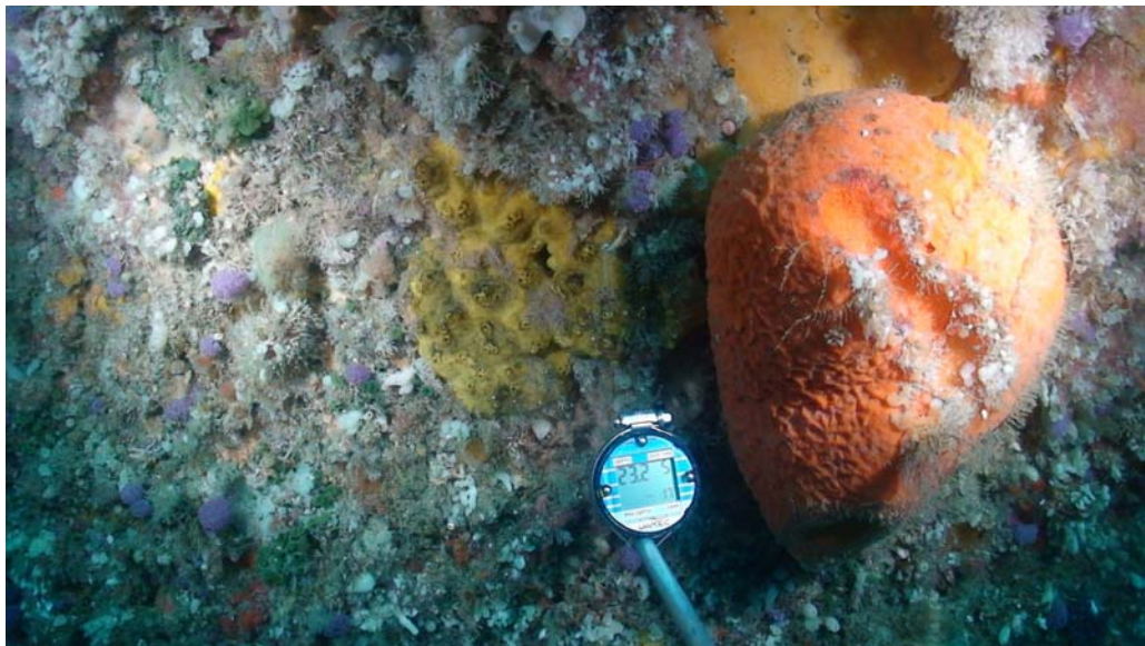
Figure 9 Still photo from the diver operated underwater camera showing an orange massive sponge ( Stelletta sp.) and a rich assemblage of encrusting ascidians and bryozoans at 23.2 m depth.

sampling unit (Fig. 9). From each quadrat, the benthic habitat was classified (e.g. kelp forest or mixed algae), and counts and estimates of the reef coverage of all major categories of invertebrates and macroalgae were recorded. Each photo contained time, date, and depth information while the transect start point was GPS-ed enabling these data to be combined with the dropped camera data and integrated with the multi-beam maps.