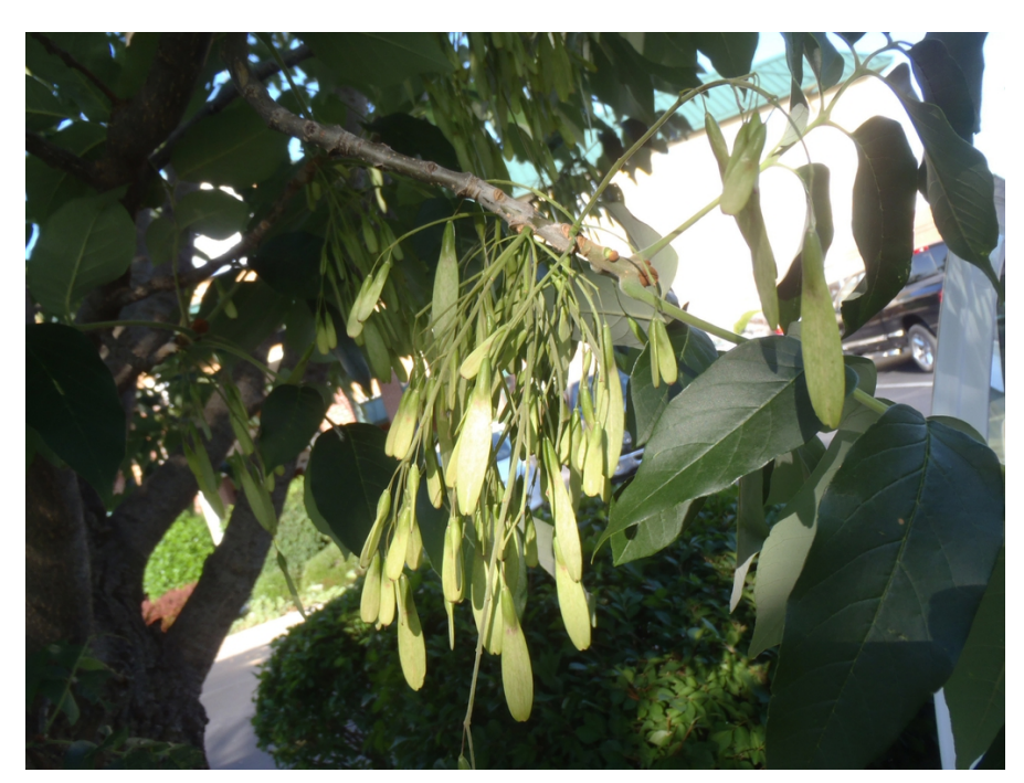
Fruits Jim Robbins CC BY-NC-ND 4.0