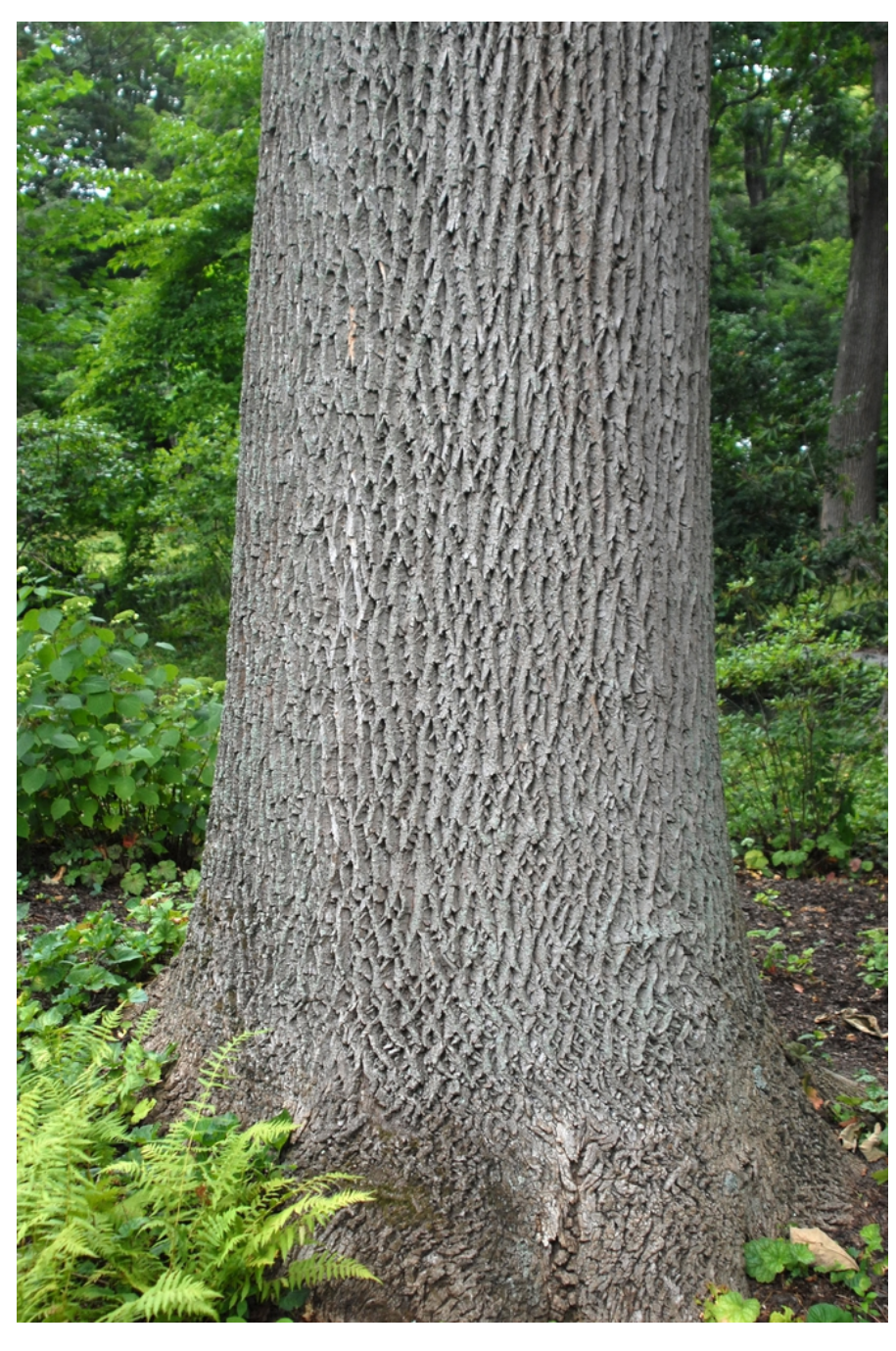
Bud Jim Robbins CC BY-NC-ND 4.0