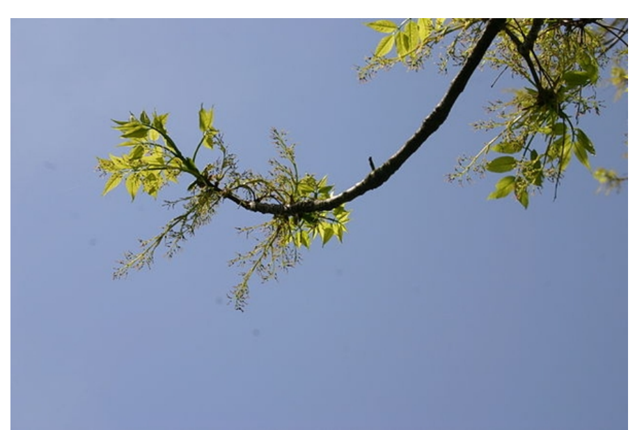
Flower S.B. Johnny CC BY-SA 3.0