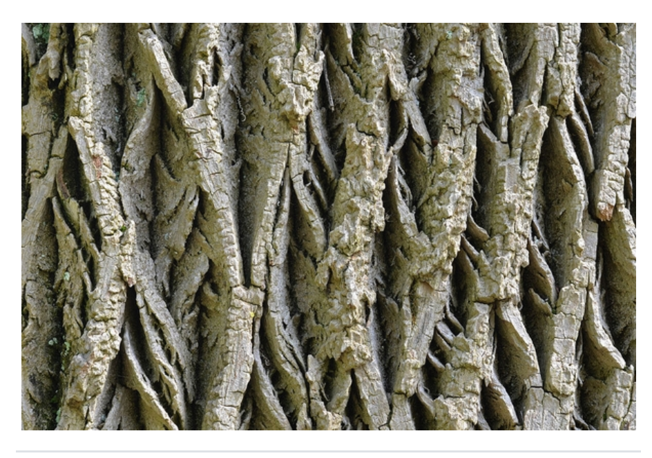
Bark Derek Ramsey CC BY-SA 4.0