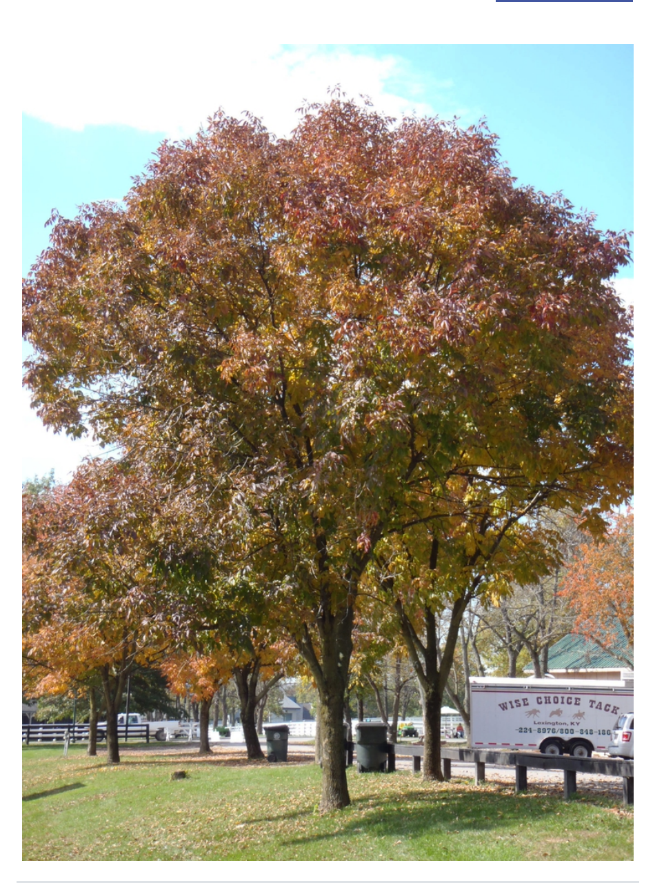
Fall Color Tree