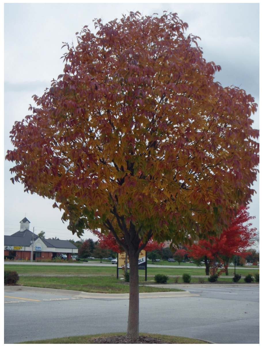
Fall Form Jim Robbins CC BY-NC-ND 4.0