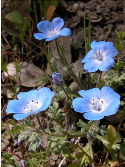
Baby Blue-eyes Nemophila menziesii var. menziesii Native Annual Waterleaf Family