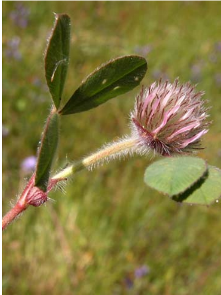
Rose Clover Trifolium hirtum Introduced Annual Pea Family