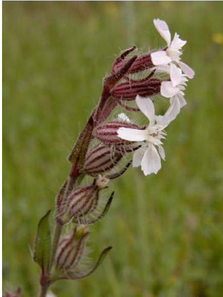
Windmill Pink Silene gallica Introduced Annual Pink Family