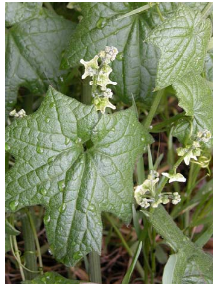
Common / California Manroot Marah fabaceus Native Perennial Gourd Family