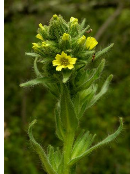
Common / Coast Tarweed Madia sativa Native Annual Sunflower Family