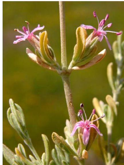
Alkali Heath Frankenia salina Native Perennial Frankenia Family