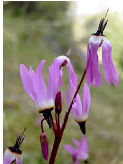
Mosquitobills Shooting Star Dodecatheon hendersonii Native Perennial Primrose Family