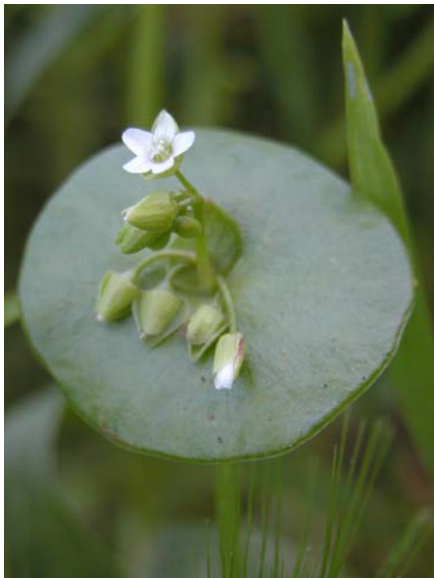
Common Miner's Lettuce Claytonia perfoliata ssp. perfoliata Native Annual Purslane Family