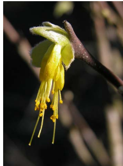
Western Leatherwood Dirca occidentalis Native Perennial Daphne Family