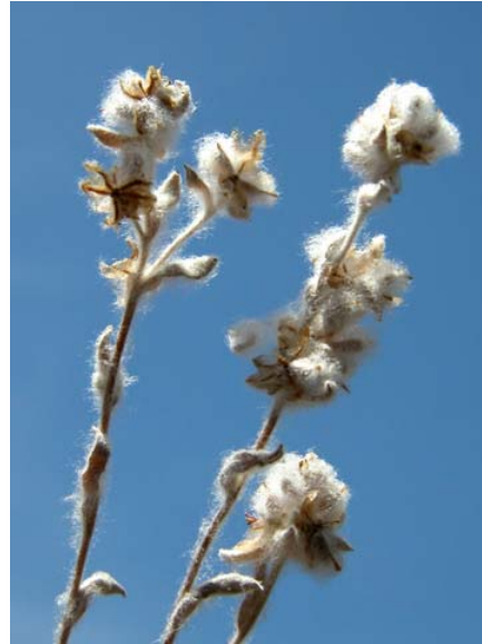
Slender Cottonweed Micropus californicus var. californicus Native Annual Sunflower Family