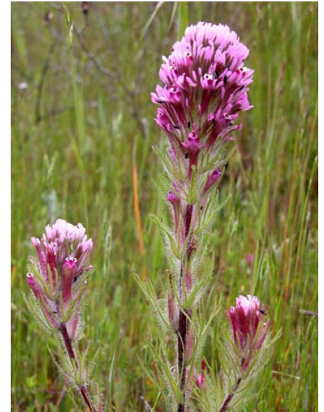
Purple Owl's Clover Castilleja exserta ssp. exserta Native Annual Snapdragon Family