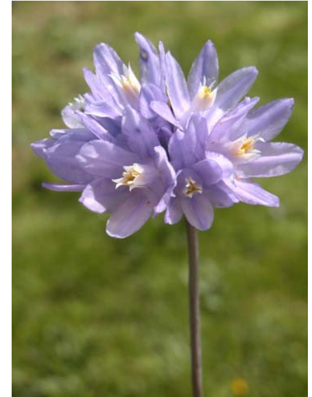
Blue Dicks Dichelostemma capitatum ssp. capitatum Native Perennial Lily Family