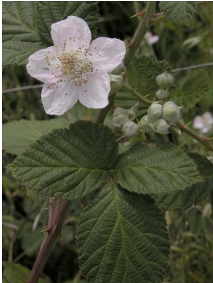
Himalayan Blackberry Rubus discolor Introduced Perennial Rose Family