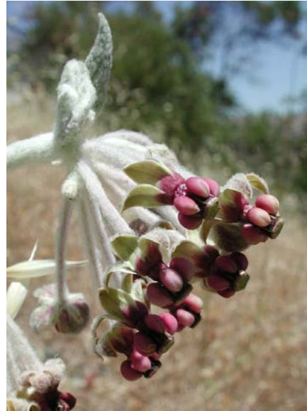
California Milkweed Asclepias californica Native Perennial Milkweed Family