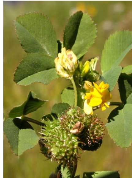
California Bur Clover Medicago polymorpha Introduced Annual Pea Family