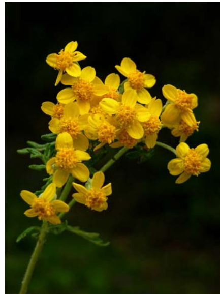
Golden Yarrow Eriophyllum confertiflorum var. confertiflorum Native Perennial Sunflower Family