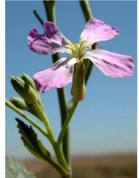
Wild Radish Raphanus sativus Introduced Annual Mustard Family