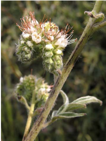
Rock Phacelia Phacelia imbricata ssp. imbricata Native Perennial Waterleaf Family