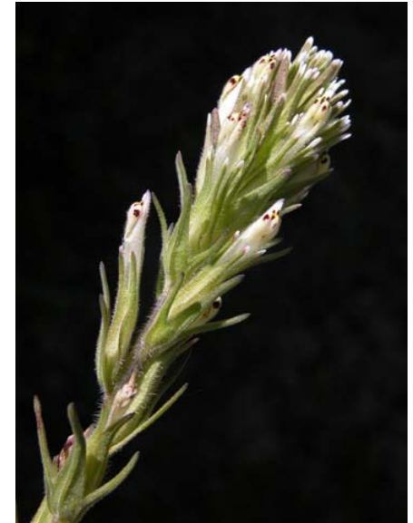
Valley Tassels Castilleja attenuata Native Annual Snapdragon Family