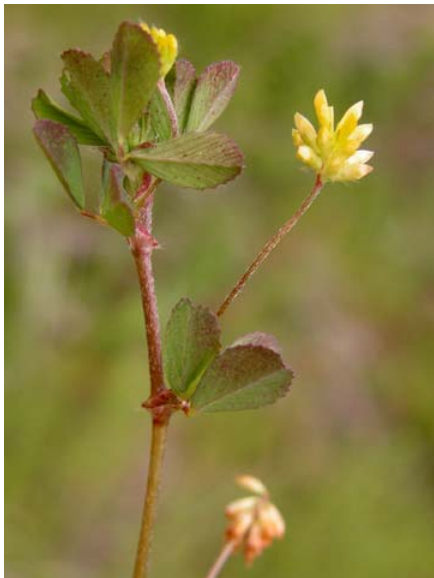
Shamrock Clover Trifolium dubium Introduced Annual Pea Family