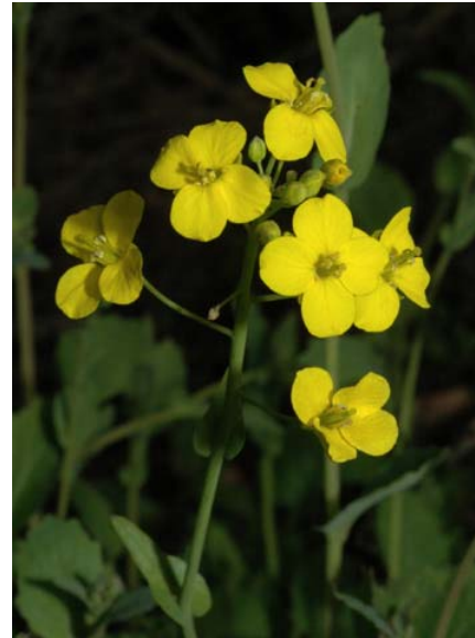
Yellow Field Mustard Brassica rapa Introduced Annual Mustard Family