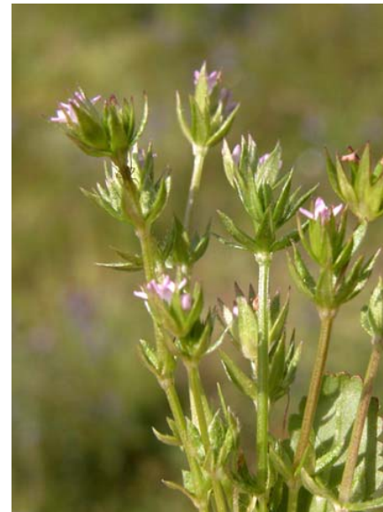
Blue Field Madder Sherardia arvensis Introduced Annual Madder Family