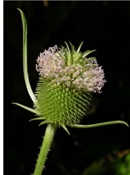
Wild Teasel Dipsacus sativus Introduced Biennial Teasel Family