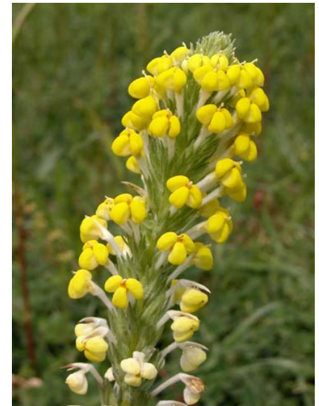
Yellow Johnny-tuck Triphysaria eriantha ssp. eriantha Native Annual Snapdragon Family