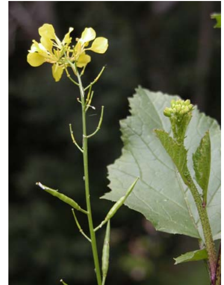
Yellow Charlock Sinapis arvensis Introduced Annual Mustard Family