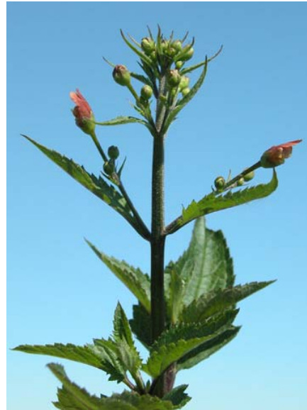
California Figwort Scrophularia californica ssp. californica Native Perennial Snapdragon Family