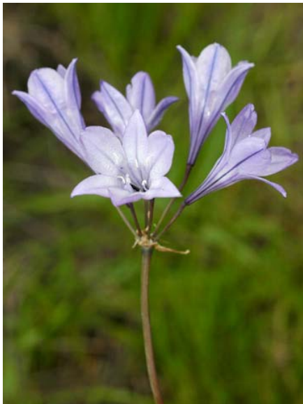
Ithuriel's Spear Triteleia laxa Native Perennial Lily Family