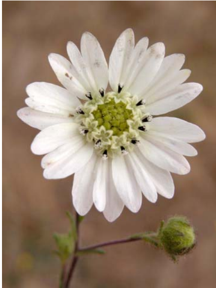
Hayfield Tarweed Hemizonia congesta ssp. luzulaefolia Native Perennial Sunflower Family