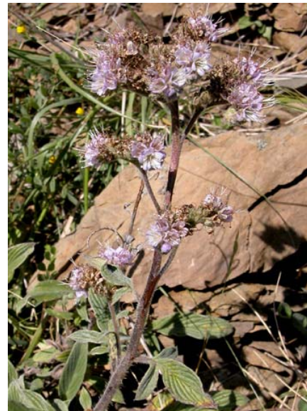
California / Rock Phacelia Phacelia californica Native Perennial Waterleaf Family