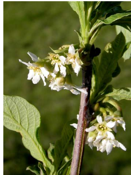
Oso Berry Oemleria cerasiformis Native Perennial Rose Family