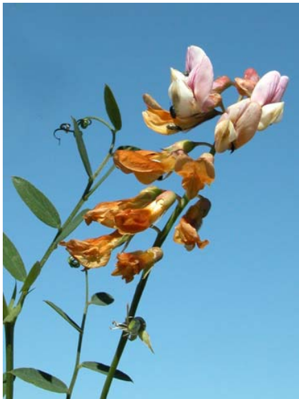
Pale Purple Pacific Pea Lathyrus vestitus var. vestitus Native Perennial Pea Family