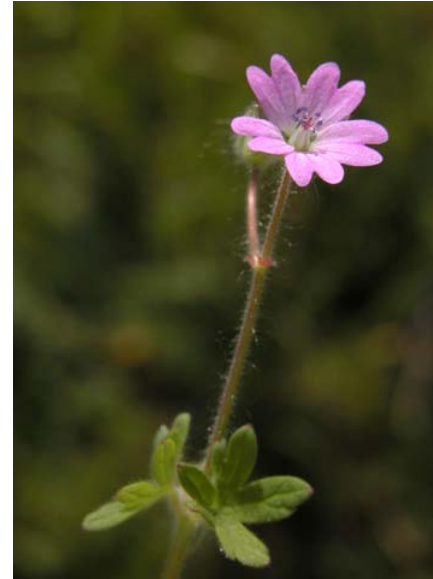
Hairy Dove's Foot Geranium Geranium molle Introduced Annual Geranium Family