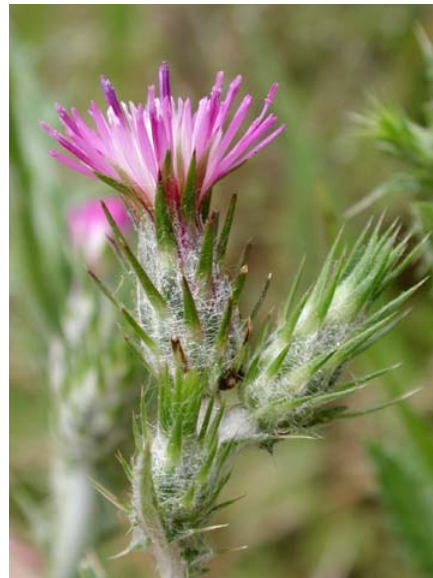
Italian Thistle Carduus pycnocephalus Introduced Annual Sunflower Family