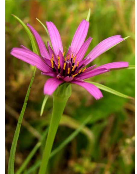
Purple Salsify Tragopogon porrifolius Introduced Biennial-Perennial Sunflower Family