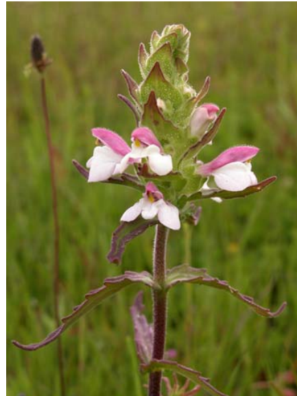
Bellardia Bellardia trixago Introduced Annual Snapdragon Family