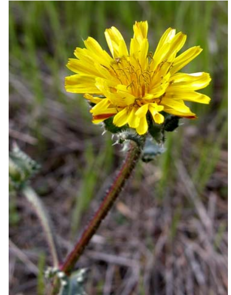
Bristly Ox-tongue Picris echioides Introduced Annual-Biennial Sunflower Family