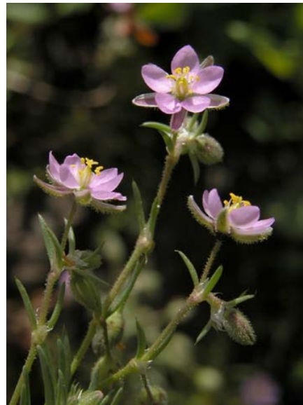
Ruby Sand Spurry Spergularia rubra Introduced Annual-Perennial Pink Family