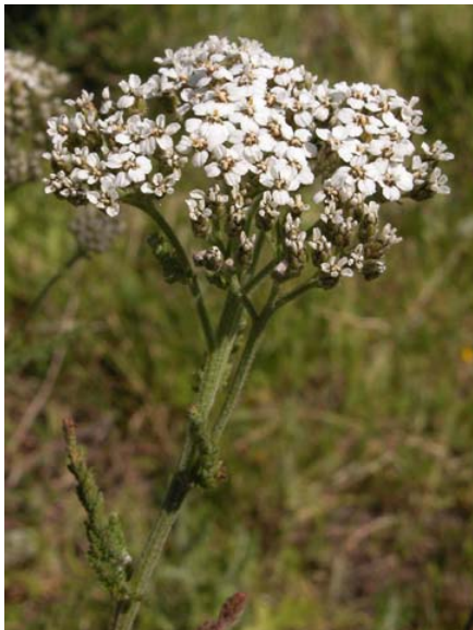
Yarrow Achillea millefolium Native Perennial Sunflower Family