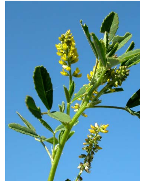
Sour Clover Melilotus indica Introduced Annual-Biennial Pea Family