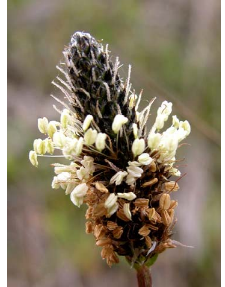
English Plantain Plantago lanceolata Introduced Annual Plantain Family