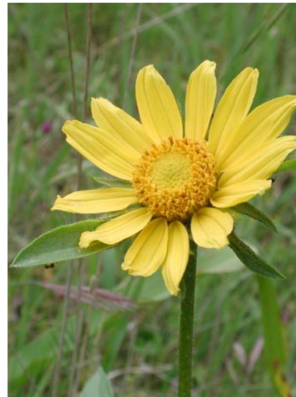
Mt. Diablo Helianthella Helianthella castanea Native Perennial Sunflower Family