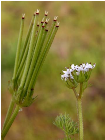
Shepherd's Needle Scandix pecten-veneris Introduced Annual Carrot Family