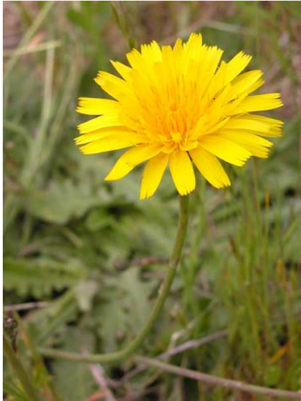
Rough Cat's-ear Hypochaeris radicata Introduced Perennial Sunflower Family