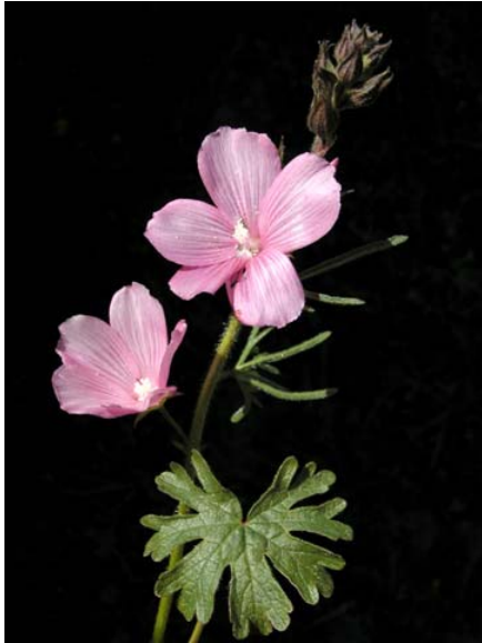
Common Checkerbloom Sidalcea malvaeflora ssp. malvaeflora Native Perennial Mallow Family