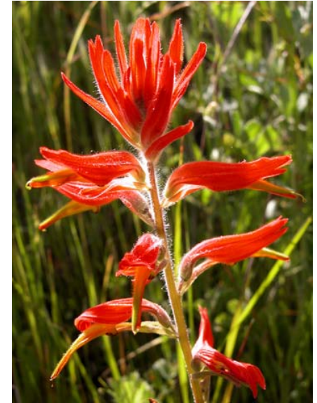
Common Indian Paintbrush Castilleja affinis ssp. affinis Native Perennial Snapdragon Family