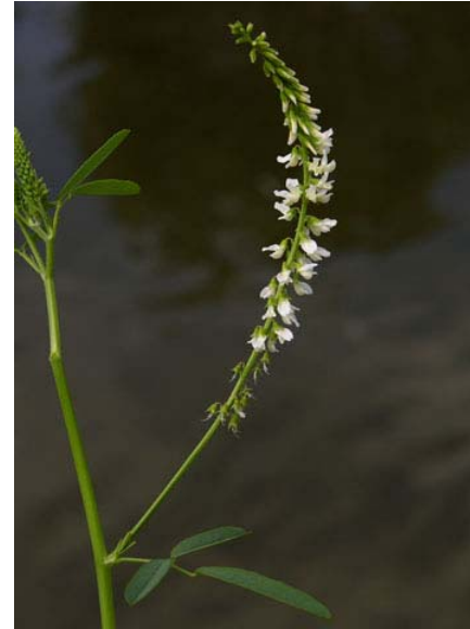
White Sweet Clover Melilotus alba Introduced Annual-Biennial Pea Family