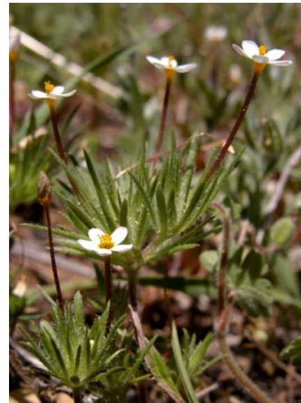
Bicolor Linanthus Linanthus bicolor Native Annual Phlox Family