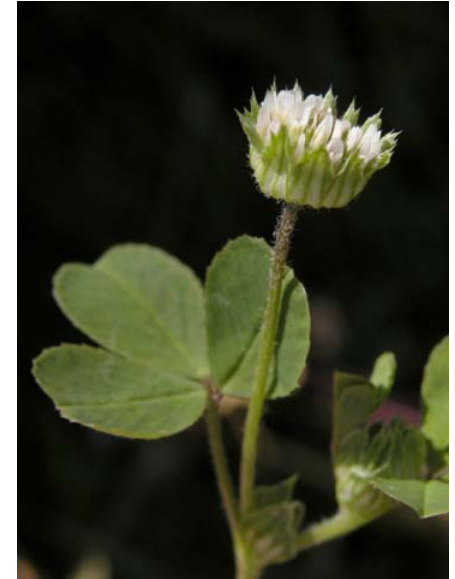
Thimble Clover Trifolium microdon Native Annual Pea Family