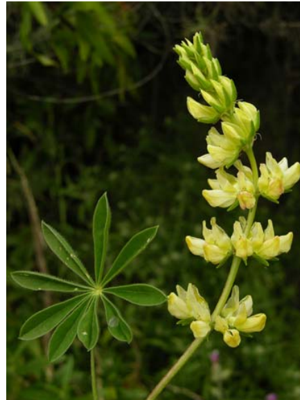
Gully Lupine Lupinus microcarpus var. densiflorus Native Annual Pea Family