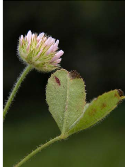
Small-head Clover Trifolium microcephalum Native Annual Pea Family