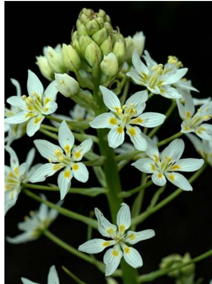
Common Star Lily Zigadenus fremontii Native Perennial Lily Family