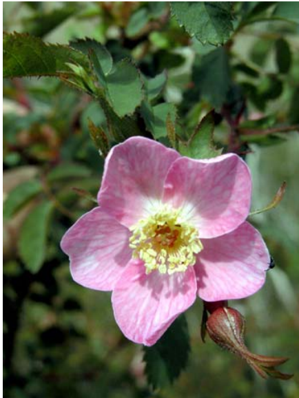
California Wild Rose Rosa californica Native Perennial Rose Family