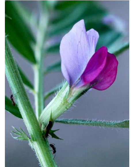
Spring Vetch Vicia sativa ssp. sativa Introduced Annual Pea Family