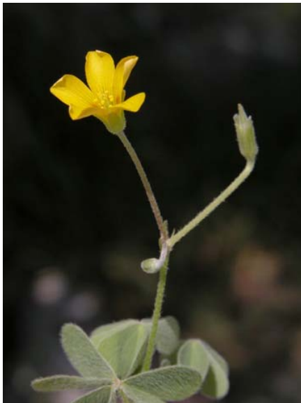
Creeping Wood Sorrel Oxalis corniculata Introduced Perennial Oxalis Family