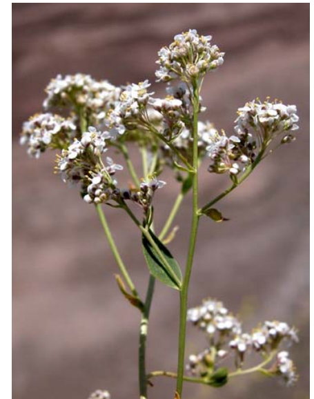
Slender Peren. Peppergrass Lepidium latifolium Introduced Perennial Mustard Family