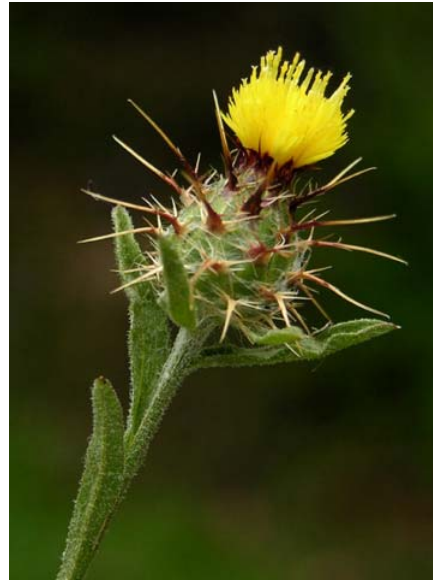
Tocalote Centaurea melitensis Introduced Annual Sunflower Family