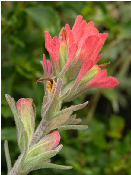
Woolly Paintbrush Castilleja foliolosa Native Perennial Snapdragon Family