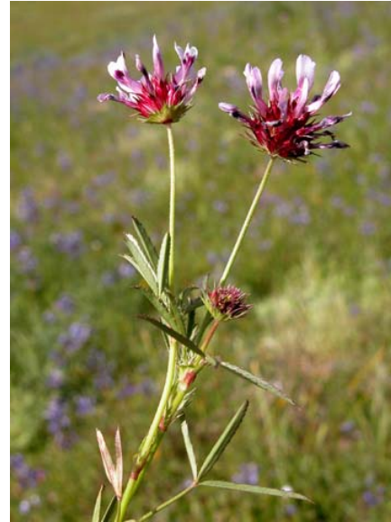
Tomcat Clover Trifolium willdenovii Native Annual Pea Family