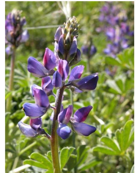
Arroyo Lupine Lupinus succulentus Native Annual Pea Family