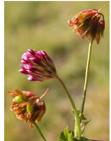
Pinpoint Clover Trifolium gracilentum var. gracilentum Native Annual Pea Family