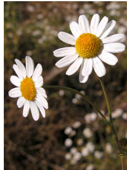
Mayweed Anthemis cotula Introduced Annual Sunflower Family