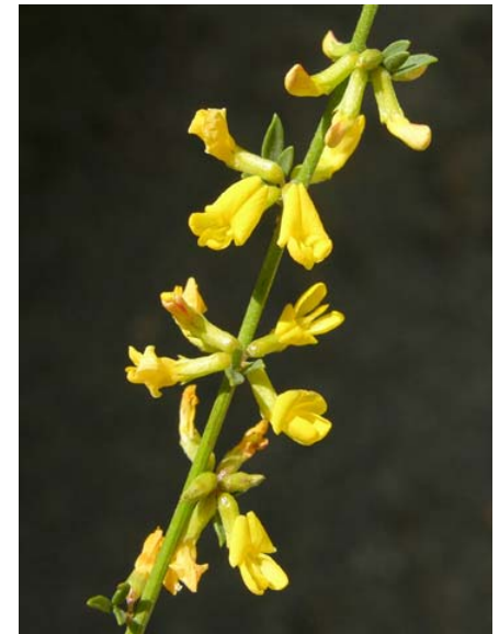
Deerweed Lotus scoparius var. scoparius Native Perennial Pea Family