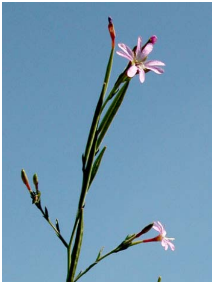
Panicked / Weedy Willowherb Epilobium brachycarpum Native Annual Evening Primrose Family