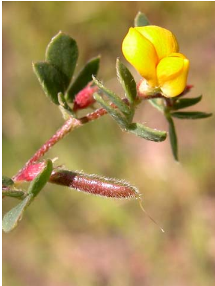
California Lotus Lotus wrangelianus Native Annual Pea Family