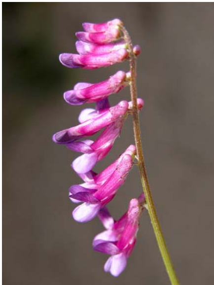
Winter Vetch Vicia villosa ssp. varia Introduced Annual-Biennial Pea Family