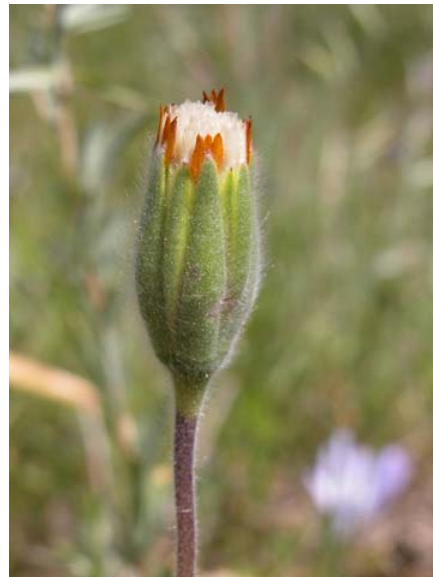
Blow Wives Achyrrachaena mollis Native Annual Sunflower Family