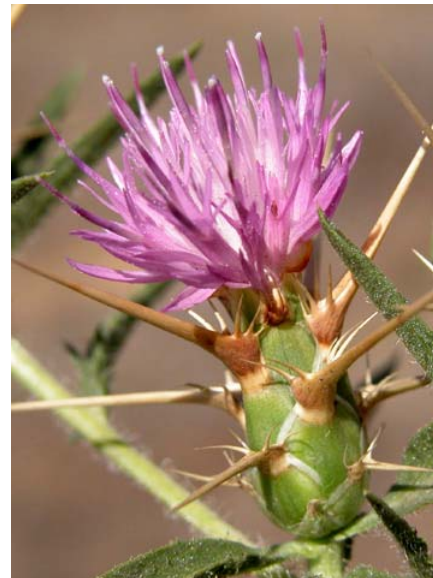
Purple Star Thistle Centaurea calcitrapa Introduced Annual-Biennial Sunflower Family