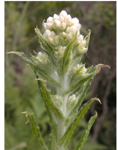
California Everlasting Gnaphalium californicum Native Biennial Sunflower Family