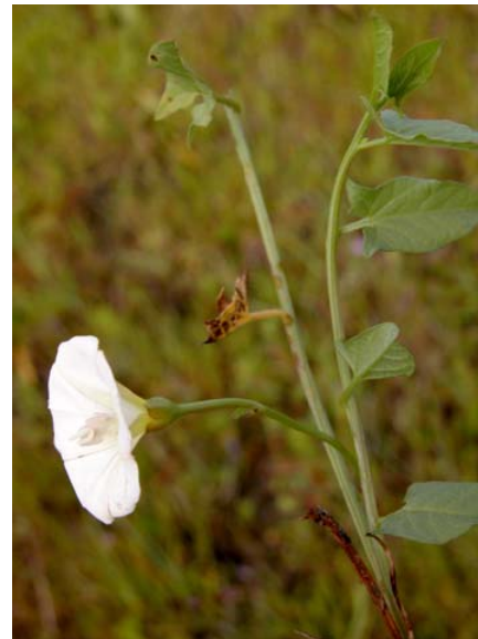
Field Bindweed Convolvulus arvensis Introduced Perennial Morning-Glory Family