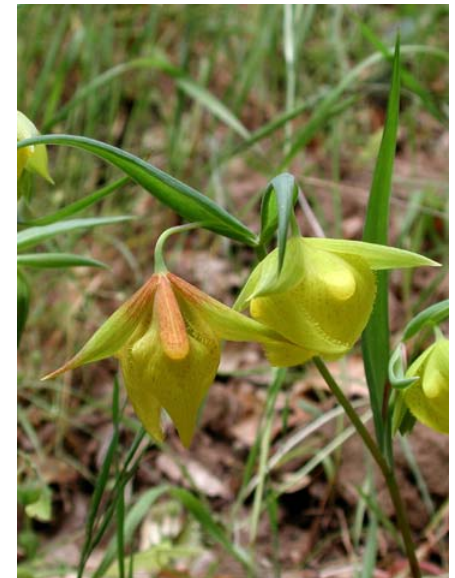
Mt. Diablo Fairy Lantern Calochortus pulchellus Native Perennial Lily Family