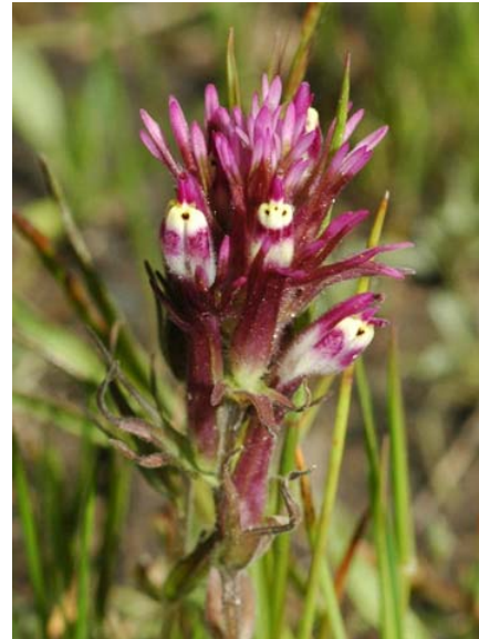
Common Owl's Clover Castilleja densiflora ssp. densiflora Native Annual Snapdragon Family