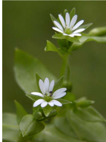
Common Chickweed Stellaria media Introduced Annual Pink Family