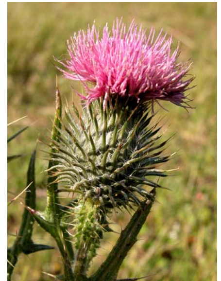
Bull Thistle Cirsium vulgare Introduced Biennial Sunflower Family