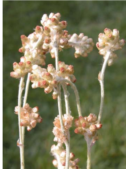
Weedy Cudweed Gnaphalium luteo-album Introduced Annual Sunflower Family