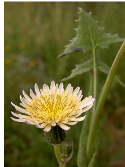
Common Sow Thistle Sonchus oleraceus Introduced Annual Sunflower Family