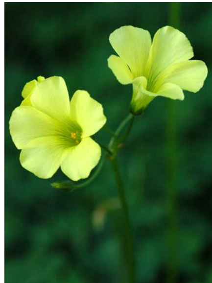
Bermuda Buttercup Oxalis pes-caprae Introduced Perennial Oxalis Family