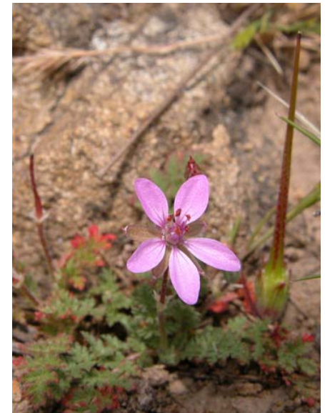
Red-stem Filaree Erodium cicutarium Introduced Annual Geranium Family