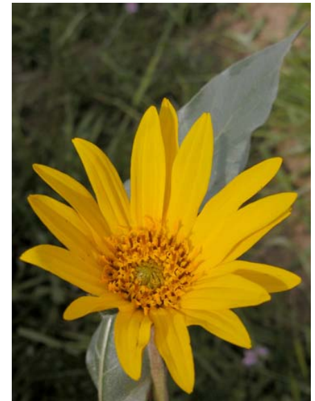
Narrow-leaf Mule's Ear Wyethia angustifolia Native Perennial Sunflower Family