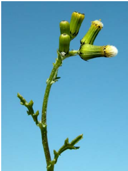
Common Groundsel Senecio vulgaris Introduced Annual Sunflower Family