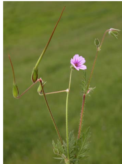
Long-beaked Filaree Erodium botrys Introduced Annual Geranium Family