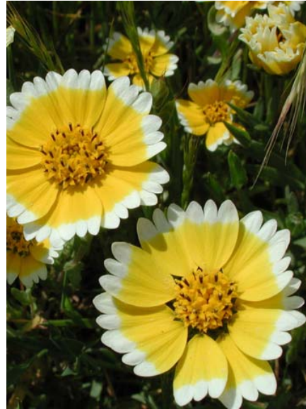
Common Tidytips Layia platyglossa Native Annual Sunflower Family