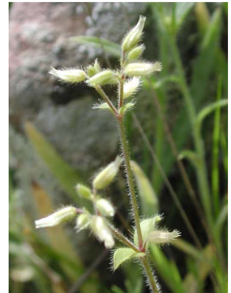
Mouse-ear Chickweed Cerastium glomeratum Introduced Annual Pink Family