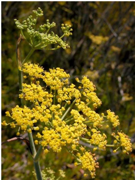
Sweet Fennel Foeniculum vulgare Introduced Perennial Carrot Family