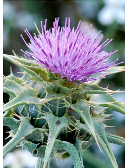
Milk Thistle Silybum marianum Introduced Annual-Biennial Sunflower Family