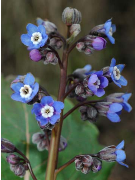
Large Hound's Tongue Cynoglossum grande Native Perennial Borage Family