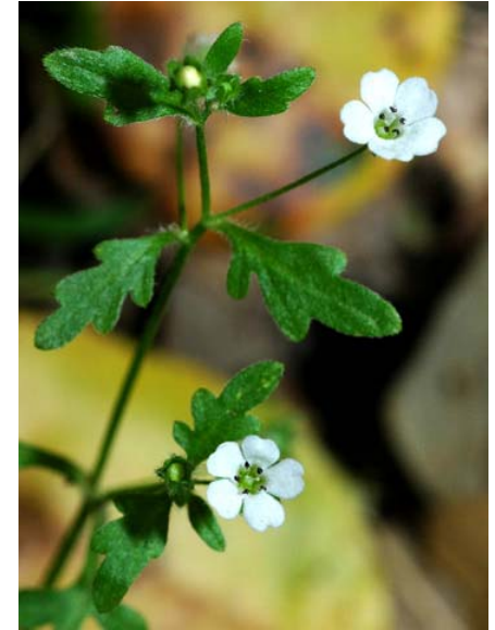
Variable-leaf Nemophila Nemophila heterophylla Native Annual Waterleaf Family