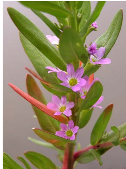
Grass Poly Loosestrife Lythrum hyssopifolium Introduced Annual-Perennial Loosestrife Family