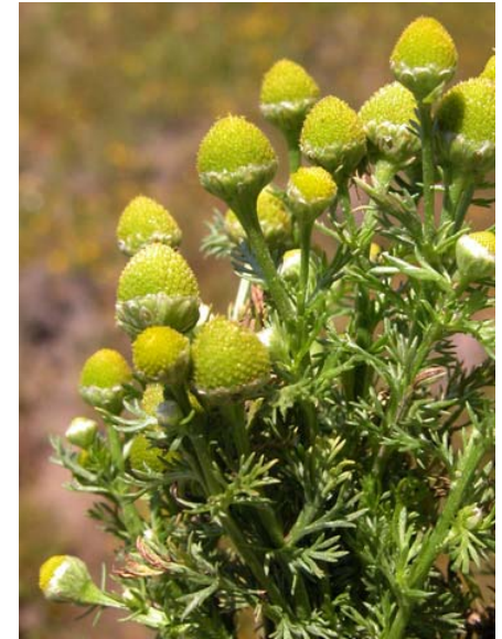
Pineapple Weed Chamomilla suaveolens Introduced Annual Sunflower Family