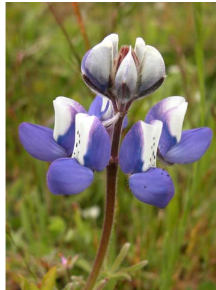
Douglas Sky Lupine Lupinus nanus Native Annual Pea Family