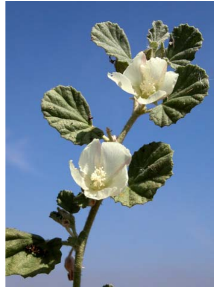
Alkali Mallow Malvella leprosa Native Perennial Mallow Family