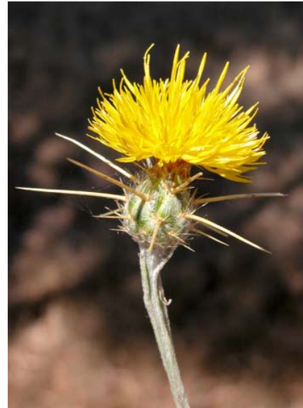
Yellow Star Thistle Centaurea solstitialis Introduced Annual Sunflower Family