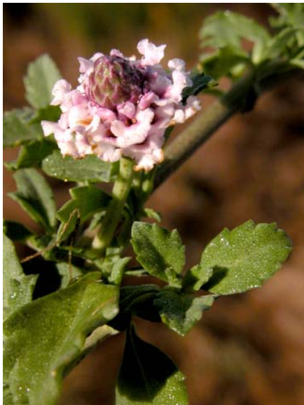
Lemon Verbena Phyla nodiflora var. nodiflora Native Perennial Vervain Family