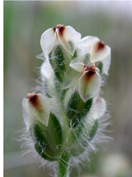
California Dwarf Plantain Plantago erecta Native Annual Plantain Family