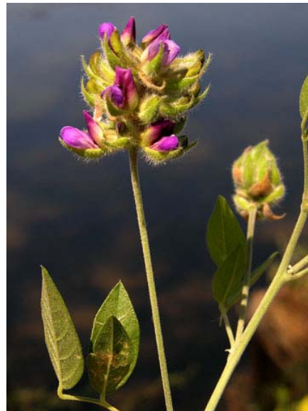
California Tea Rupertia physodes Native Perennial Pea Family