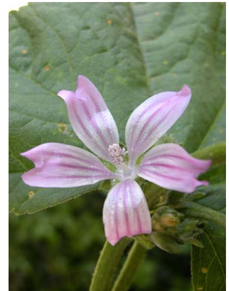
Bull Mallow Malva nicaeensis Introduced Annual Mallow Family