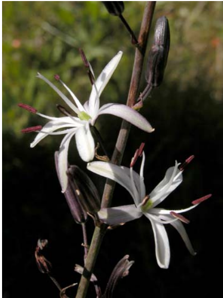
Common Soap Plant Chlorogalum pomeridianum var. pomeridianum Native Perennial Lily Family