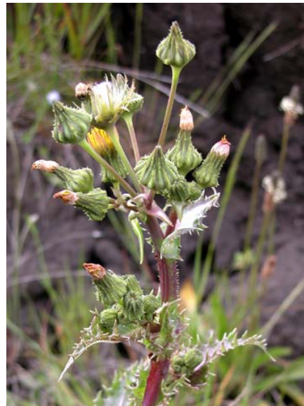
Prickly Sow Thistle Sonchus asper ssp. asper Introduced Annual Sunflower Family