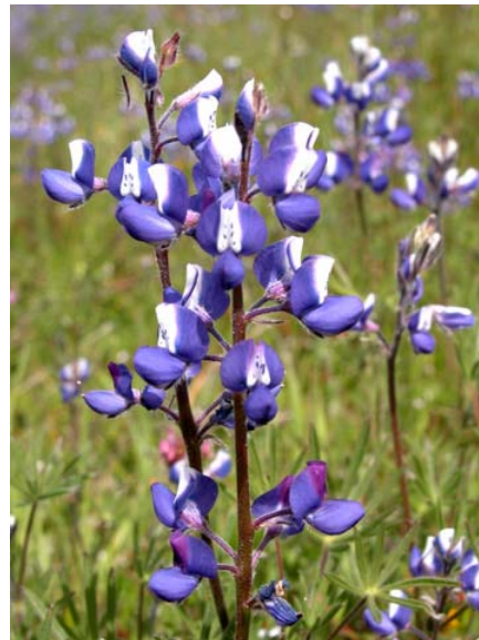
Miniature Dove Lupine Lupinus bicolor Native Annual Pea Family