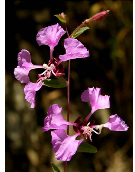
Elegant Clarkia Clarkia unguiculata Native Annual Evening Primrose Family