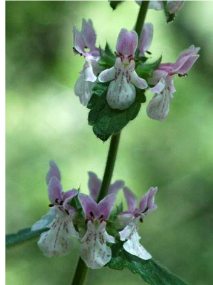
Common Rigid Hedge Nettle Stachys ajugoides var. rigida Native Perennial Mint Family