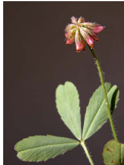
Tree Clover Trifolium ciliolatum Native Annual Pea Family