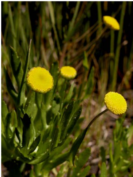
Brass Buttons Cotula coronopifolia Introduced Perennial Sunflower Family