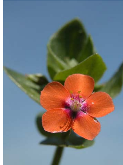
Scarlet Pimpernel Anagallis arvensis Introduced Annual Primrose Family