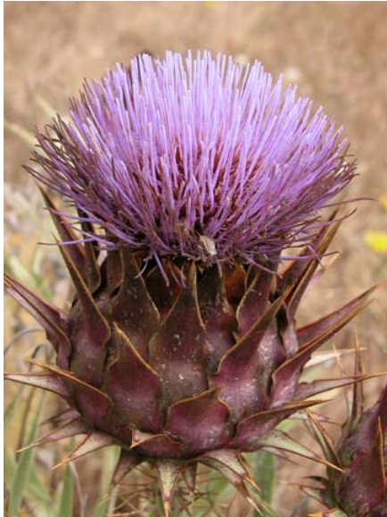
Cardoon / Artichoke Thistle Cynara cardunculus Introduced Perennial Sunflower Family