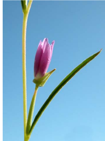
Small Clarkia Clarkia affinis Native Annual Evening Primrose Family