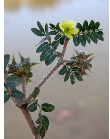
Puncture Vine Tribulus terrestris Introduced Annual Caltrop Family