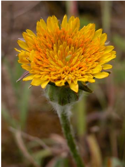
Large-flower Native Dandelion Agoseris grandiflora Native Perennial Sunflower Family