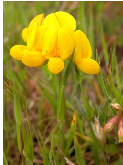
Bird's-foot Deerweed Lotus corniculatus Introduced Perennial Pea Family