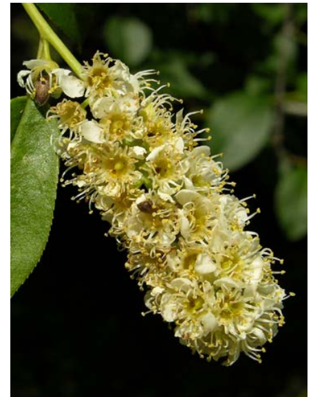
Western Chokecherry Prunus virginiana var. demissa Native Perennial Rose Family