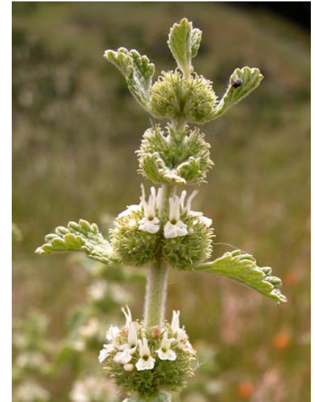
Common Horehound Marrubium vulgare Introduced Perennial Mint Family