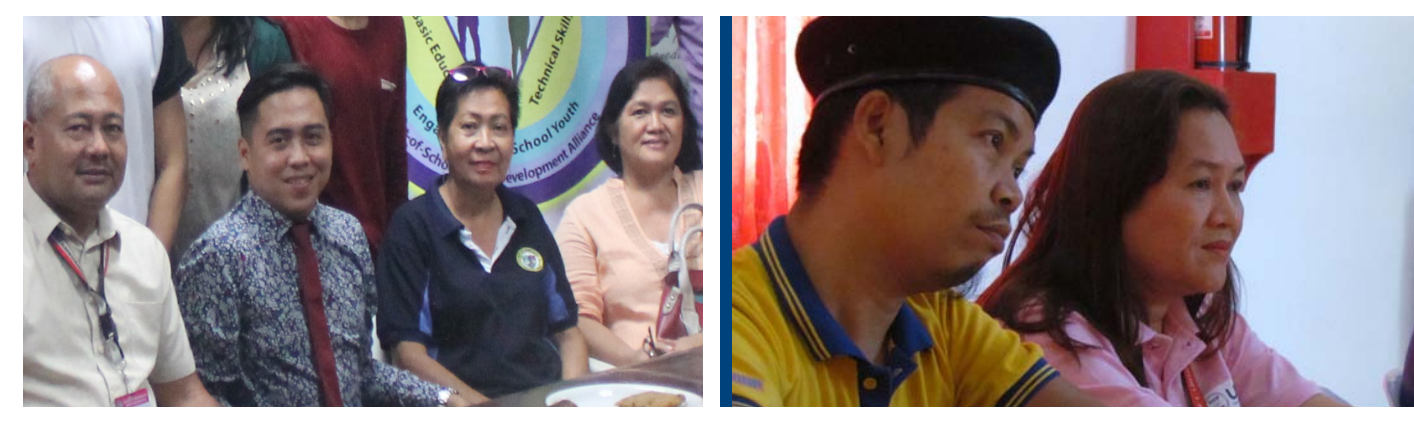
Some members of Out-of-School Development Alliances of Zamboanga City (left) and Cotabato City (right).