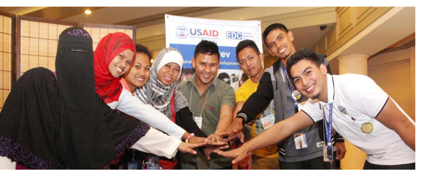
Out-of-school youth in a development agenda workshop for MYDev on October 2014.