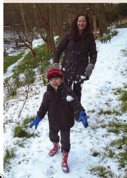
A lovely walk even on a cold day

pass the back entrance to Smeaton Nurseries before eventually coming to a T junction. Turn right and follow the road past Preston Mains farm on your right and Preston Mill on your left. At the next T junction you will find yourself in East Linton.