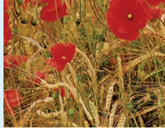
Poppies in a local wheat field

In the surrounding farmland brown hares make their home, while buzzards are regularly seen flying overhead. You may catch sight of roe deer from the paths or along the edge of woodland – look out for their tracks in softer ground.