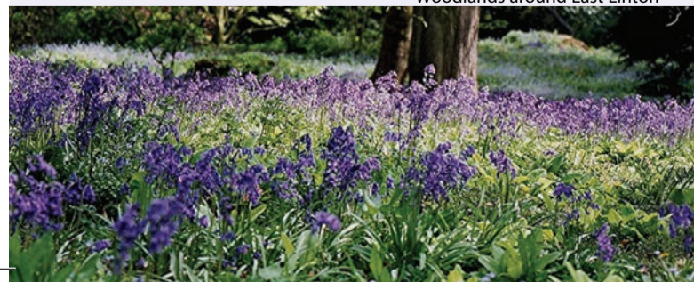
Woodlands around East Linton

This walk follows the River Tyne, passing many sites of local and historical interest. Walk north along the High Street and turn right into Preston Road. Pass Preston Kirk on your left and continue until you reach Preston Mill on your right. Go through the Mill grounds and cross the small bridge by the mill wheel. Walk through the field and cross the River Tyne by the white bridge, taking a sharp left following the signs for 'John Muir Way'. Continue along the riverbank. Cross the large metal bridge, turn right and walk along the edge of a field with the River Tyne on your right until you reach a tarmac road. Turn right and you will shortly cross the ford at Knowes Mill by the wooden bridge. Take a sharp left, and take the red whin dust path along the banks of the Tyne until you reach the A198 North Berwick Road. Either carry on under the tunnel, turn right and follow the John Muir Way to Dunbar or climb the steps, taking great care when emerging onto the road as it is busy and fast with blind summits. Turn left and walk down into Tynninghame Village. Here you will find Tynninghame Country Store serving lunches, teas, coffees and cakes. Return to East Linton along the side of the road. There is no path but this road is generally not too busy.