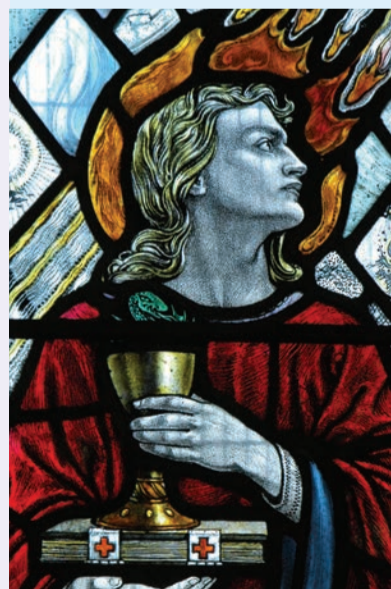
A window from Whitekirk Kirk

Start the walk by taking the steep lane on the right just beyond the lay-by. This turns into a grass path to the left hand side of the garage. The path follows the edge of Whitekirk Golf Course and passes a small deep pond on the right. The path crosses the farmland and is easy to follow. There are great views of North Berwick Law to the north and Bass Rock towards the East.