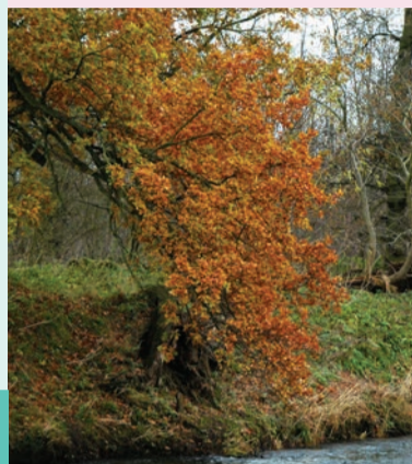
Autumn colour around Newbyth

For your guidance and safety the routes are waymarked. Even on short walks conditions can vary considerably so be prepared for muddy paths and wear stout shoes. A round trip from the car park to the pond is 1 km and will take about 20 minutes.