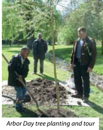
Arbor Day tree planting and tour