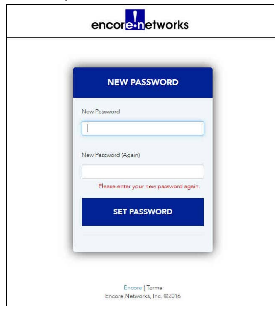
Figure 1-2. enCloud Account Activation Screen