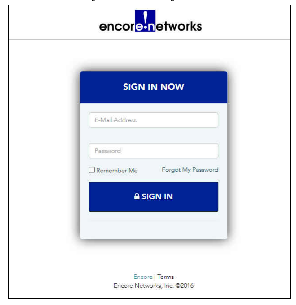
Figure 1-3. enCloud Log-In Screen

» The enCloud Log-In Screen is displayed, requesting your log-in credentials (Figure 1-3).