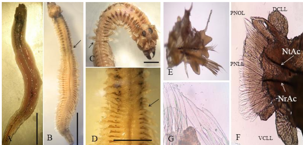
Fig 6: (A) Heteronereis specimen showing modification of the body color; (B) Another one showing morphological modifications of epitoky; Enlarged eyes, and the beginning of a modified region; (D) Close up of flattened parapodia, arrows indicate start of the first modified parapodium; (E) Parapodium from anterior region; (F) Parapodium from posterior region; (G) Natatory chaeta, (DCLL) Dorsal cirrus lamella, (PNOL) Post-chaetal neuropodial lamella, (NtAc) Notoaciculum, (PNLL) Post-chaetal neuropodial lamella, (NrAc) Neuroaciculum, (VCLL) Ventral cirrus lamella, (bar scale: 5 mm); (E, F: x 10), (G: x 40).

transdifferentiate [37], These observations agree with literature on other closer nereids species, where morphological, behavioral and physiological changes correlate with metabolic and biochemical ones [38], epitokous worms are prepared for a short pelagic existence during swarming, where they swim and release gametes on the water surface, days after spawning individual of the two sexes die, this agrees with our observations, the two species are known to be strictly semelparous, they breed once in their life cycle; literature on P. cultrifera along the Algerian coast, reported two reproductive patterns, with atokous or epitokous type, according to geographic location [39].