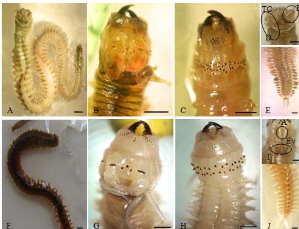
Fig 2: P. macropus (A) Dorsal view of whole animal; (B) Dorsal view of anterior region; (C) Ventral view of anterior region; (D) Dorsal view of details of the head; (E) Ventral view of pygidium; P. cultrifera (F) Dorsal view of anterior and middle region; (G) Dorsal view of anterior region; (H) Ventral view of anterior region; (I) Dorsal view of details of the head; (J) Ventral view of pygidium, (TC) Tentacular cirri, (P) Biarticulated palp, (Ey) Four eyes, (bar scale: 1mm).

The two species are recognized by their elongated and multi segmented form, and by the presence simultaneously of two antennae, two biarticulated palps, four pairs of tentacular cirri, four eyes, and a pair of dark or light brown of serrated jaws, with 4-6 teeth on an eversible pharynx, these characters agree with the description of Nereididae by [24], thus the general form is the same with segments along the body all alike, except at the anterior end where there is the head formed by prostomium and peristomium, and at the posterior extremity the pygidium, with two anal cirri that vary in length (Figure 2).