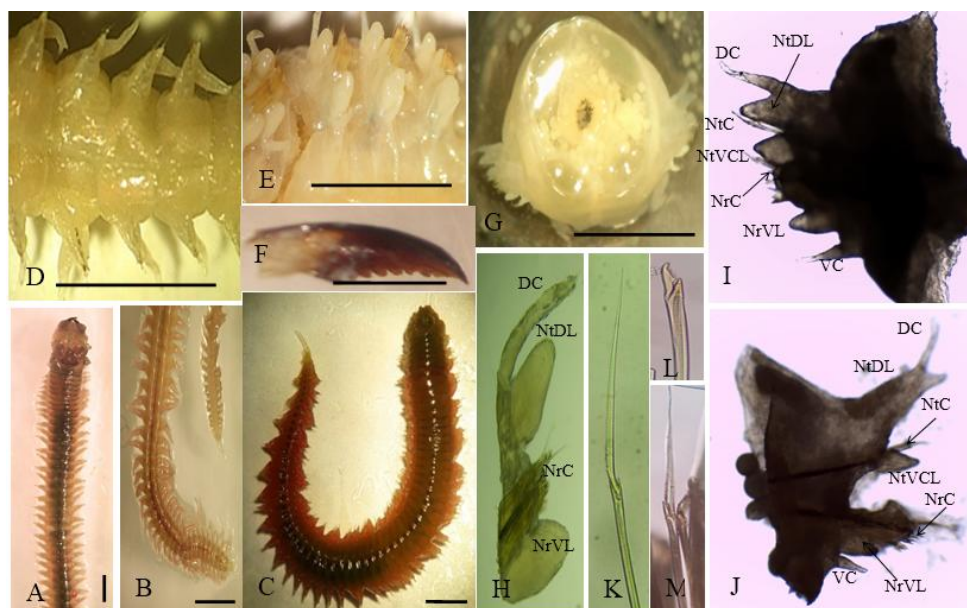
Fig 5: (A, B) P. macropus showing a modified form of parapodia of the posterior part; P. cultrifera with unmodified form along the whole body (C); Close up of parapodia from posterior region (D) P. macropus , (E) P. cultrifera ; (F) Jaw; (G) Cross section of an anterior segment; (H) Uniramous parapodium; (I) Biramous parapodium from anterior region; (J) Biramous parapodium from posterior region; (K) Homogomph spiniger chaeta; (L) Heterogomph falciger chaeta; (M) Heterogomph spiniger chaeta; (DC) Dorsal cirrus, (NtDL) Notopodial dorsal ligulle, (NtC) Notochaeta, (NtVL) Notopodial ventral ligulle, (NrC) Neurochaeta, (NrVL) Neropodial ventral ligulle, (VC), (ventral cirrus), (bar scale: 3 mm, bar scale F: 0.5mm), (G, H, I: x 10), (J, K, L: x 40).

synchronous; for P. macropus mature oocytes can reach a maximum diameter of 268.76 \pm 11.68 \mu\text{m} in July; for P. cultrifera maximum oocyte diameter showed a similar value 334.69 \pm 19.55 \mu\text{m} and 345.33 \pm 13.82 \mu\text{m} in May at both stations Collo and Skikda respectively, these values are similar of those mentioned in [29, 31, 32-35] suggested that oocyte growth follows an initial phase of very slow growth, a phase of rapid growth, and a final phase of egg differentiation with little growth, likewise [30]. Reported that oocytes proliferation and growth occur over an extended period of time, where smaller oocytes catch up the larger ones, to reach a uniform size, when spawning is imminent [36]. (Figure 4: J).