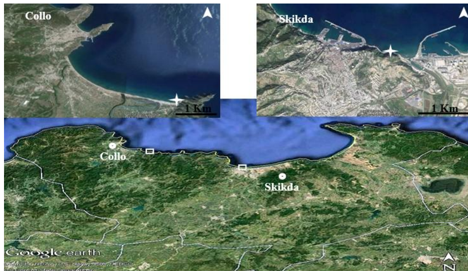
Fig 1: Location of the sampling sites.

Examined individuals were sampled at three occasions July 2013, May and June 2014, at low tide in the intertidal zone of a rocky shore from two stations north east Algeria, the first is located on the eastern part of Collo coast, whereas the second on the western part of Skikda coast (Figure 1). Worms were forced out from hard substrates by using bleaching liquid (10% in sea water) and collected gently by a pincer to avoid damaging them.