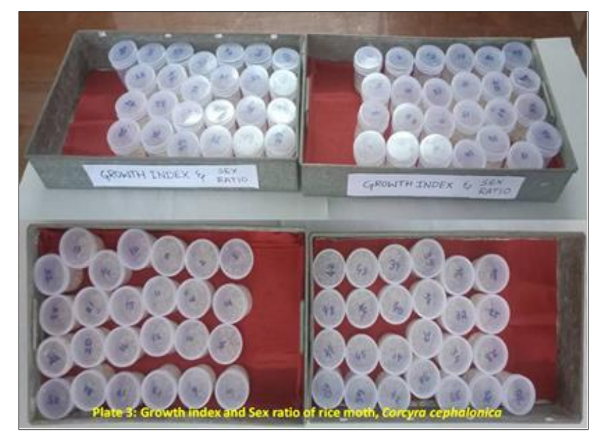
Plate 3: Growth index and Sex ratio of rice moth, Corcyra cepholonica a