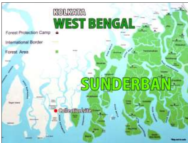
Fig 1: Map of the Sunderban Biosphere Reserve and the collection site

The specimens were collected from the northern part of Lothian Island Wildlife Sanctuary (88°18.696'E, 21°42.340'N), situated at the confluence of river Saptamukhi and the Bay of Bengal on 12.10.2019 (Figure 1). The specimens were obtained from the vacant shells of Telescopium Montfort, 1810. Specimens and the molluscan shells were collected by handpicking and the hermit crab samples were separated, photographed and preserved in 10% Formalin –freshwater solution. The specimens were measured using a slide calliper with a minimum measurement capacity of 0.1mm in the laboratory. Specimens and the host molluscan shells were identified in the lab. Identification keys used for identification of the hermit crabs were as per Thomas, 1989 [3]. Voucher specimens are deposited in the National Zoological Collections of ZSI-Sunderban Regional Centre.