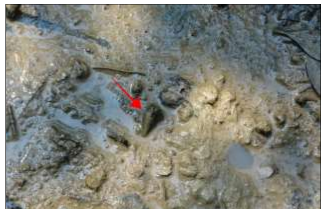
Fig 3: Natural habitat of Clibanarius longitarsus De Haan, 1849 in Sunderban Biosphere Reserve

Diagnostic characters: Well developed carapace with spines projecting outwards and the carapace is broader at the proximal end of the body. Eye stalk is as long as the antennular peduncle. Chelipeds are equal in length; left cheliped is slightly larger than the left. Both chelipeds are with dark corneous tips. One or two rows of spines are present on chelipeds and irregularly placed spines are present on palm. Dactylus of the third walking leg is longer than the