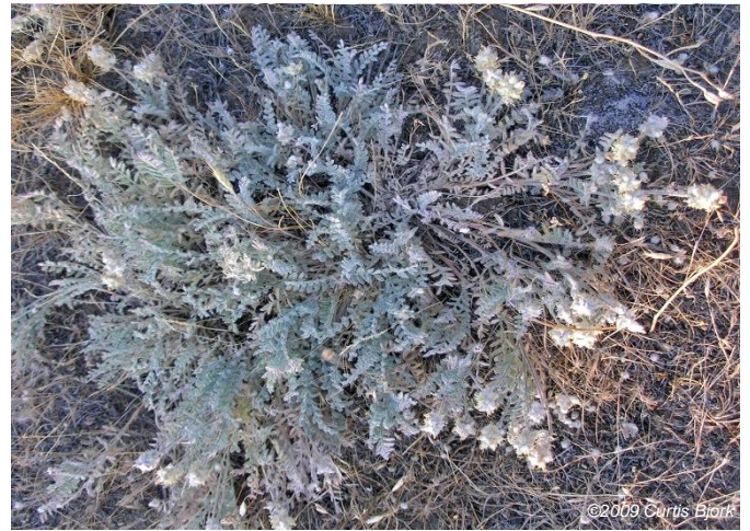
Figure 3 Typical individual in flower