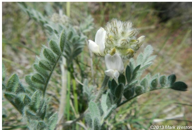
Figure 6 Close-up of inflorescence at initial stage of flowering