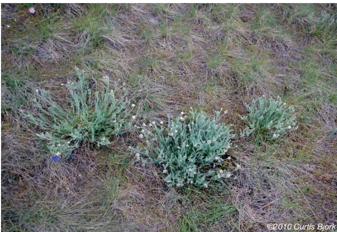
Figure 2 Robust plants in healthy grassland setting