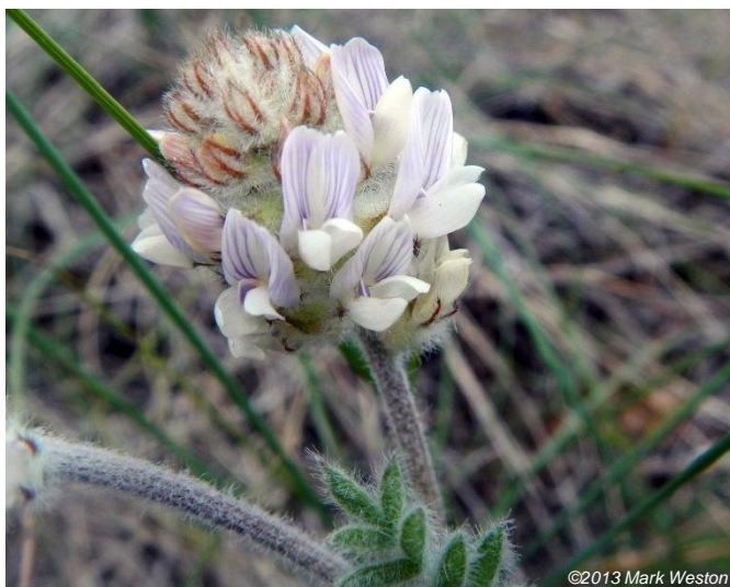
Figure 5 A more mature inflorescence with purple marked flowers