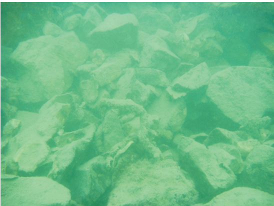
Patch of smaller rocks atypical of the main large rock composition of the artificial seawall