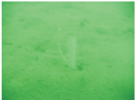
Muddy bottom in the deep water of natural shoreline of T1.