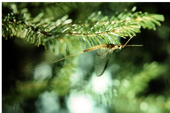
Hexagenia limbata from Southern Indian Lake, northern Manitoba, Canada.

So - my question to you - Do you have some spectacular mayfly photos that you'd like to share with your colleagues? Is there a special collecting site or new collecting method whose details would be of interest to other mayfly workers? Have you ever had an adventure in collecting mayflies? We publish our data in our research papers, but sometimes the story behind the story is equally interesting!