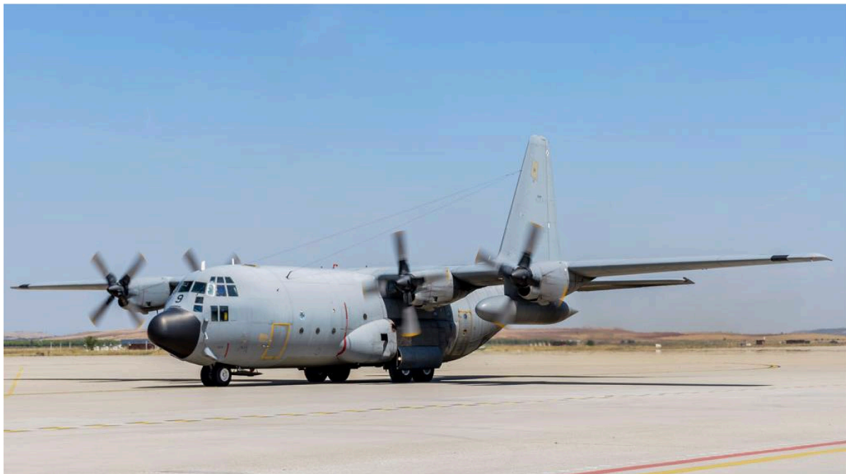
The Spanish Army's Hercules flight arriving in Baghdad