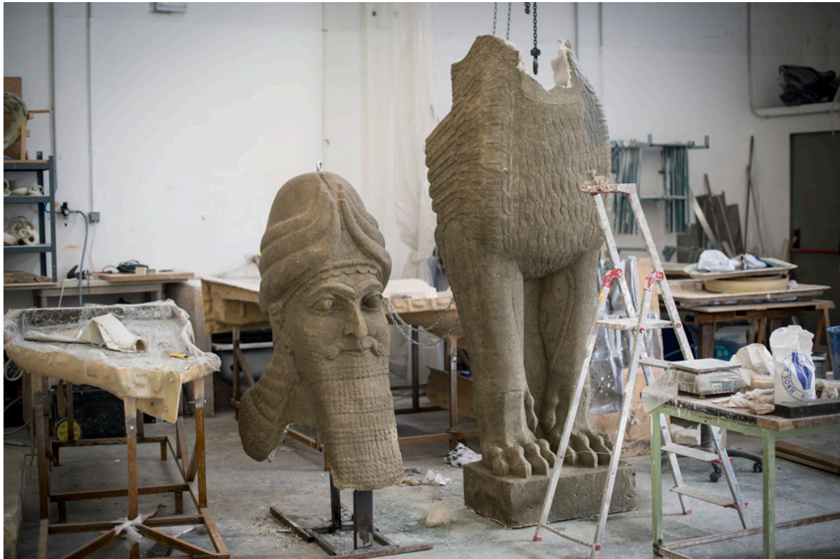
Re-materialising the Lamassu at Factum's workshops in Madrid