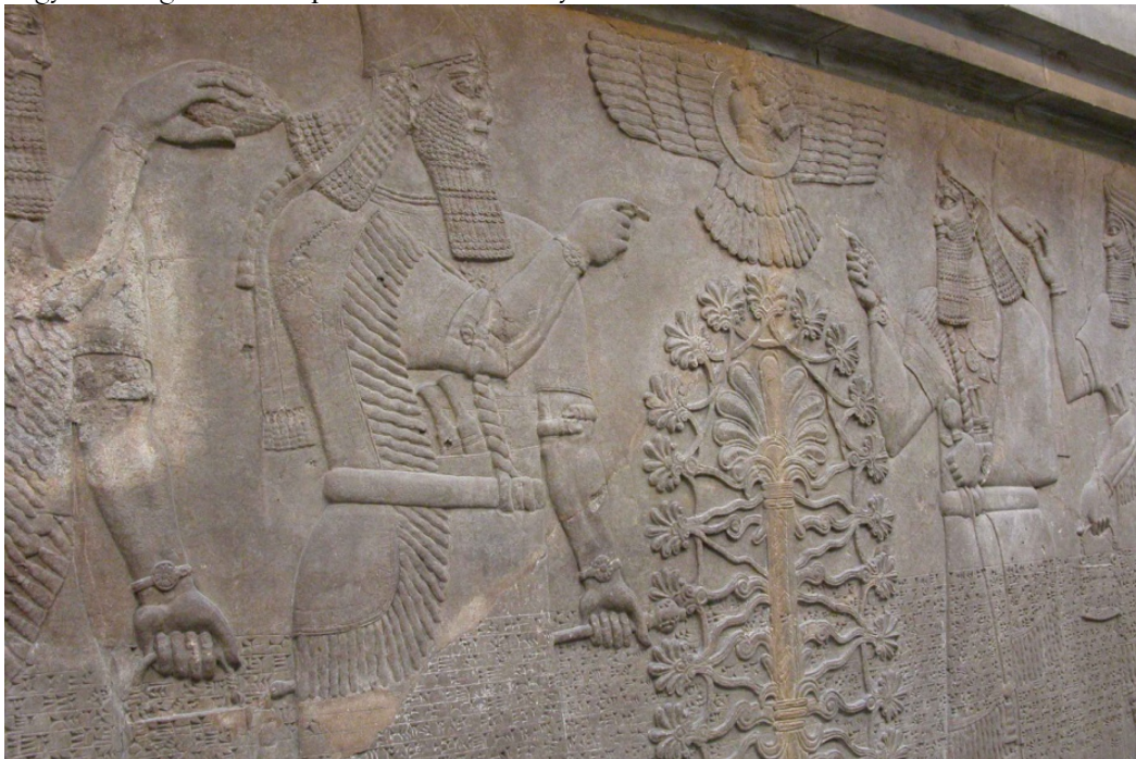
Detail of Throne-back that was fixed to the Eastern end of the throne room behind the throne. It was recorded by Factum Arte in the British Museum in 2004

In early 2014, plaster casts of the relief panels from the British Museum were donated to the Ashurbanipal Library Project at the University of Mosul by Factum Foundation and the British Museum. The Ashurbanipal Library Project aimed to build a large campus consisting of a museum and a research centre, besides several rooms for national and international symposium. Next to it is the College of Archeology building at the campus of the University of Mosul.