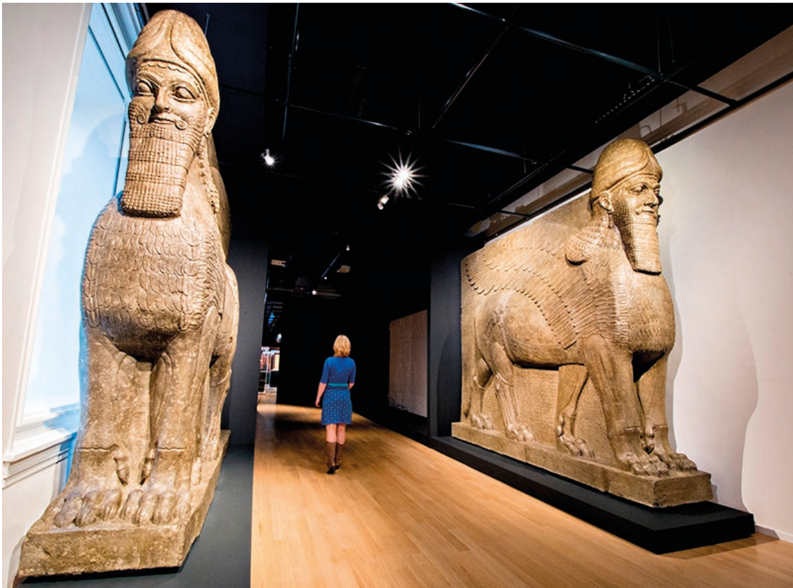
The Lamassu facsimiles created for the exhibition Nineveh at the Rijksmuseum van Oudheden. Part of the agreement to loan them was dependent on the sculptures being donated to the University of Mosul