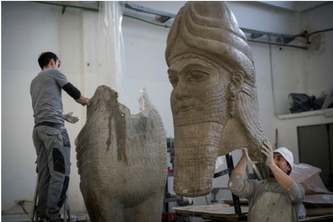
The facsimile being assembled at Factum Arte's workshops