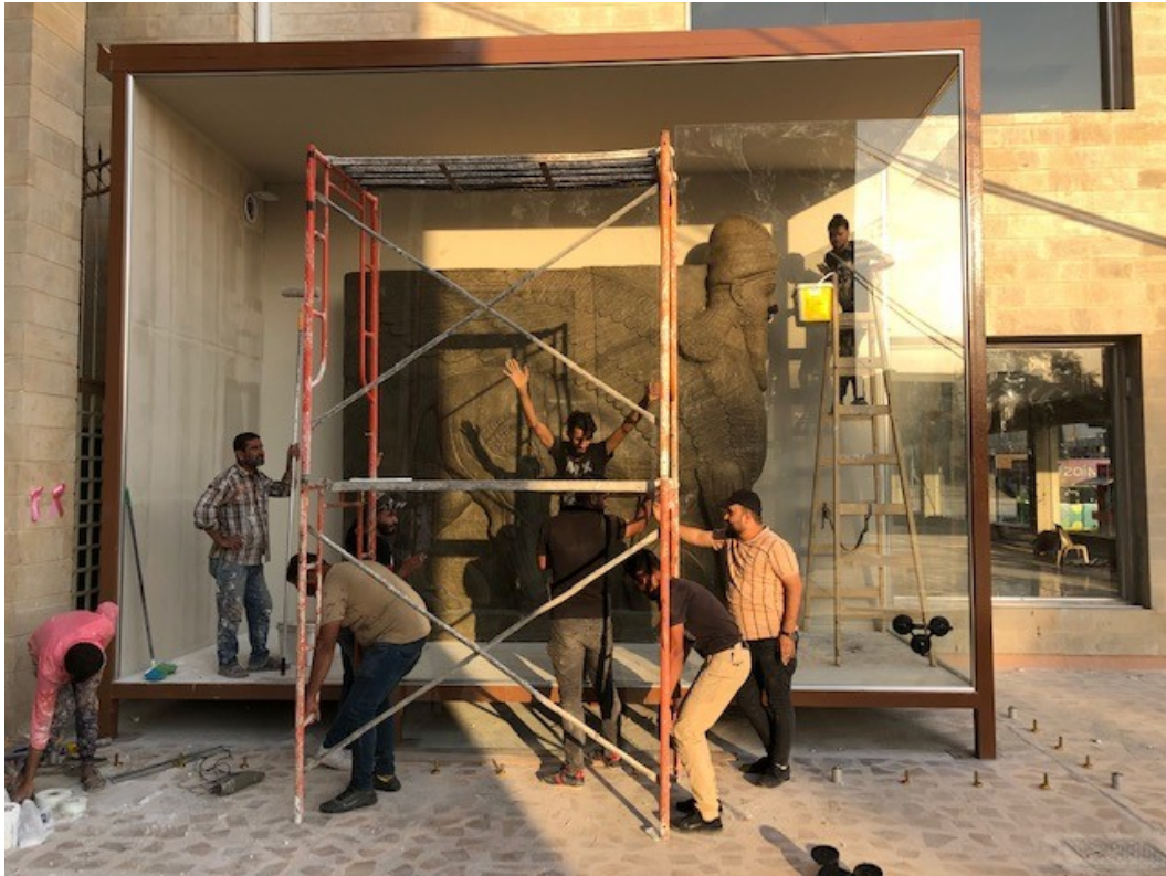
The installation of the lamassu at the entrance to the student centre