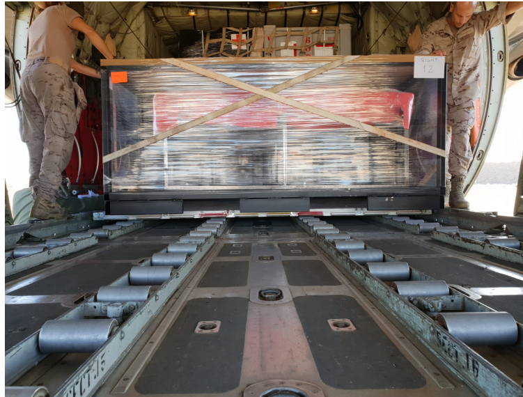
The Spanish Army loading the crates in the Lockheed C-130 Hercules aircraft