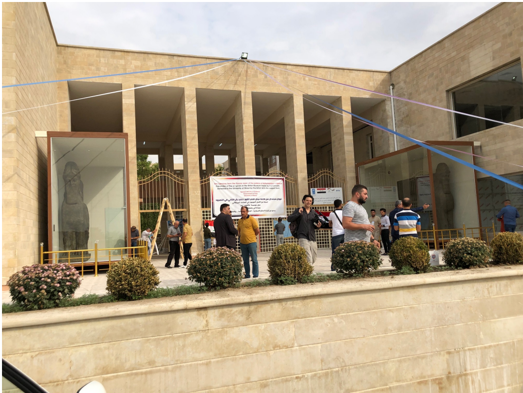
The lamassu standing either side of the entrance to the main student building in the University of Mosul, recently restored after it was intentionally set on fire by Islamic State