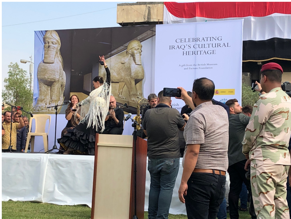
Flamenco concert taking place in front of the burnt Central Library on 24 th October