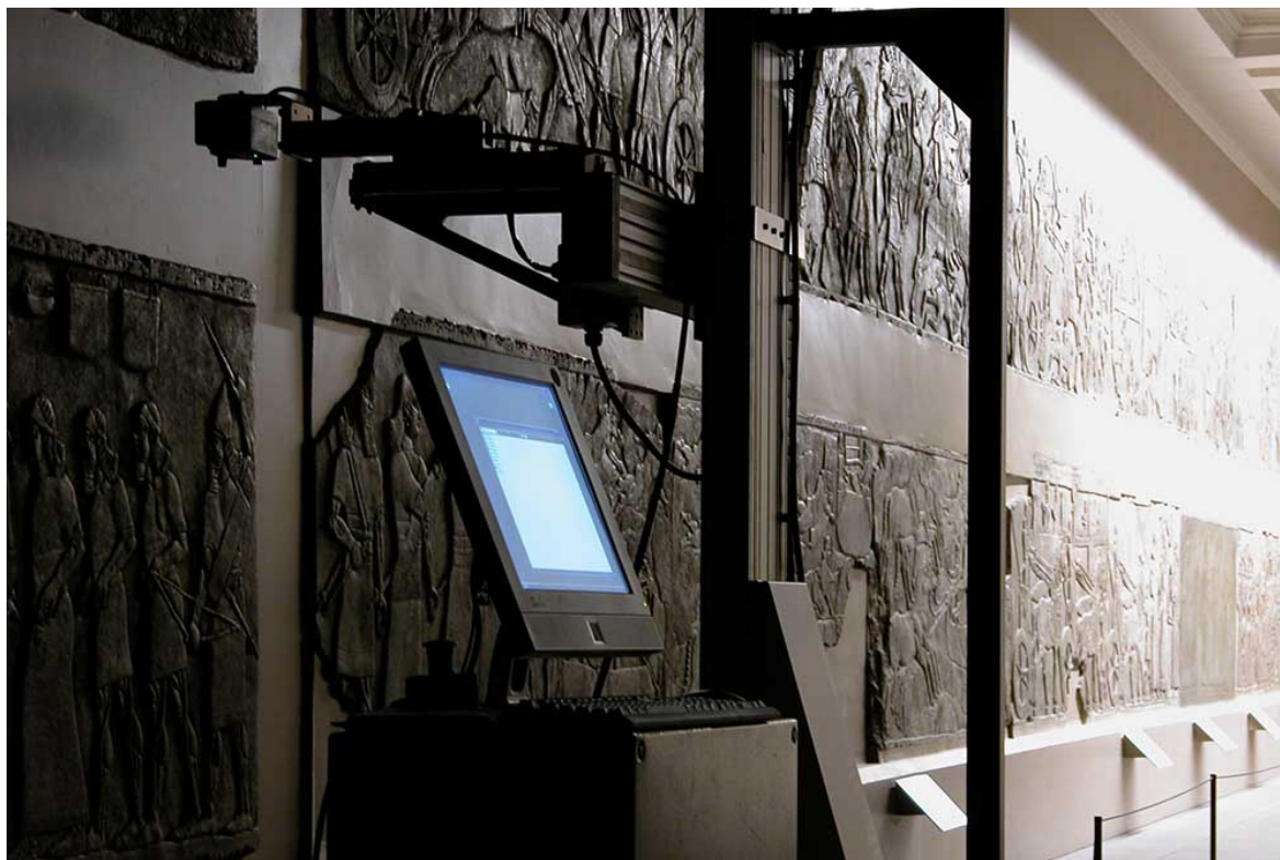
Recording of the panels from the throne room of Ashurnasirpal II at the British Museum in 2004 using a purpose built scanning system.