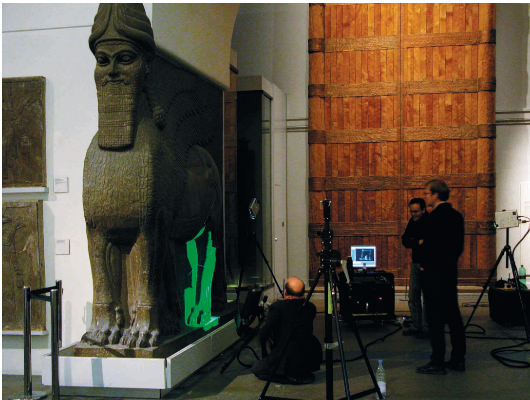
Factum Arte's recording specialists digitising the Lamassu at the British Museum in 2004

These silicone moulds were used to create the facsimiles, made in stucco marble and coated with wax to obtain its distinctive colour. The facsimiles were first produced in 2016 for the exhibition Nineveh at the National Museum of Antiquities in Leiden, Netherlands, organised by the Rijksmuseum Van Oudheden, and in 2017, in anticipation of their donation to the University of Mosul.