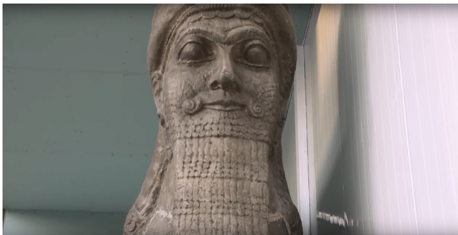
The head of the lamassu recently installed