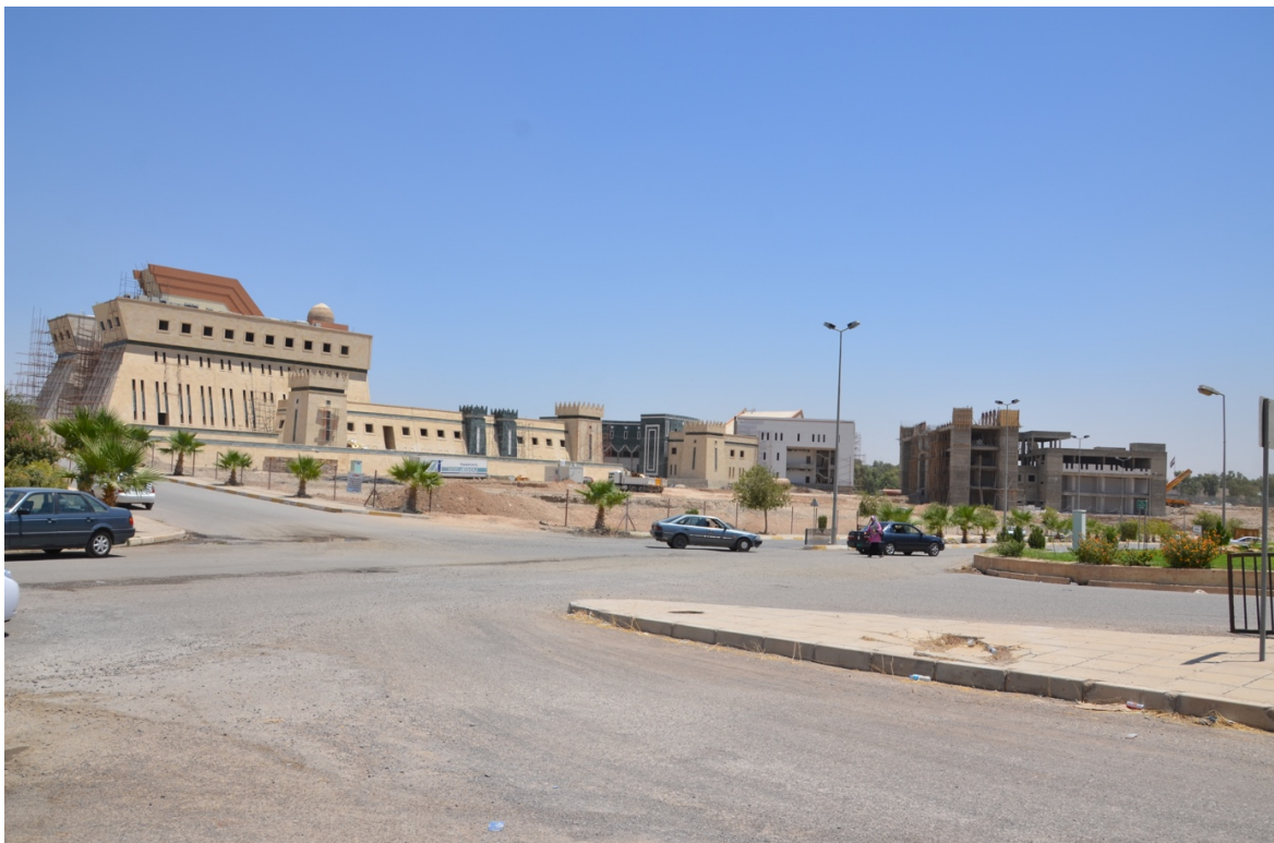
The Ashurbanipal Library Project building at Mosul University

In 2016, the site at Nimrud was destroyed by Islamic State (ISIS) in a well-documented iconoclastic attack. The Nimrud Rescue Project, run by the Smithsonian Museum, is now starting to gather the fragments left on site at Nimrud. The University of Mosul could play an important role in digitising, preserving and studying whatever remains.