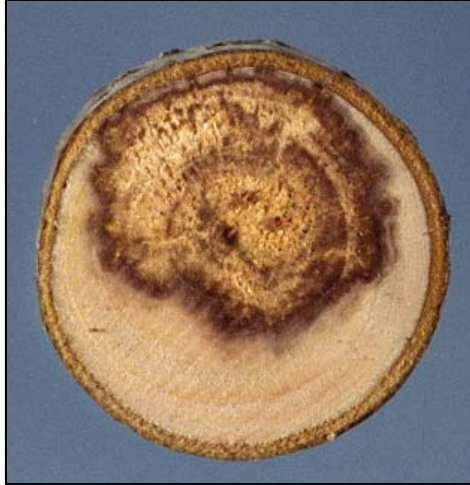
Decay in laurel oak and waxmyrtle caused by Inonotus rickii