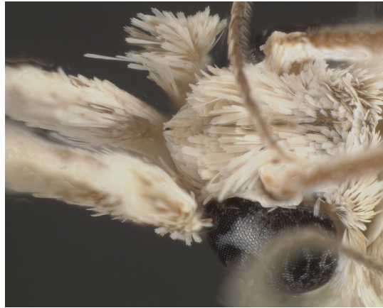
Fig. 2. Frons of E. loftini with central conical projection.