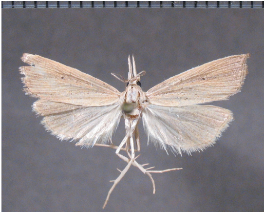
Fig. 1. Dissected male of Eoreuma loftini (Dyar) from Goethe State Forest. Scale in mm.

Identification card: http://www.lsuinsects.org/resources/docs/publications/pub3098_Mexican_Rice_Borer_ID_Card_LOW_RES.pdf [accessed 2012 Oct. 27]