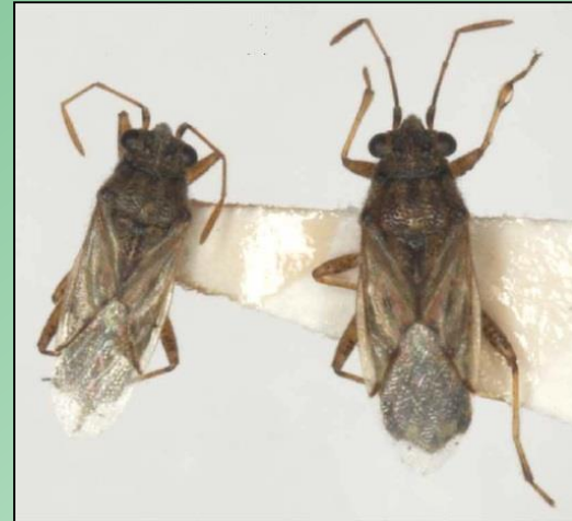
Nysius caledoniae . From Eyles, A. C. and M. B. Malipatil. 2010. Nysius caledoniae Distant, 1920 (Hemiptera: Heteroptera: Orsillidae) a recent introduction into New Zealand, and keys to the species of Nysius , and genera of Orsillidae, in New Zealand. Zootaxa 2484: 45-52.

Based on dissected genitalia. No screening or identification aids available yet.