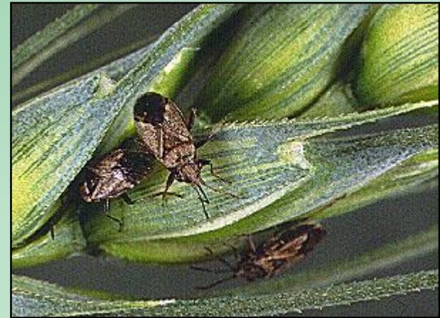
Nysius huttoni.