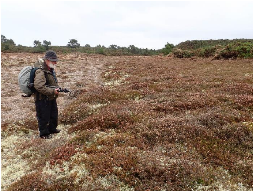
Figure 4. Dune heath amongst the gorse (GPR).

Dune Heath. The dune heath is acidic and below the shrub layer the moss carpet is dominated by Hylocomium splendens and, less frequently, Pleurozium schreberi . The more open patches of the heath next to the paths and tracks have a more diverse flora,