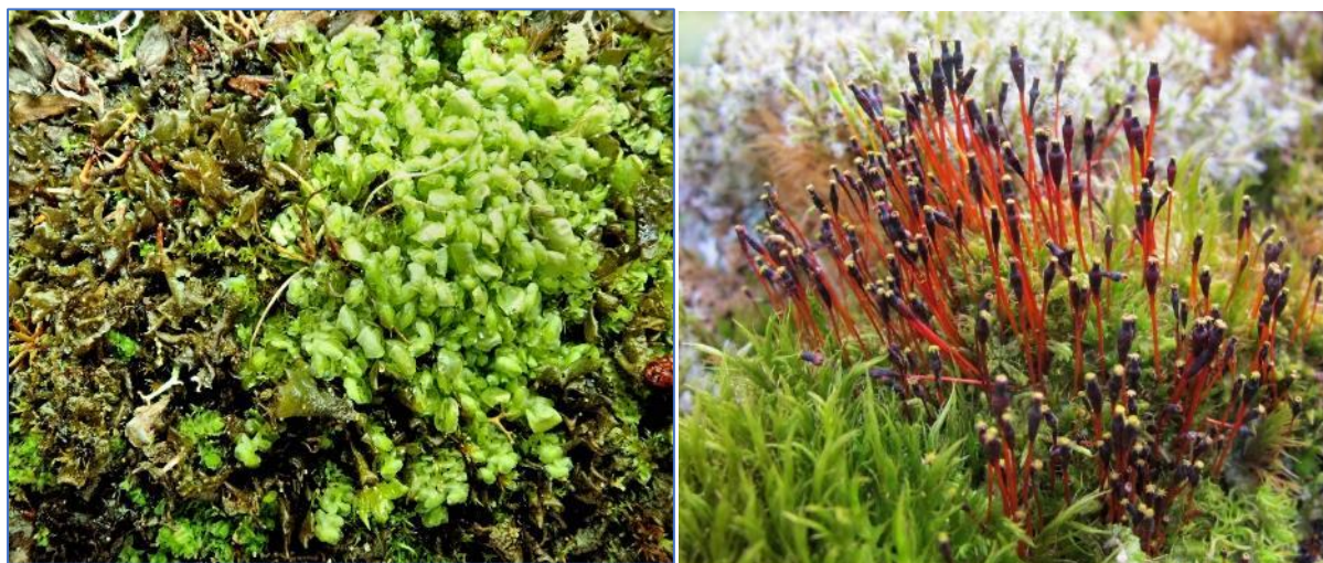
Figure 5. Scapania compacta (GPR) and Tetraplodon minioides (GPR)

overlooked are small patches of Lophozia bicrenata and Lophozia excisa and again both of these liverworts may have red gemmae.