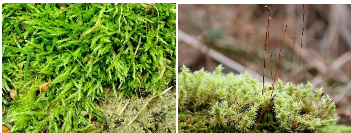
Figure 6. Brachythecium albicans (GPR) and Racomitrium ericoides (GPR).

The popularity of the site with local dog-walkers means that there is an abundance of suitable habitat for perhaps the most interesting species on the site, Tetraplodon mnioides (Figure 5). This is usually a species growing on fox scats and carrion up in the hills but here occurs on dog poo in at least two places. This moss is a member of an interesting group of montane and arctic species with fruiting bodies that release pheromones that attract flies and uniquely have sticky spores which adhere to the flies and so are transferred to other suitable substrates.