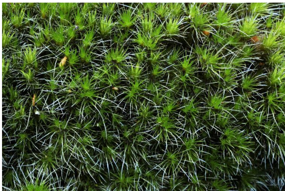
Figure 2. Campylopus introflexus (AWF)

Along the seaward edge of the woodland the trees are lower and there is more fallen wood giving a much more sheltered and humid habitat. Rhytidiadelphus triquetrus and Pseudoscleropodium purum still prevail here but there is also frequent Plagiothecium undulatum , some Lepidozia reptans and Lophozia ventricosa and in one place Sphagnum rubellum , the only place Sphagnum was seen on the site. The bryophyte flora on the dead wood and stumps is disappointing with many logs completely bare but Hypnum cupressiforme var. cupressiforme is relatively frequent as is Lophocolea bidentata and Nowellia curvifolia occurs on at least one log. On the frequent root-plates where there is some organic soil, the invasive Campylopus introflexus (Figure 2) is abundant and often dominant along with some Polytrichastrum formosum , Campylopus flexuosus and Ceratodon purpureus .