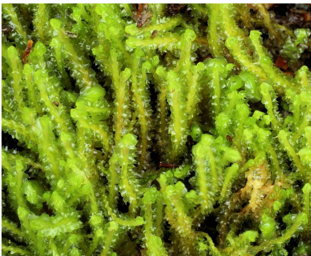
Figure 7. Barbilophozia hatcheri (AWF)

The survey recorded 51 taxa on the site, (39 mosses and 12 liverworts, listed in Annex 1) which is a respectable total for a small lowland site on the eastern side of Scotland with a limited range of habitat. Almost all of the species are very common in the area and the flora is very similar to parts of Culbin Forest just across the bay. The most unexpected species is Tetraplodon mnioides but the dog-walkers make sure that there is no shortage of suitable habitat. The abundance of Scapania compacta was also unexpected and there are few records for this species in lowland Grampian. Much the same is true of Lophozia bicrenata and Lophozia excisa and to a lesser extent, Barbilophozia hatcheri ; lack of suitable habitat plays its part but the low level of bryological recording in the area is also significant. The poor flora on the dead wood was disappointing but this may improve as the broadleaf woodland develops and humidity levels increase. Some removal of the dense gorse scrub would substantially increase the area available to bryophytes and presumably also the important lichen flora.