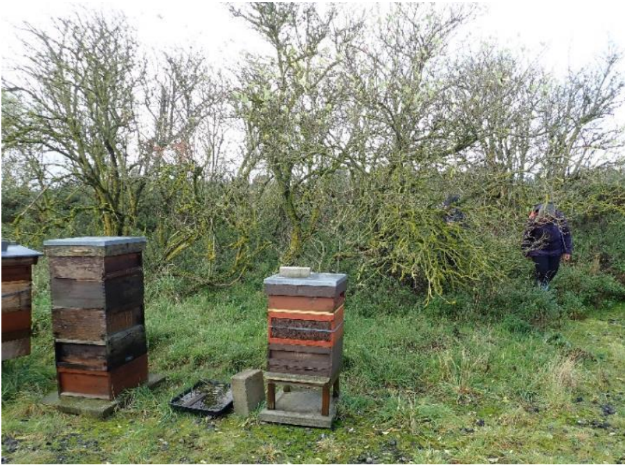
Figure 3. Old elders covered in bryophytes (GPR)

Dune Heath. The dune heath is acidic and below the shrub layer the moss carpet is dominated by Hylocomium splendens and, less frequently, Pleurozium schreberi . The more open patches of the heath next to the paths and tracks have a more diverse flora,