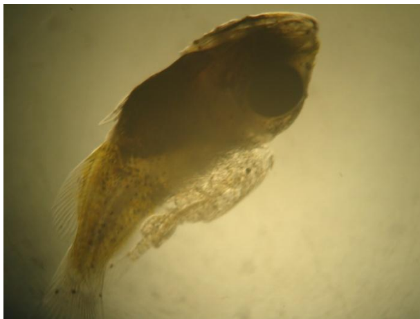
Fig 2: Caligus longipedis infected Amphiprion clarkii larval