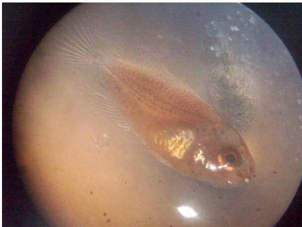
Fig 1: Caligus longipedis infected Amphiprion percula larval

It has moderately separated lunules. The cephalosome is more than 1/2 of the total body length. The genital complex is wider than long and much longer than the abdomen. The caudal rami are as long as the abdomen. Microscopically, it differs from all other members of the genus except C. robustus by having crescent-shaped sclerotized areas on the last segment of the inside branch of leg 2. Maximum Female is 3.8-5.5 mm and male 2.4-5.5 mm, geographic Range its available in worldwide. This parasite occurs on a number of inshore fishes. Its abundance offshore is less certain (Location in Host - External surface).