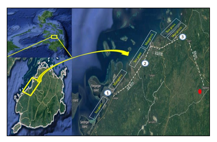
Fig 1: Map of the Philippines, Bohol and the three Sampling Sites with red dot indicating epicentre of the earthquake and broken lines distance from the epicenter (Google Earth, 2017)

Calape, Tubigon and Clarin were the most affected areas. Clarin was the nearest with 8 kilometers away from earthquake epicenter (Sagbayan), followed by Tubigon (15kms) and Calape (33kms) respectively. Station 1, Calape is located at 9° 53' 20" North, 123° 53' 0" East. This is the third income class municipality in the province. Municipal water of the area is about 12,486 hectares and 21.68 kilometers shoreline length excluding offshore island <sup>[18]</sup>.