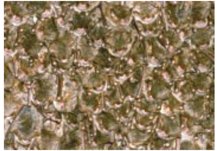
roost