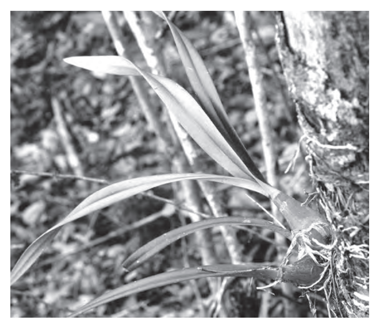
Above: A robust specimen of Encyclia tampensis growing in the shade of a hardwood hammock in eastern Everglades National Park shows the onion-like appearance of the plant, with its conical pseudobulb topped by tough green leaves. The appearance of the plant accounts for the understandable common name Onion Orchid among old-time South Florida orchid growers. Photographed on February 23, 1995, by Chuck McCartney.

Another big problem with the common name of "Butterfly Orchid" for Encyclia tampensis is that around the world, there are several other orchids given that vernacular designation. Most especially, that name belongs to a small group of orchids from northern South America (and adjacent Trinidad, which is, floristically and geologically, just a piece of the South American continent that got separated in relatively recent times). These distinctive orchids at one time were placed in a large, diverse assemblage of orchids lumped into the genus Oncidium and now, understandably, segregated into the genus Psychopsis , which contains just four species (although some authorities include a fifth). The prime example of the genus is the