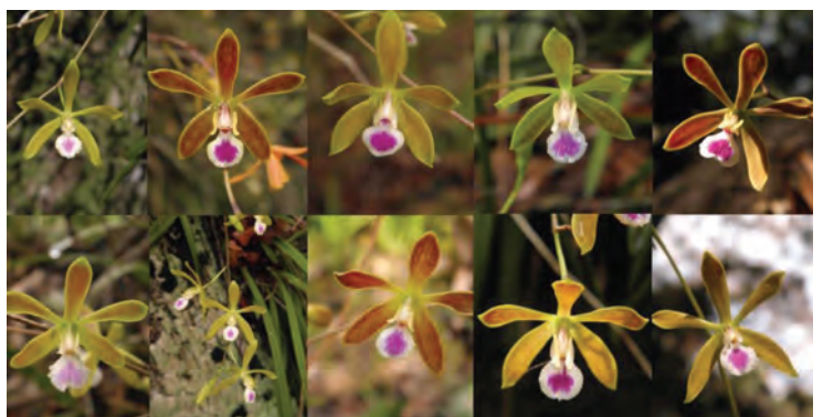
Above: Intrepid amateur field botanist Jake A. Heaton created this photo combo showing variations of Encyclia tampensis flowers he photographed in Sarasota County, Florida.

Above: Not all plants of Encyclia tampensis growing in full sun become miniaturized. Environmental consultant Jack Lange observes a sizable specimen flowering profusely on a dead Buttonwood tree ( Conocarpus erectus ) in a coastal prairie near Flamingo in the Monroe County portion of Everglades National Park. Photographed on May 24, 2000, by Chuck McCartney.