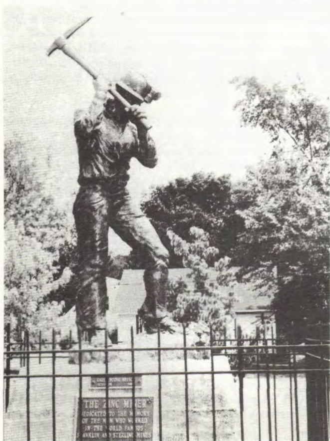
Dedicated to THE MEN WHO WORKED THE FRANKLIN AND STERLING MINES