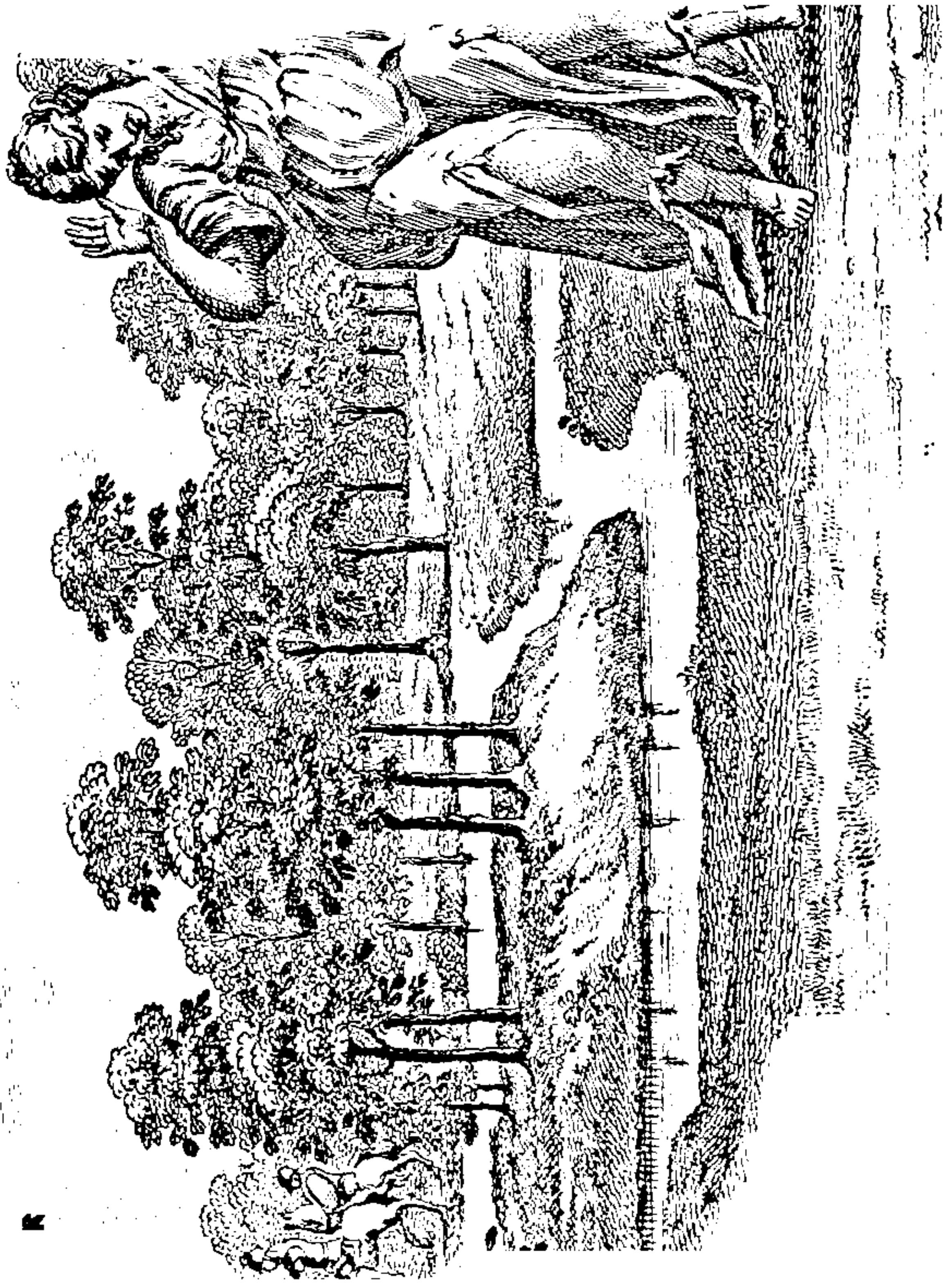
Belphebe by a Dove restores the Squire