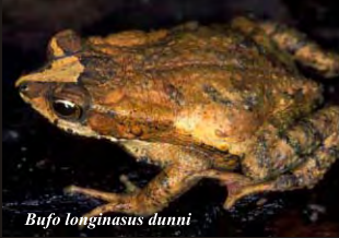
Bufo longinasus dunni