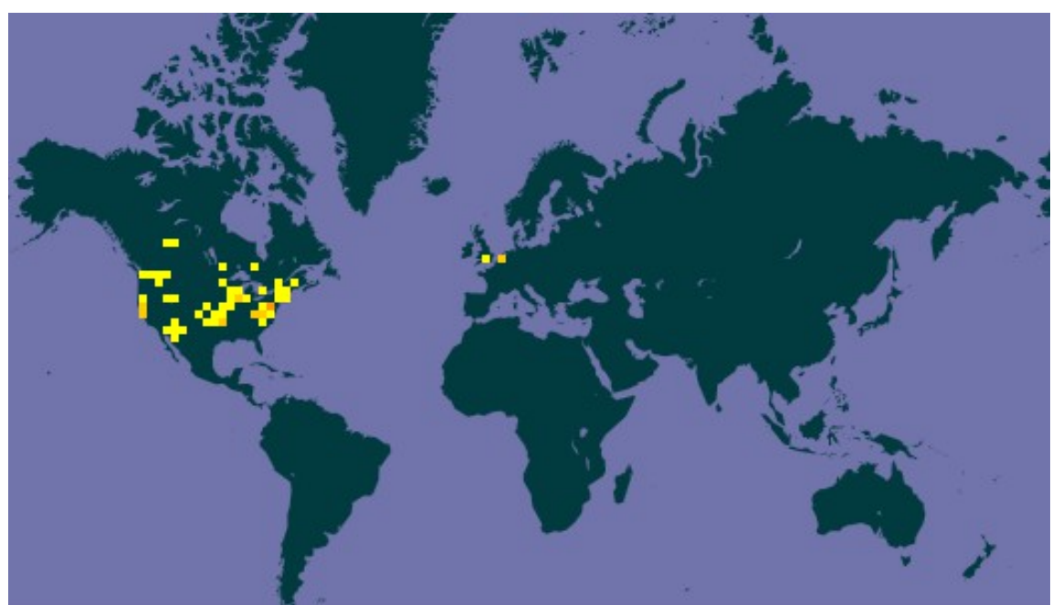
Figure 1. Global distribution of O. virilis . Map from GBIF (2015).