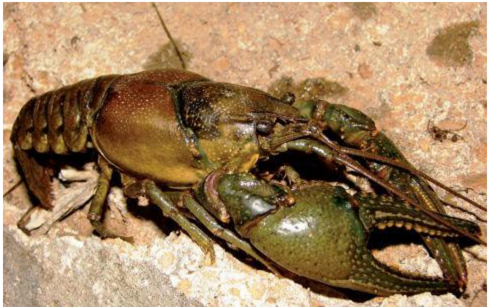
Photo: © Jan Bosselaers, in Loughman and Simon (2011). Licensed under a Creative Commons Attribution License.

US Fish and Wildlife Service, February 2011 Revised, June 2015