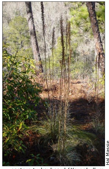
eastern turkeybeard (Xerophyllum asphodeloides) at Sprewell Bluff