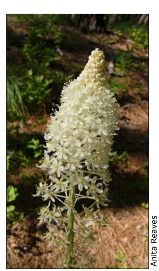
Turkevbeard's inflorescence is a showy dense raceme.

Eastern turkeybeard is an herbaceous perennial that grows in grass-like tufts. The basal leaves are evergreen, 16-20 inches long, arching, thin and stout, with small sawteeth along the margins. Without flowering stems, this plant can easily be dismissed as a grass from a distance. The leaves arise from a woody rhizome with thick roots. The flowering stem can reach 5 ft tall and has narrow leaves along its entire length. The leaves at the base of the stem are 5-7 inches long, but gradually taper toward the top. The inflorescence