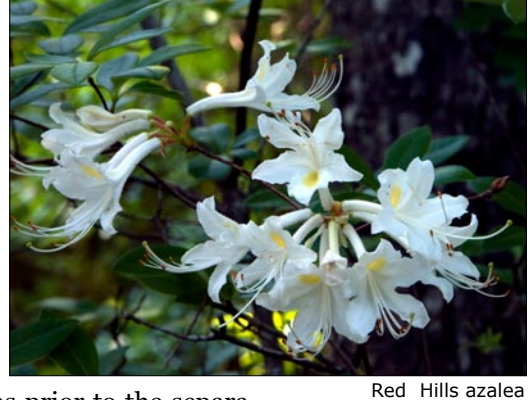
Red Hills azalea (Rhododendron colemanii)