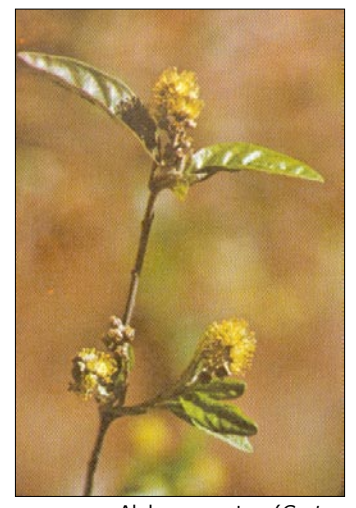
Alabama croton (Croton alabamensis) Illustration from Wildflowers of Alabama and Adioining States.

In contrast, Mohr's Barbara's buttons (Marshallia mohrii), which grow only in a few spots in northwest Georgia and