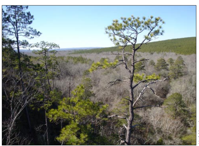
The site where the eastern turkeybeard was found is a place of stunning scenery.

over the botanical name for turkeybeard, the family is another matter altogether. Traditionally included in the Liliaceae, some botanists now include Xerophyllum in the bunchflower family, the Melanthiaceae, based on molecular evidence. Alan Weakley's Flora of the Southern and Mid-