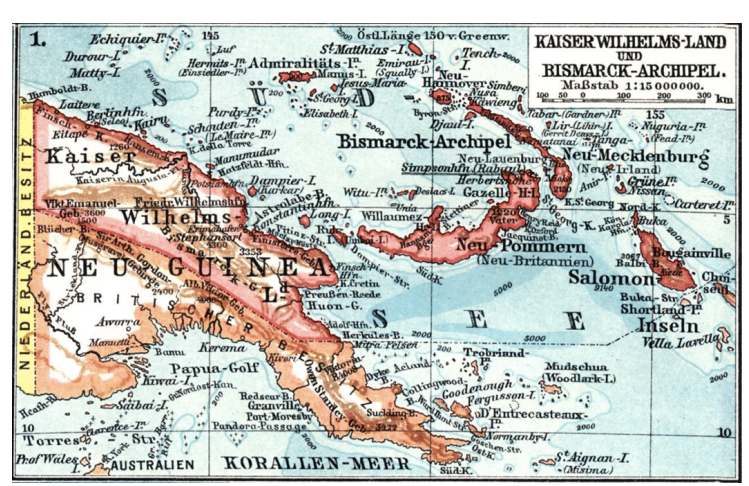
Map 2: Map of German New Guinea (Brockhaus 1911)

When children became teenagers and were ready to leave the orphanage, nuns would match them with other teenagers at the orphanage for marriage. Their children were the first generation to grow up with Unserdeutsch as a home language. Many of these children were boarding students at Vunapope like their parents had been. They were joined by both new mixed-race children taken, often without their mothers' permission, by missionaries and Asian children sent to study at the school as boarding or day students. After the first generation, the speech community was therefore always composed of a core for whom the language was a home language and those who learned it as a second language.