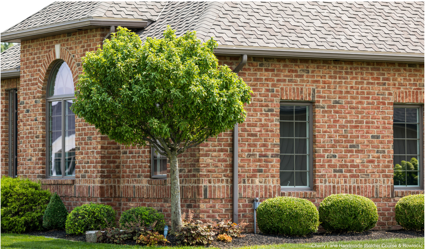
Cherry Lane Handmade (Soldier Course & Rowlock)

A rowlock is a course of brick laid on the long narrow side with the short end of the brick exposed. The rowlock is similar to the header course except that the brick are laid on narrow or face edge. This type of course is often used as the top course or cap of garden walls and as window and door sills.