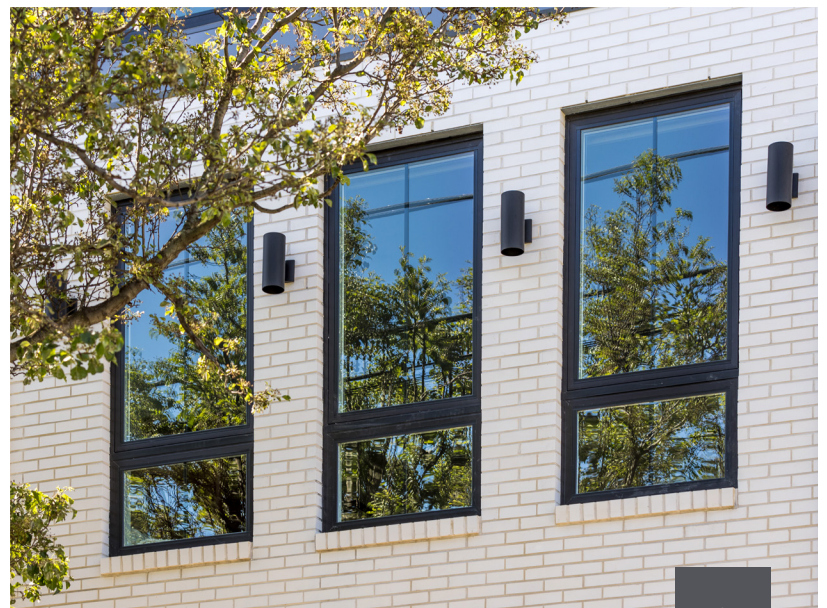
Aspen White (Rowlock)