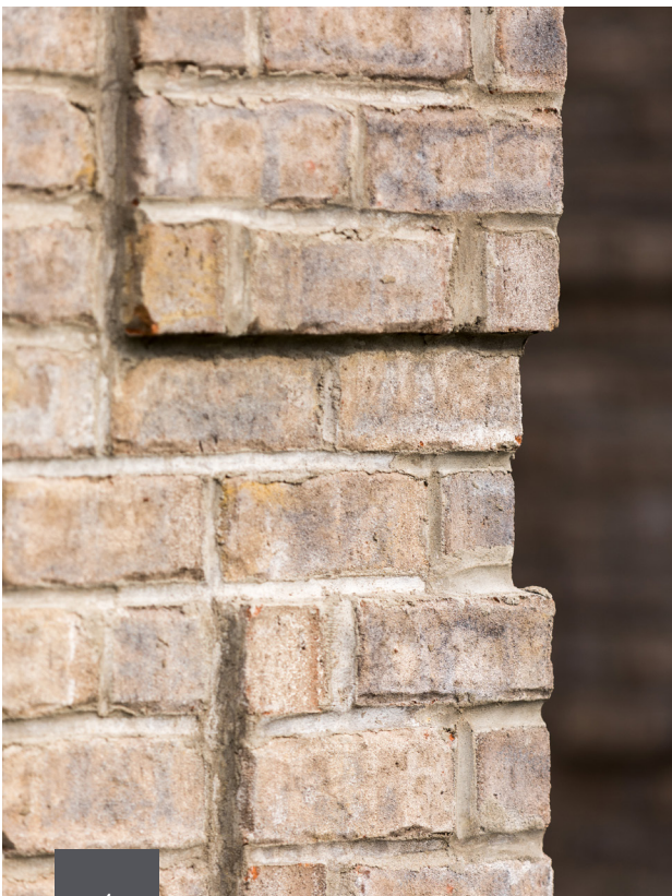
Anchor Bay (Quoins)