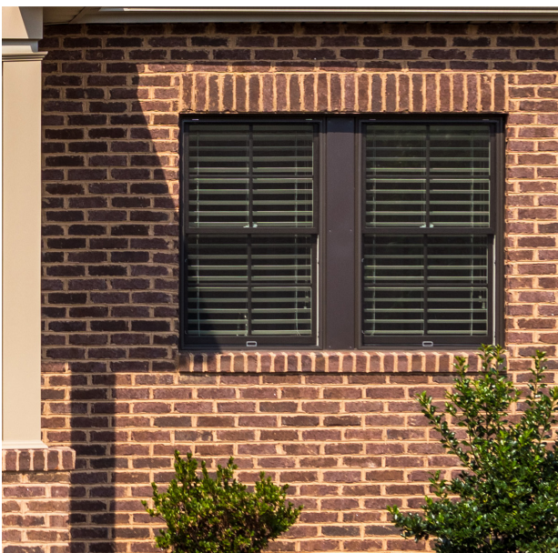
Battle Creek (Soldier Course & Rowlock)