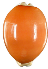
CYPRAEIDAE Lyncina aurantium