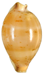
CYPRAEIDAE Notadusta martini