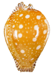
CYPRAEIDAE Perisserosa guttata guttata