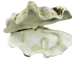
CARDIIDAE Tridacna squamosa