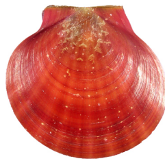
PROPEAMUSSIIDAE Amusium oblitteratum