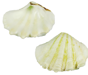
CARDIIDAE Tridacna crocea