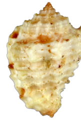
HARPIDAE Morum kurzi