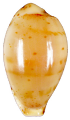
CYPRAEIDAE Palmulacypraea katsuae katsuae