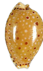
CYPRAEIDAE Erosaria beckii