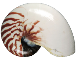
NAUTILIDAE Nautilus pompilius and related species