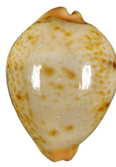
CYPRAEIDAE Lyncina porteri