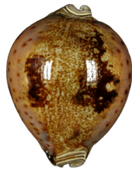
CYPRAEIDAE Leporicypraea valentia