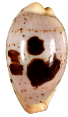
CYPRAEIDAE Palmadusta saulae saulae