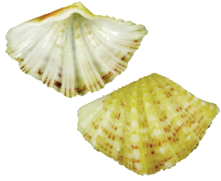
CARDIIDAE Hippopus cf. hippopus