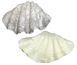
CARDIIDAE Tridacna gigas