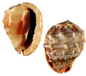
CASSIDAE Cypraecassis rufa