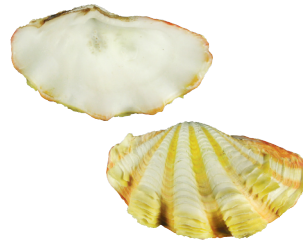
CARDIIDAE Tridacna maxima