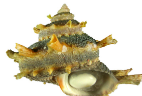
TURBINIDAE Bolma girgylla