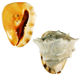
CASSIDAE Cassis cornuta