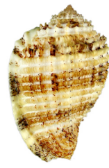
HARPIDAE Morum grande