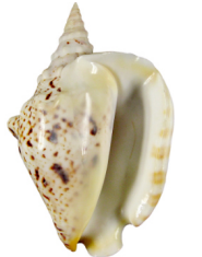
STROMBIDAE Tricornis thersites