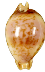
CYPRAEIDAE Nesiocypraea teramachii