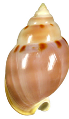
CASSIDAE Semicassis glabrata