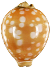
CYPRAEIDAE Lyncina leucodon leucodon