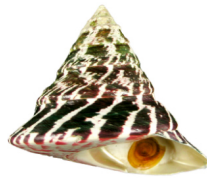
TROCHIDAE Trochus niloticus