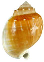
CASSIDAE Echinophoria wyvillei