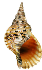
RANELLIDAE Charonia tritonis