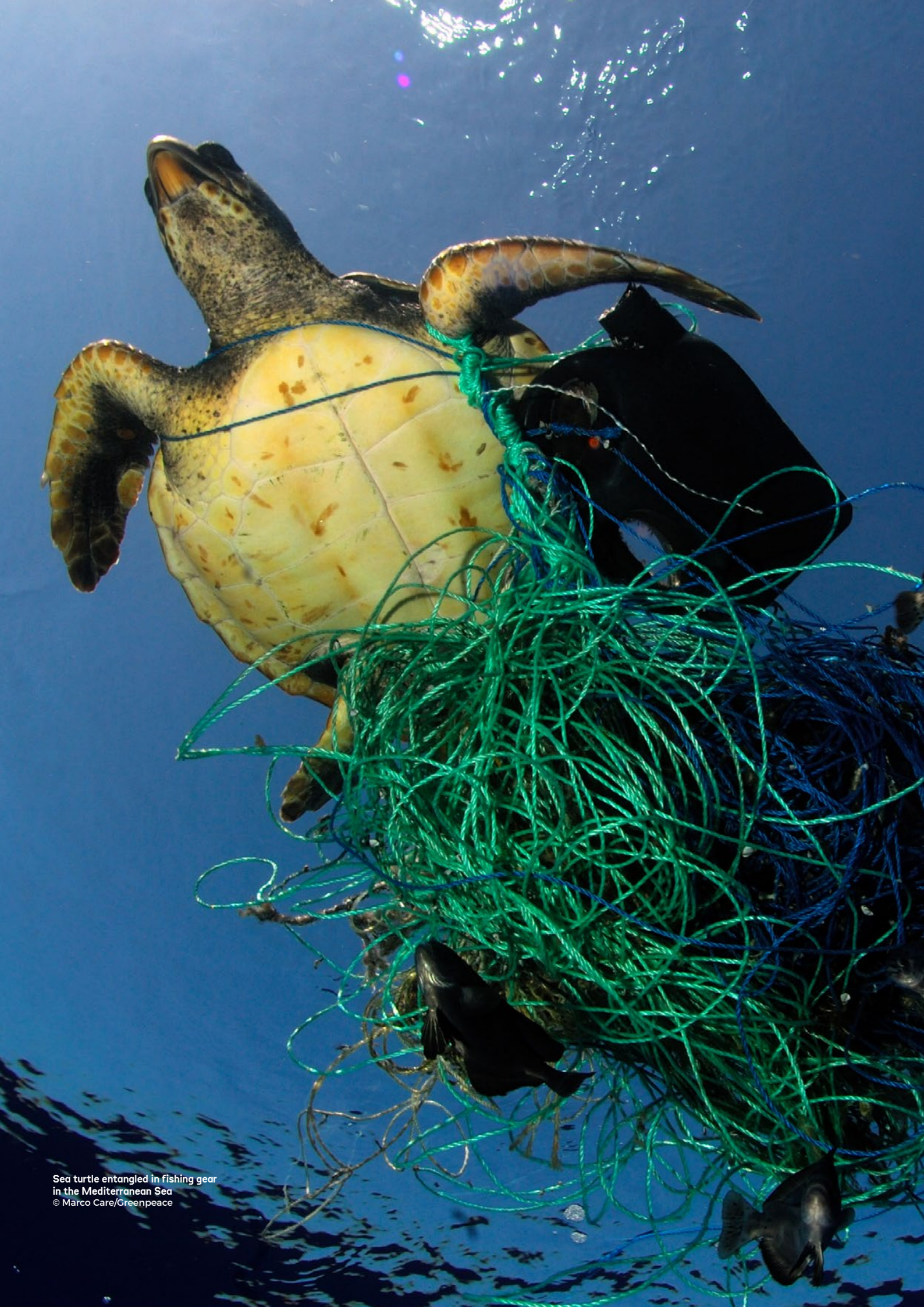
Sea turtle entangled in fishing gear in the Mediterranean Sea