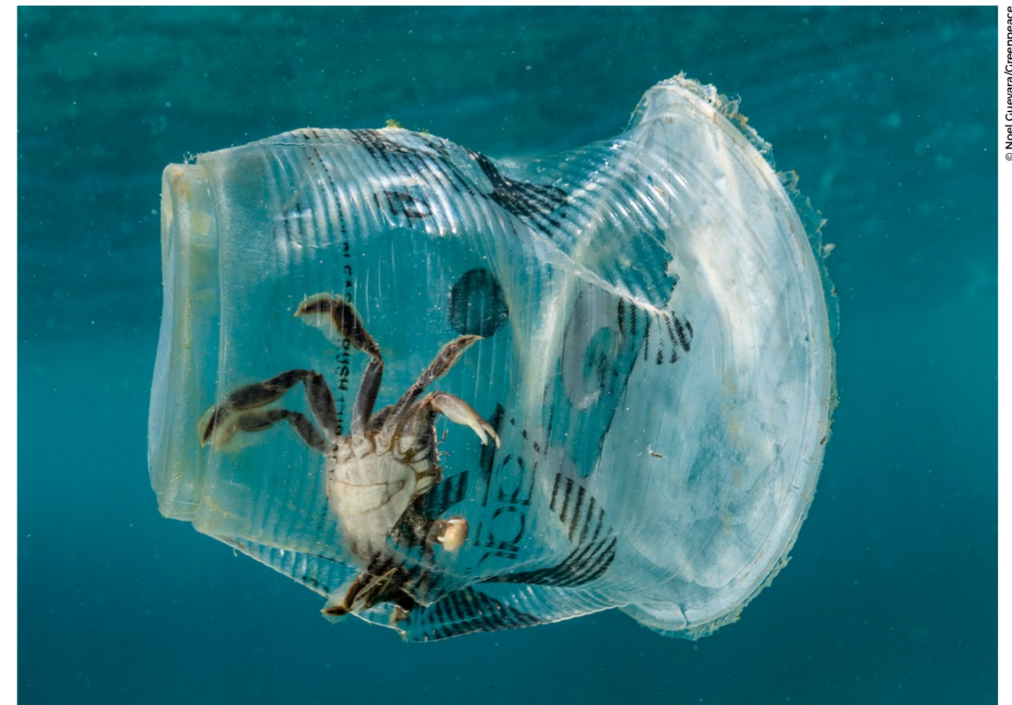
Plastic Waste in Verde Island, Philippines: A crab was trapped inside a discarded cup in Verde Island Passage, the epicenter of global marine biodiversity, in Batangas City, the Philippines.

Target 14.1 of the UN's Sustainable Development Goals requires that countries “by 2025, prevent and significantly reduce marine pollution of all kinds, in particular from land-based activities, including marine debris and nutrient pollution.” 67 The UN General Assembly (UNGA) has also adopted several more specific resolutions on abandoned, lost and discarded fishing gear, in particular UN Resolution 60/31 (2005). The 2018 UNGA Sustainable Fisheries Resolution calls on States and RFMOs, once again, to adopt effective management measures to address the issue of lost or abandoned fishing gear and related marine debris. 68, 69