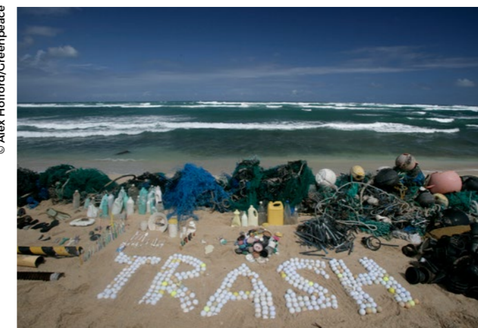
Defending Our Oceans Tour – Hawaii Trash (Hawaii: 2006) Plastic is displayed on a beach and the word 'Trash' is spelt out from golf balls. It highlights the diverse range of sources from which the plastics in our oceans originate.

This new legally binding treaty is meant to overcome existing fragmentation and ensure comprehensive protection of marine biological diversity on the high seas. In particular, the Treaty should pave the way for the creation of a network of fully protected areas covering at least 30% of the oceans, including areas on the high seas, by 2030, following scientific recommendations. 83