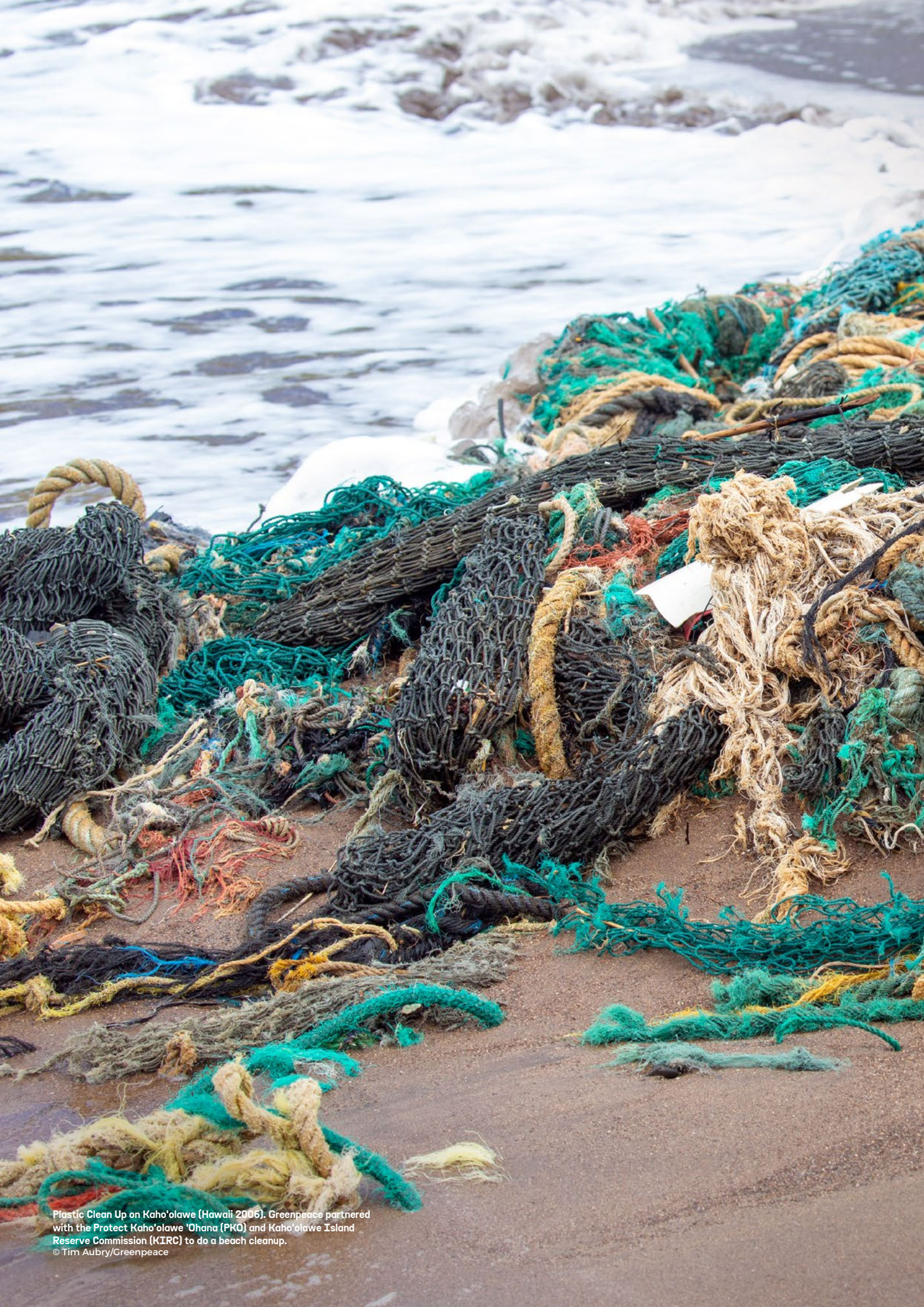
Plastic Clean Up on Kaho'olawe (Hawaii 2006). Greenpeace partnered with the Protect Kaho'olawe 'Ohana (PKO) and Kaho'olawe Island Reserve Commission (KIRC) to do a beach cleanup.