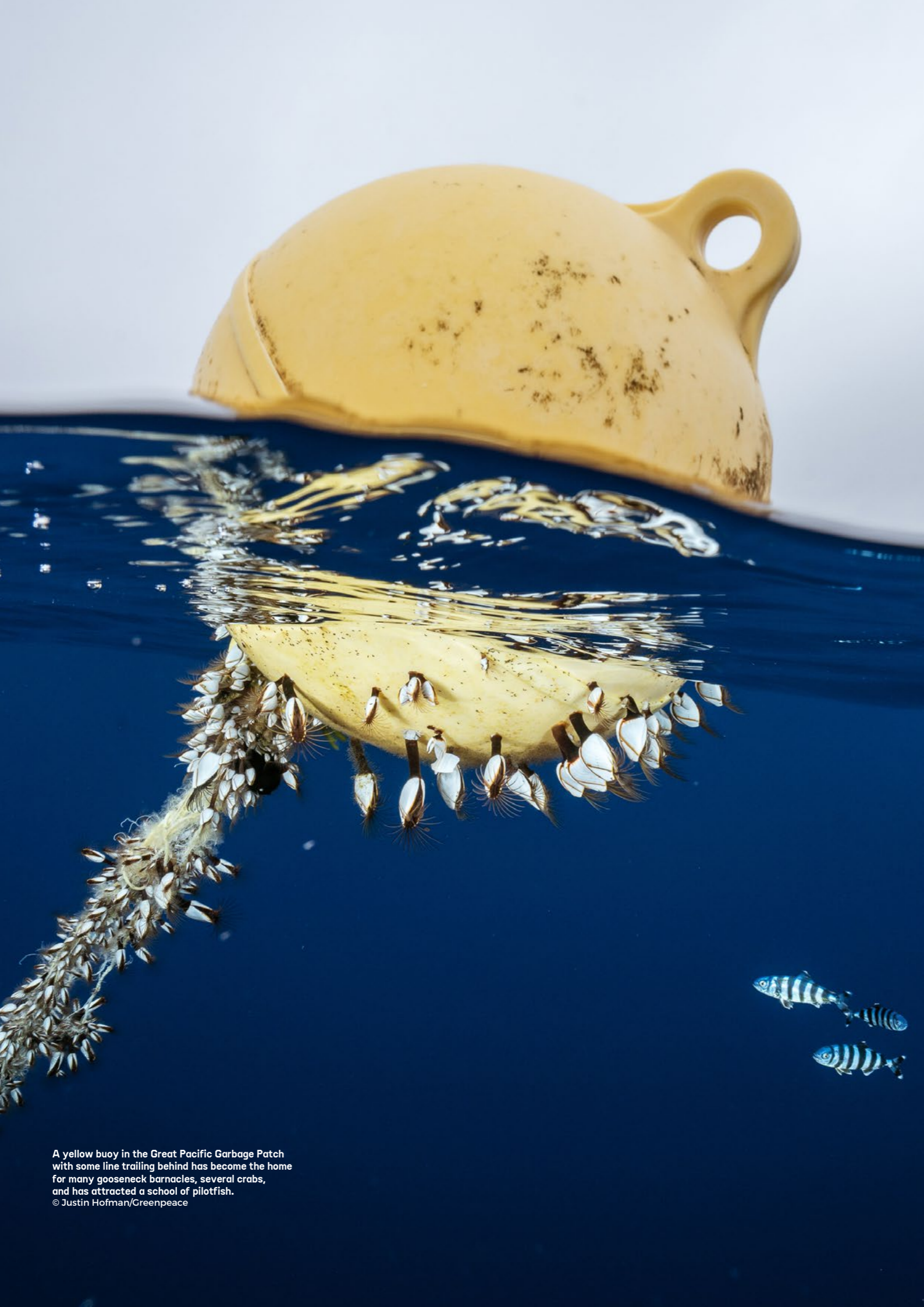
A yellow buoy in the Great Pacific Garbage Patch with some line trailing behind has become the home for many gooseneck barnacles, several crabs, and has attracted a school of pilotfish.