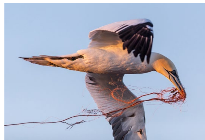
A Northern Gannet ( Morus bassanus ) on the "Lummenfelsen" on Helgoland carrying a plastic rope to build up his nest. Chickens of various bird species often get strangled in plastic ropes used as nesting material.

There have been few controls put on dFAD use, and the numbers of dFADs released are largely unknown. 27,28 An estimate of the total number of dFADs put in the oceans in 2013 suggested it was in the range of 81,000 and 121,000. 29 More recent estimates for the largest tuna fishing grounds of the Western and Central Pacific alone, were 30,700-56,900 dFAD deployments in 2016 and 44,700-64,900 in 2017. 30 In the Eastern Tropical Pacific Ocean, total numbers of dFADs deployed per year have increased steadily, from about 4,000 in 2005 to almost 15,000 in 2015. 31 In the Atlantic Ocean dFAD numbers have increased in recent years, potentially reaching 18,000 or more dFADs in 2014, an estimated 3.7-fold increase since 2004. 32 A 2014 paper estimated that European Union-flagged vessels alone deployed 10,500 to 14,500 dFADs in Indian Ocean waters in 2013. 33