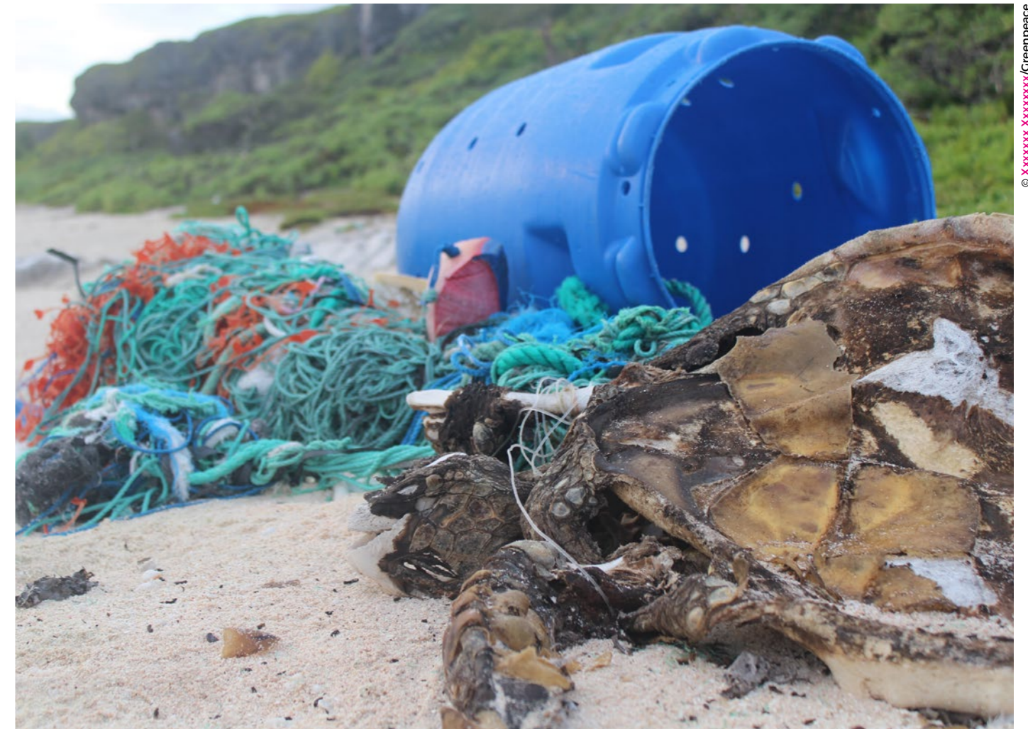
Adult female green turtle ( Chelonia mydas ) entangled in fishing line on North Beach, Henderson Island.

Gillnets are the main villains of ghost fishing. Loss rates depend on where and how they are used, as do the impacts. For example, those that touch the bottom are more likely to be lost, as are those left unattended. Similarly, those used in shallow coastal waters (under 200 metres depth) have a lower loss rate and are easier to recover, while deep water (over 500 metres) gillnets are the most problematic due to excessive net lengths, increased soak times and gear stress. 14 The United Nations (UN) banned the giant drifting gillnets of over 2.5 kilometres long from international waters in 1992, but in deep-sea, bottom-set gillnet fisheries where shorter nets of 50-100 metres are used, a single vessel can still set many hundreds of gillnets in one area. 15 In a 2005 study, deep-water fisheries in the northeast Atlantic accounted for more than 25,000 of the total 33,038 gillnets reported lost. 16 Adding to their deadly impact, deep-water fish species tend to be slow growing, live a long time, and have few young, which makes their populations highly vulnerable to targeted fishing, let alone ghost fishing.