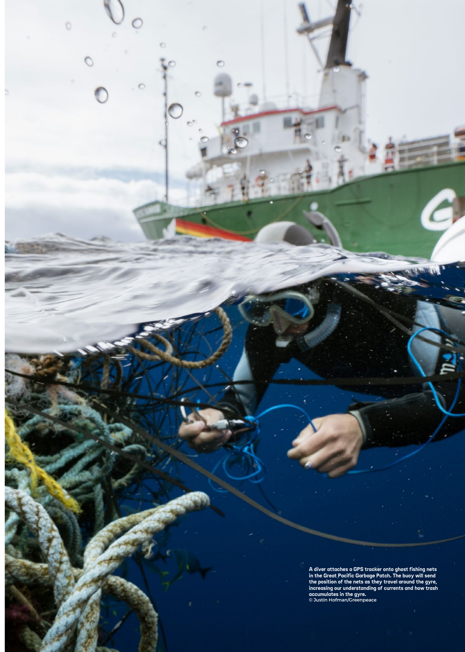
A diver attaches a GPS tracker onto ghost fishing nets in the Great Pacific Garbage Patch. The buoy will send the position of the nets as they travel around the gyre, increasing our understanding of currents and how trash accumulates in the gyre.

These figures provide yet another example of the impact of fishing activities on the marine environment globally and question the extent to which governments, individually or through the various organisations they are parties to, are effectively ensuring the conservation of our oceans. There is an urgent need for effective measures to minimise the loss of fishing gear, ensure coordination among all existing organisations and swiftly move from words to action.