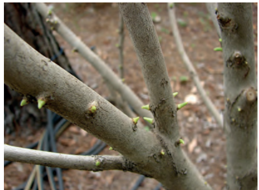
New buds emerging one month after pruning.