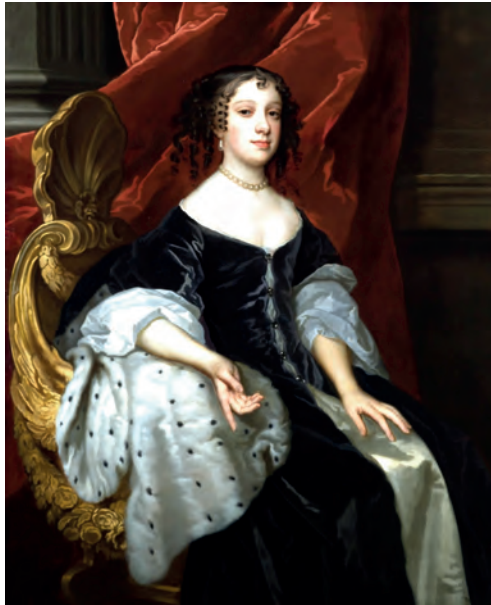
Princess, Catherine of Braganza, wife of Charles II, King of England, Scotland and Ireland

Hague at the age of eighteen for safety reasons during the Second English Civil War where tea was readily available in the Dutch capital and where he, too, had grown quite fond of it. Strangely enough, this may have been the only like they had in common, the marriage having been an arranged one and Charles being most licentious.