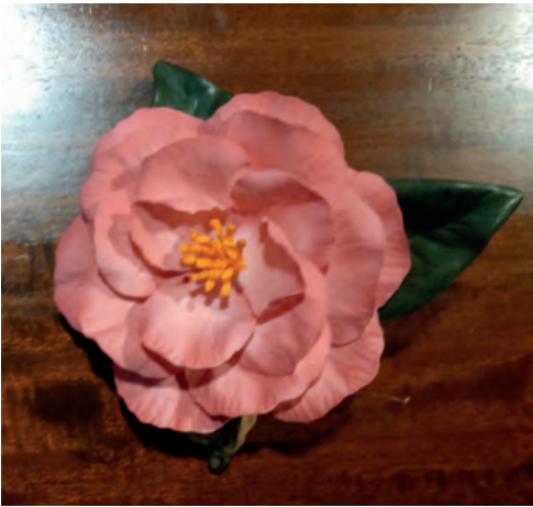
'Walter D. Bellingrath' Boehm porcelain on display at ACS headquarters.

As I left the garden, I encountered the gift shop. There was a sales display case of Boehm porcelain camellias. One was labeled 'Walter D. Bellingrath.' On the bottom the identity is F348 'Bellingrath Camellia, limited edition.'