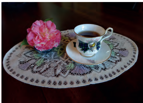
Tea served in Bone China