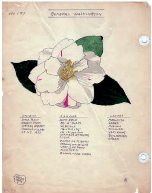
'General Washington' Stock plant bought from Cottage Garden, Queen's Village, NY