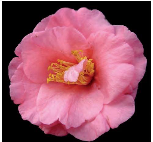
Mis-named 'Walter D. Bellingrath'