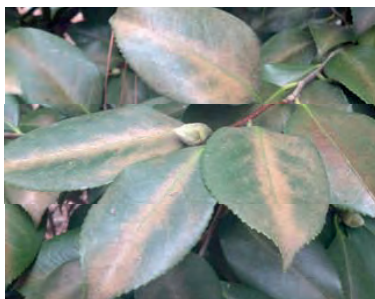
The bronzing of the midrib of the camellia leaf is a sure sign of spider mite damage.

Use any oil emulsion type product (ultrafine oil, dormant oil spray, etc.) and spray under the leaves to suffocate the scale or mites. A few drops of Dawn or similar liquid detergent help the spray to stick to the leaves. Spray again in a week or 10 days, since you will not be able to get them all in the first pass. After you've done this and got most of the plant scale-free, you can follow-up spray with Neem Oil, which acts as a long term preventive. It is absorbed by the plant and makes the plant unpalatable to insects and they starve to death.