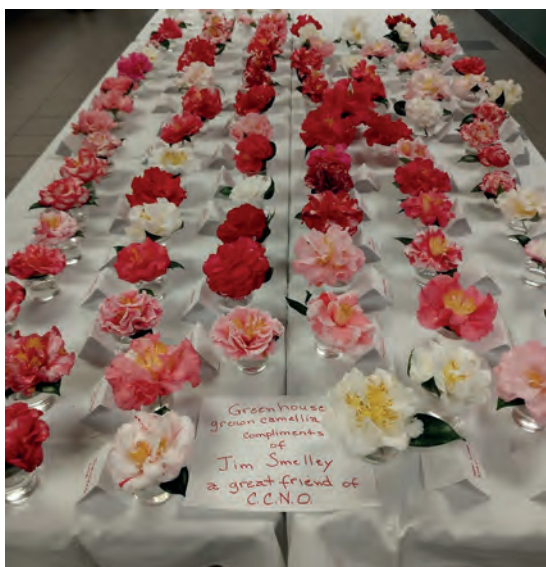
The Jim Smelley Display