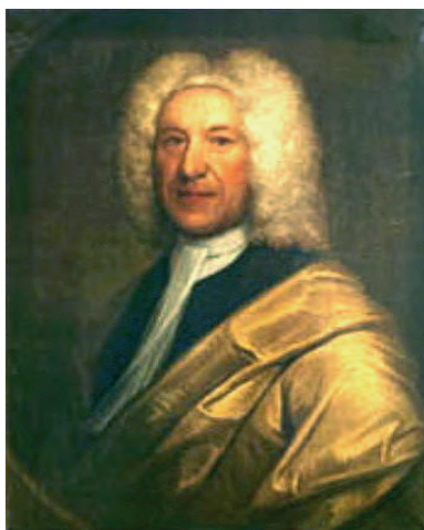
Thomas Twining, founder of Twinings of London (1675-1741)

selves – a revolutionary idea. Before this innovation, a woman had to send her husband or servant to purchase tea (or anything else) for her, or at least have a