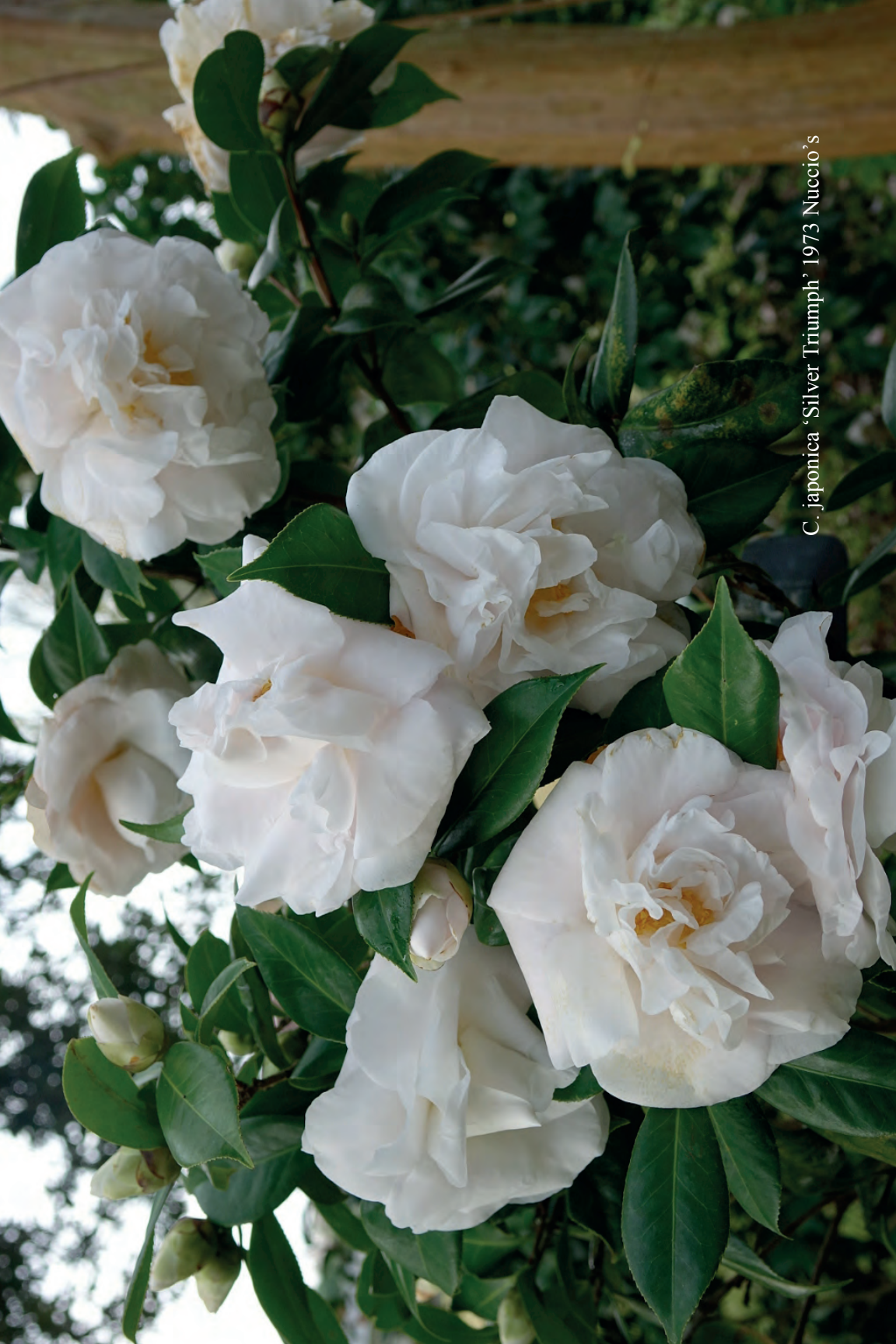
C. japonica 'Silver Triumph' 1973 Nuccio's