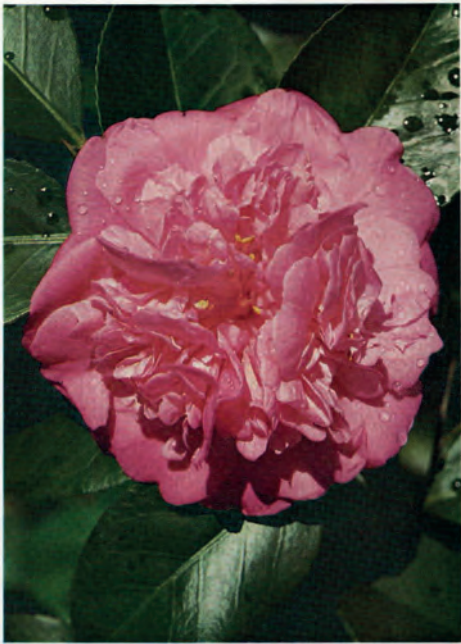
CAMELLIA JAPONICA • WALTER D. BELLINGRATH Plant Patent No. 1350