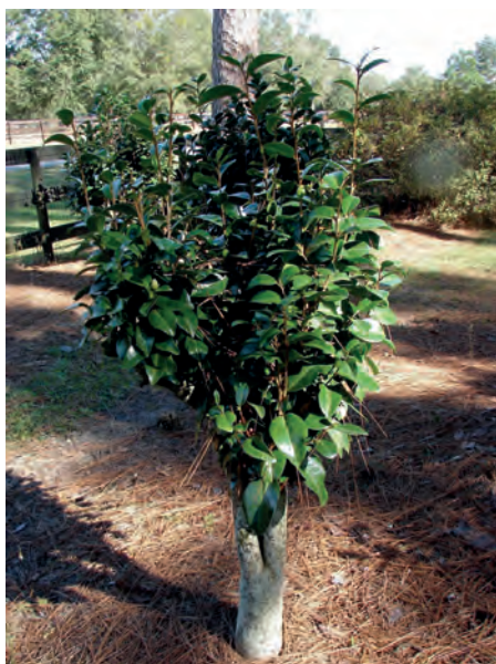
Growth six months after pruning.

it encourages undesirable growth close to the ground that is more susceptible to scale. When you cut large primary limbs cut at an angle so that water does not sit on the cut surface. Apply a wound paint to cuts two inches and larger. You can prune off all the side limbs and leave a skeleton of the plant or you can leave a few limbs with leaves. In any cases you will be removing 90% of the plant which will stimulate healthy new growth. Soon after pruning you should fertilize your camellia using 10-10-10 or something similar. Within a month you will see green buds growing directly out of the stems and by fall a healthy full camellia with beautiful shiny green leaves. Apply a fungicide to the new growth to prevent dieback on the young tender stems and leaves. You will not have any flowers in the first year following this type of pruning. The following year you can thin out some of the new growth to shape the plants for the best floral presentation.