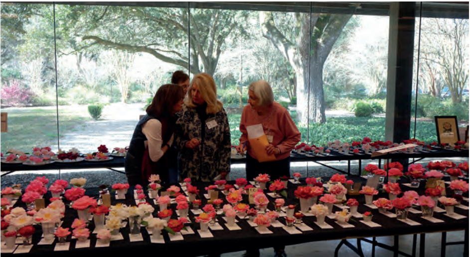
Judges huddle at Baton Rouge Show