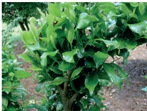
Growth after two months.