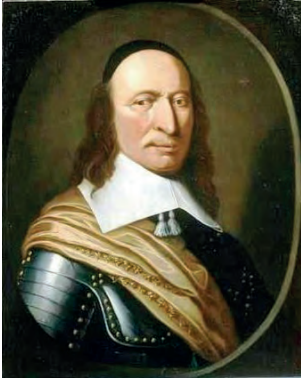
Peter Stuyvesant (1612-1672)

As the Dutch had access to most of the tea during the colonial period in America, it is no surprise that Peter Stuyvesant, Dutch governor in the American colonies,