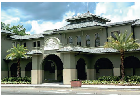
The Southern Hotel, Covington, LA