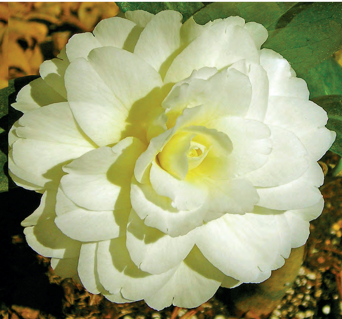
C. japonica 'Dahlohnega'

A Publication of the Gulf Coast Camellia Society