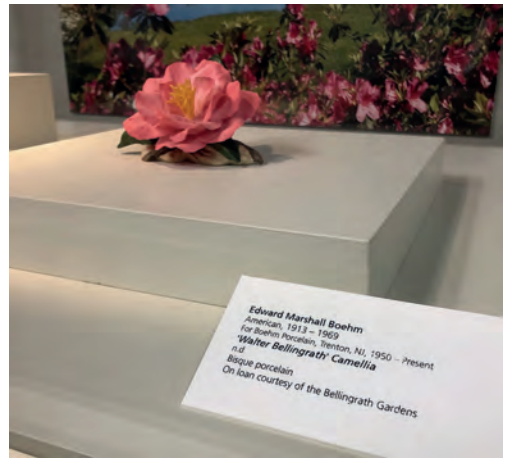
'Walter D. Bellingrath' Boehm porcelain on display at the Mobile Airport.

Right here in our own Mobile Airport, of all places, is an identical Boehm Porcelain just like yours, which you can see in a display by the Mobile Museum of Art for all visitors to see! I took a photo to use sometime. And like you, I also had purchased that same plant, thinking it was