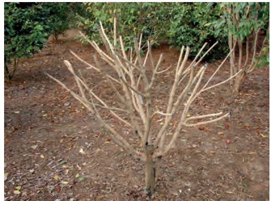
Large camellia after pruning back to 4' above ground.