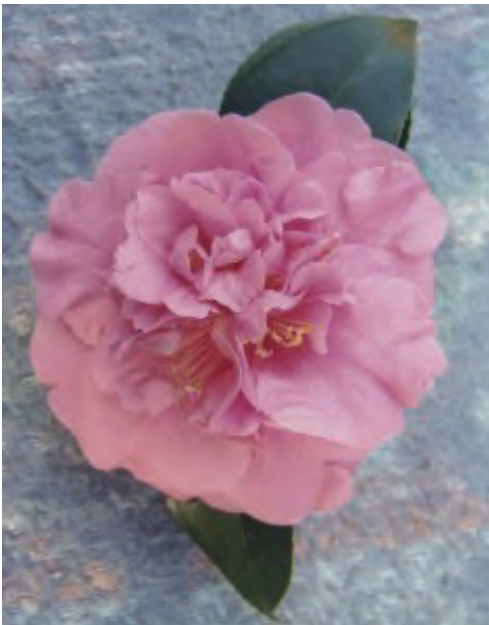
C. japonica ‘Walter D. Bellingrath’ frpm Bellingrath Gardens website.

‘Walter D. Bellingrath’ in 1957 ACS Yearbook shortly after registration.