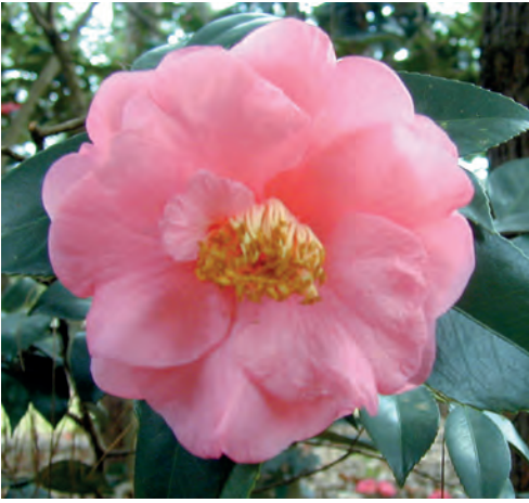
C. japonica 'Faith'

Forrest: Caroline - Glad the mystery is solved. Your pink bloom is indeed listed in Nomenclature. It is called 'Faith.'