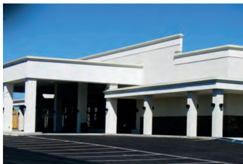
Lyman Community Center in Gulfport.

On Saturday, January 5 th I traveled with my blooms to the Northshore Camellia Society Show at the Southern Hotel in Covington, Louisiana. This