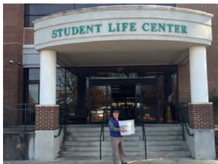
The new venue at Delgado Community College