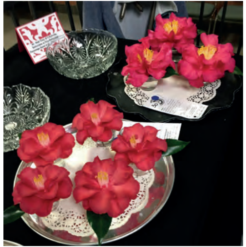
Tray of five and Best Tray of Three Hybrids c. retic. 'Miss Sally'