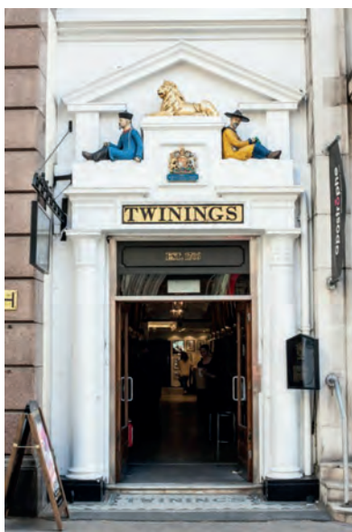
Twinings Tea House on the Strand, London Estd. 1717