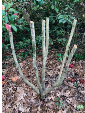
12 ' tall camellia after rejuvenation pruning.

Large old camellias are usually full of pine straw or leaves accumulated over several years, have scale on the underside of leaves and covered with algal leafspot on the upper sides of leaves and might have lichens growing along the trunk and branches. These plants need rejuvenation pruning where they are cut down to four feet from the ground and most of the small side limbs and leaves are removed. Why four feet? If you prune higher, most of the re-growth will be in the very top of the remaining limbs and it will look leggy. If you go lower