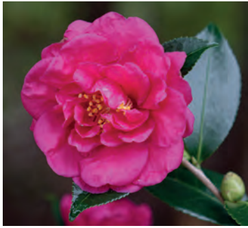
C. sasanqua 'Alabama Beauty' Tom Dodd Nursery, Semmes, AL