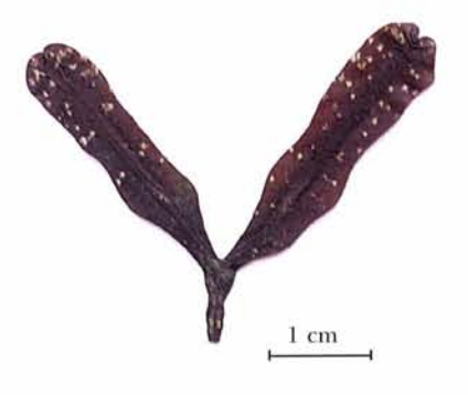
Figure 2. Fucus spiralis , a young specimen; the first attached fucoid recorded in Surtsey. Found in the upper littoral on the east shore in July 1997, 34 years after the creation of Surtsey.

In the sublittoral zone the total number of species collected in 1987, 1992 and 1997 was 32, 35 and 26 respectively. The greatest number og species was detected east of Surtsey where the coast is less exposed than elsewhere.