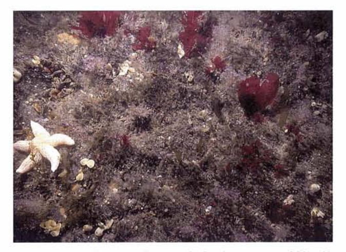
Figure 4. An underwater photograph showing an area of 60 x 40 cm of the bottom at 15 m at the west coast of Surtsey in July 1997. Species appearing in the photo are the seaweed species Delesseria sanguinea, Phycodrys rubens, Lomentaria orcadensis and juvenile Alaria esculenta. Prominent animal species are sea star, Asterias rubens, sponge, Grantia compressa, mussel, Mytilus edulis and hydroid, Tubularia larynx (photo: Karl Gunnarsson).