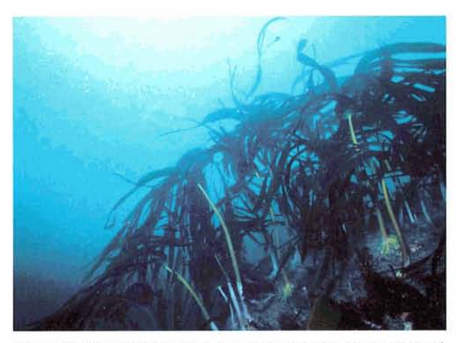
Figure 3. Laminaria hyperborea, a typical view of a Laminaria-stand on top of a boulder at the depth of 10 m at the east coast of Surtsey, in July 1997. The highest plants measure about 1.5 m in stipe length.

idly with depth. Laminaria hyperborea had its highest cover at 10 and 20 m where it formed dense stands on the top of the highest stones (Fig. 3). Brown filaments that consisted of a mixture of filamentous diatoms, Hincksia spp. and/or Ectocarpus spp. were found at all depths in all years and generally had high cover. In the sublittoral zone the most conspicuous herbivores observed were Echinus esculentus , Strongylo centrodus droebachiensis , Lacuna vincta , Padina pel-