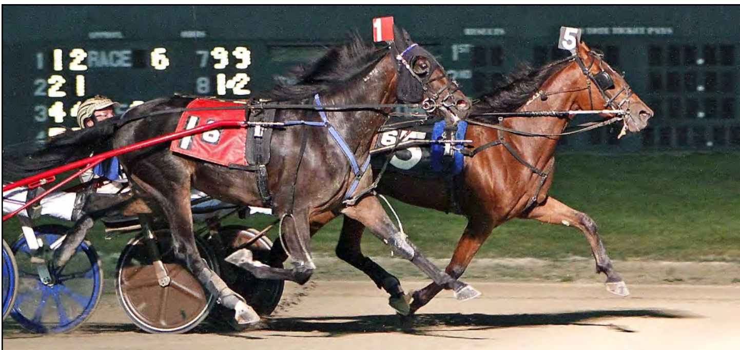
MJB Got Faith was undefeated in five starts at two.