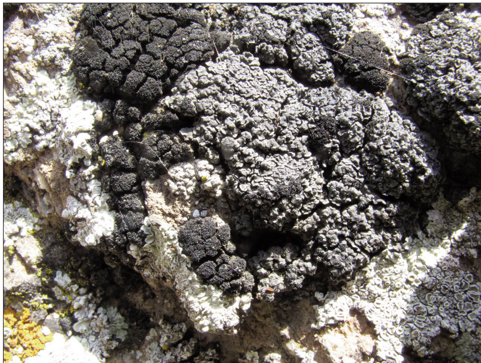
Fig. 3. Toninia cinereovirens and Thermutis velutina on limestone in the Khosrov Forest State Reserve.

Xanthoparmelia loxodes (Nyl.) O. Blanco, A. Crespo, Elix, D. Hawksw. & Lumbsch – 3c