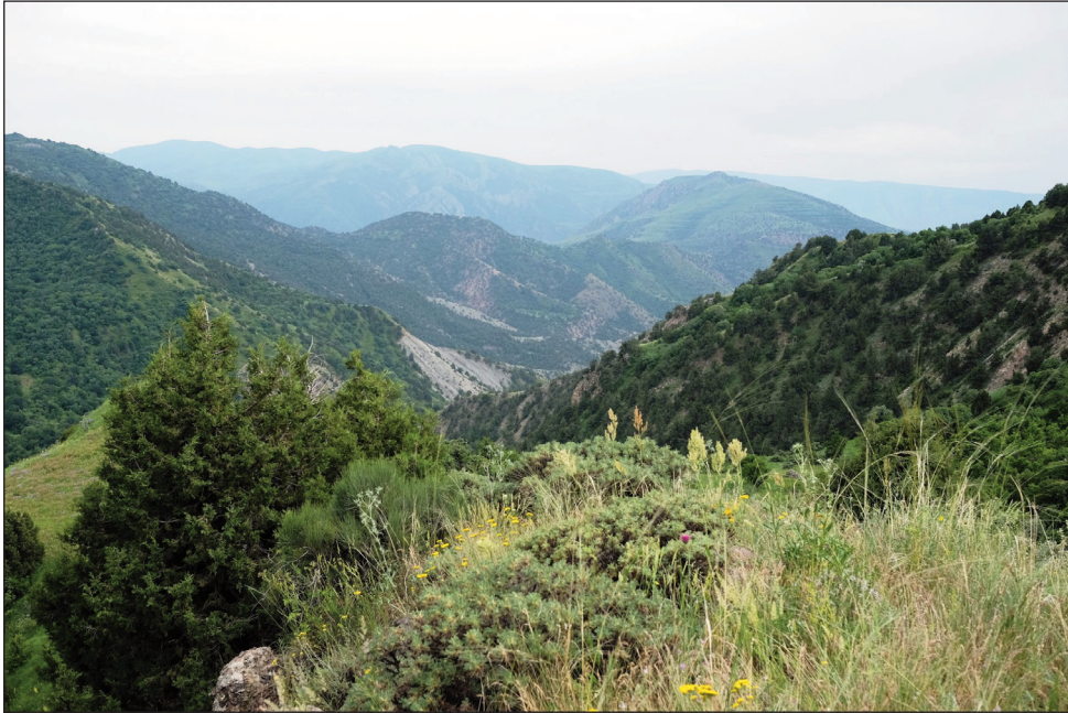
Fig. 2. Natural landscapes in the Khosrov Forest State Reserve.

lata , etc.), tragacanth ( Astragalus microcephalus and A. lagurus ) motley grass steppe, etc., dominate in the montane steppes (Anonymous 2008).