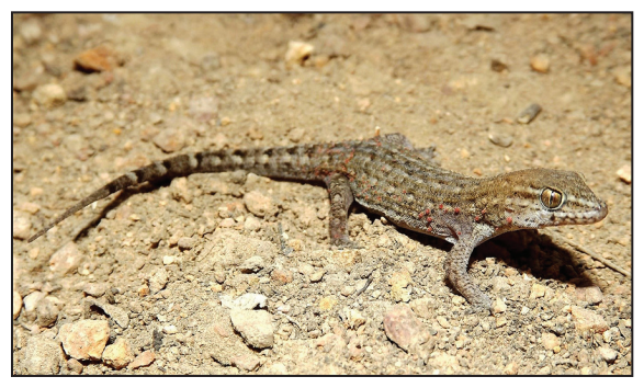
FIGURE 1. Adult male Naked-toed Gecko ( Gymnodactylus geckoides ) from Estação Ecológica de Aiuaba, Ceará, Brazil.

We collected 66 G. geckoides (Fig. 1), 30 from Aiuaba, 33 from Barro. Of the collected individuals, 21 had content in their gastrointestinal tracts. We identified six prey categories in the diet of G. geckoides . Orthoptera was the most important prey type both numerically