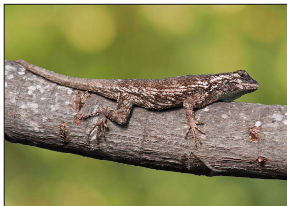
FIGURE 1. Pastel Tree Lizard ( Sceloporus melanorhinus ) during basking activity.

Study area. —El Salado Estuary (20°40'19.85"N, 105°14'11.35"W) is located in Puerto Vallarta, Jalisco, Mexico. Vegetation is dominated by Red Mangrove ( Rhizophora mangle ), White Mangrove ( Laguncularia racemosa ), and Black Mangrove ( Avicennia germinans ), as well as some species of deciduous forests such as West Indian Elm ( Guazuma ulmifolia ), fig trees ( Ficus sp.), and acacias ( Vachellia sp.). The climate is characterized by two seasons: the dry season from December to May, and the rainy season from June to November. The annual temperature fluctuates around 26° C, while precipitation fluctuates from 931 mm to