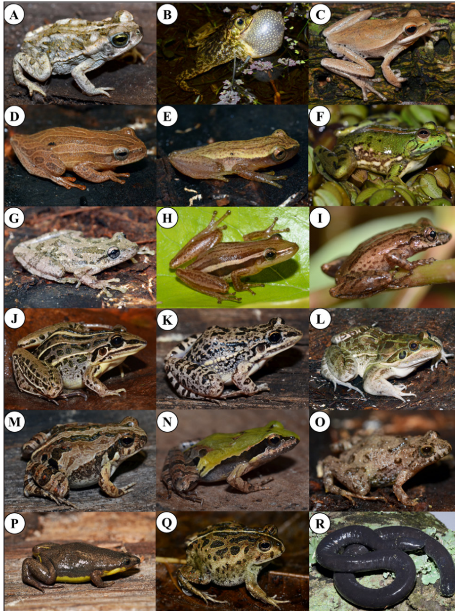
FIGURE 2. Amphibians of the Taim Ecological Station: (A) juvenile Common Toad ( Rhinella arenarum ); (B) Dorbigny's Toad ( Rhinella dorbignyi ); (C) White-banded Treefrog ( Boana pulchella ); (D) Lesser Treefrog ( Dendropsophus minutus ); (E) Sanborn's Treefrog ( Dendropsophus sanborni ); (F) Lesser Swimming Frog ( Pseudis minuta ); (G) Treefrog ( Scinax granulatus ); (H) Striped Snouted Treefrog ( Scinax squalirostris ); (I) Dwarf Snouted Treefrog ( Scinax berthae ); (J) Dumeril's Striped Frog ( Leptodactylus gracilis ); (K) Oven Frog ( Leptodactylus latinasus ); (L) Butter Frog ( Leptodactylus aff. luctator ); (M) Weeping Frog ( Physalaemus biligonigerus ); (N) Graceful Dwarf Frog ( Physalaemus gracilis ); (O) Hensel's Swamp Frog ( Pseudopaludicola falcipes ); (P) Two-colored Oval Frog ( Elachistocleis bicolor ); (Q) Lesser Ground Frog ( Odontophrynus maisuma ); (R) Caecilian ( Chthonerpeton indistinctum ).

were previously recognized, and the Water Snake ( H. c. infrataeniatus ) was later elevated to the species level (Deiques and Cechin 1991). We identified the species present in ESEC Taim as H. infrataeniatus . Although different forms of Military Ground Snake ( Liophis miliaris ) were recognized at the time of publication of the