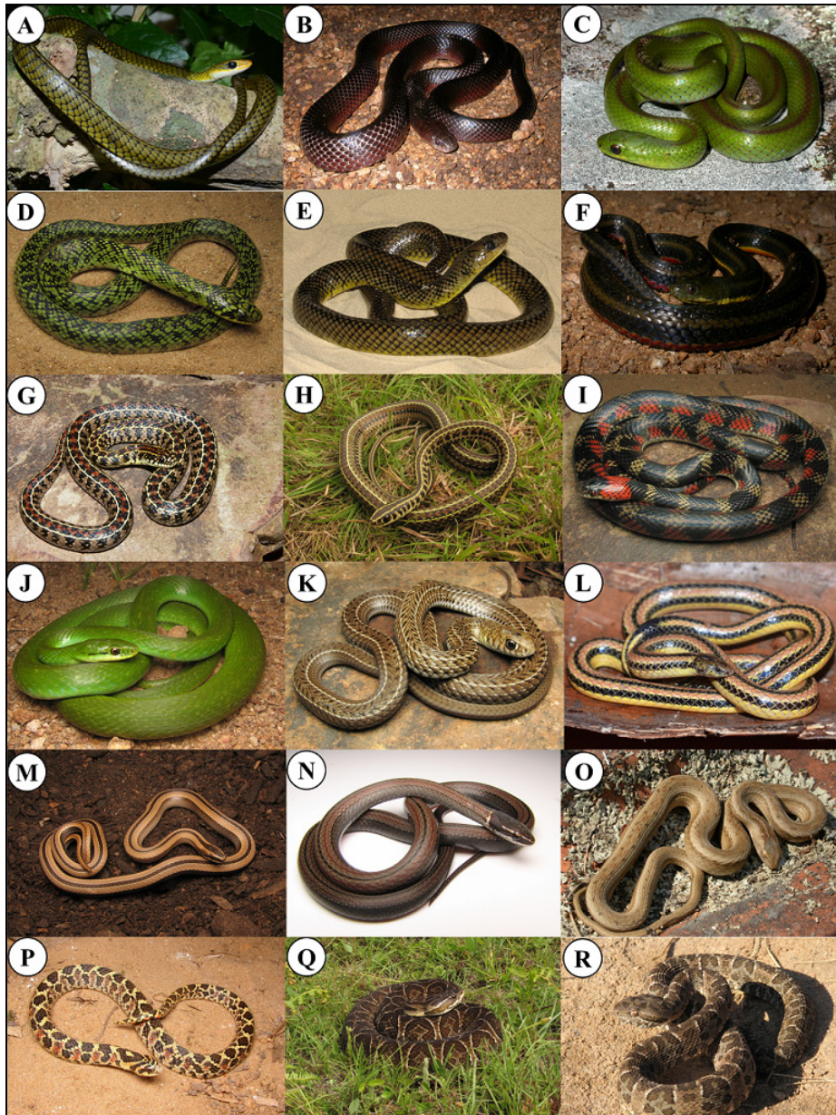
FIGURE 4. Snakes of the Taim Ecological Station. (A) Two-headed Sipo ( Chironius gouveai ); (B) Mussurana ( Boiruna maculata ); (C) Jaeger's Ground Snake ( Erythrolamprus jaegeri ); (D) Grass Snake ( Erythrolamprus poecilogyrus ); (E) Water Snake ( Erythrolamprus semiaureus ); (F) Water Snake ( Helicops infrataeniatus ); (G) Striped Snake ( Lygophis anomalus ); (H) Fronted Ground Snake ( Lygophis flavifrenatus ); (I) False Coral Snake ( Oxyrhopus rhombifer ); (J) Brazilian Green Racer ( Philodryas aestiva ); (K) Patagonia Green Racer ( Philodryas patagoniensis ); (L) Dumeril's Diadem Snake ( Phalotris lemniscatus ); (M) Wide Ground Snake ( Psomophis obtusus ); (N) Red Belly Grass Snake ( Taeniophallus poecilopogon ); (O) False Lancehead Snake ( Dryophylax hypoconia ); (P) South American Hognose Snake ( Xenodon dorbignyi ); (Q) Urutu ( Bothrops alternatus ); (R) Pampa's Jararaca ( Bothrops pubescens ). (Photographs A and L by Daniel Loebmann. Other photographs by Márcio Borges-Martins).

Rio Grande do Sul (Braun and Braun 1980) and is very common and relatively abundant in the places where it occurs, even in human-disturbed habitats (Patrick Colombo, pers. Comm.). Additionally, this species is easy to detect in field surveys. In Uruguay, in several areas with the same habitat physiognomies as the ESEC