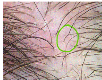
Figure 4: Pili torti (twisting of hairs) can occur for a variety of reasons. In someone with itching, burning or pain in the scalp, one must consider the possibility of a scarring alopecia.

On account that the primary case studies of FFA affecting siblings, [23-25] there had been an increasing quantity of studies of familial cases [26,27], suggesting a potential genetic predisposition and reviews are a foot to envision dead set establish genes which can be related to FFA. Nonetheless, genetic susceptibility on my own would no longer give an explanation for the apparent expand in FFA incidence.