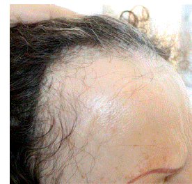
Figure 1: Frontal fibrosing alopecia.

50%) [17,18] than with FFA (1.6–9.9%) [3,9,15] lack of facial and hair concomitant with LPP is suggested in 7-10% (Figure 1) [16,18].