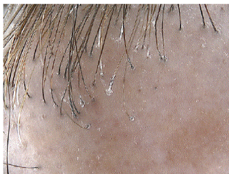
Figure 2: Affected scalp with alopecia.

Currently, there is not any epidemiological information on the incidence or incidence of FFA in the basic populace. Nevertheless, most papers released over latest years advise that the incidence of FFA could also be growing [3,4,9,15,21]. Diagrams from my possess hair hospital in Glasgow, UK show that the numbers of recent circumstances of FFA have increased vastly over the last 16 years, each in terms of absolute number and as a percent of the whole number of latest circumstances obvious yearly.