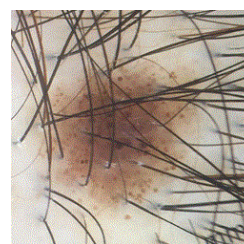
Figure 5: Dark colored moles on the scalp need to be carefully examined. Skin cancers, such as melanomas can occur. The regular appearance of this mole confirms it is not a cancer. The brown globules are uniform in size and color and somewhat symmetrically located throughout the lesion.

It has been planned that clusters of affected cases at intervals families could indicate not solely genetic susceptibleness however viable environmental triggers [26] Karnik et al. [28] released experimental proof that tested a possible position for peroxisome proliferator activated receptor-gamma (PPAR-gamma) in pathologic process of LPP. They established that PPAR-gamma, a transcription issue that belongs to the nuclear receptor tremendous-gene worshipped ones, is needed for preservation of cyst stem cells and valid that mice with PPAR-gamma deleted from cyst stem cells developed a scarring phalacrosis. In scalp biopsies from patients with LPP, it had been found that PPAR-gamma was down-regulated in hair follicles. The authors postulated a possible perform for xenobiotic metabolism as AN environmental set out for LPP, by means that of the aryl organic compound receptor (AhR). Environmental toxins resembling dioxin-like provides, prompt AhR that is known to suppress PPAR-gamma [28]. The position of PPAR-gamma and AhR in FFA stay to be elucidated (Figure 5) [26].